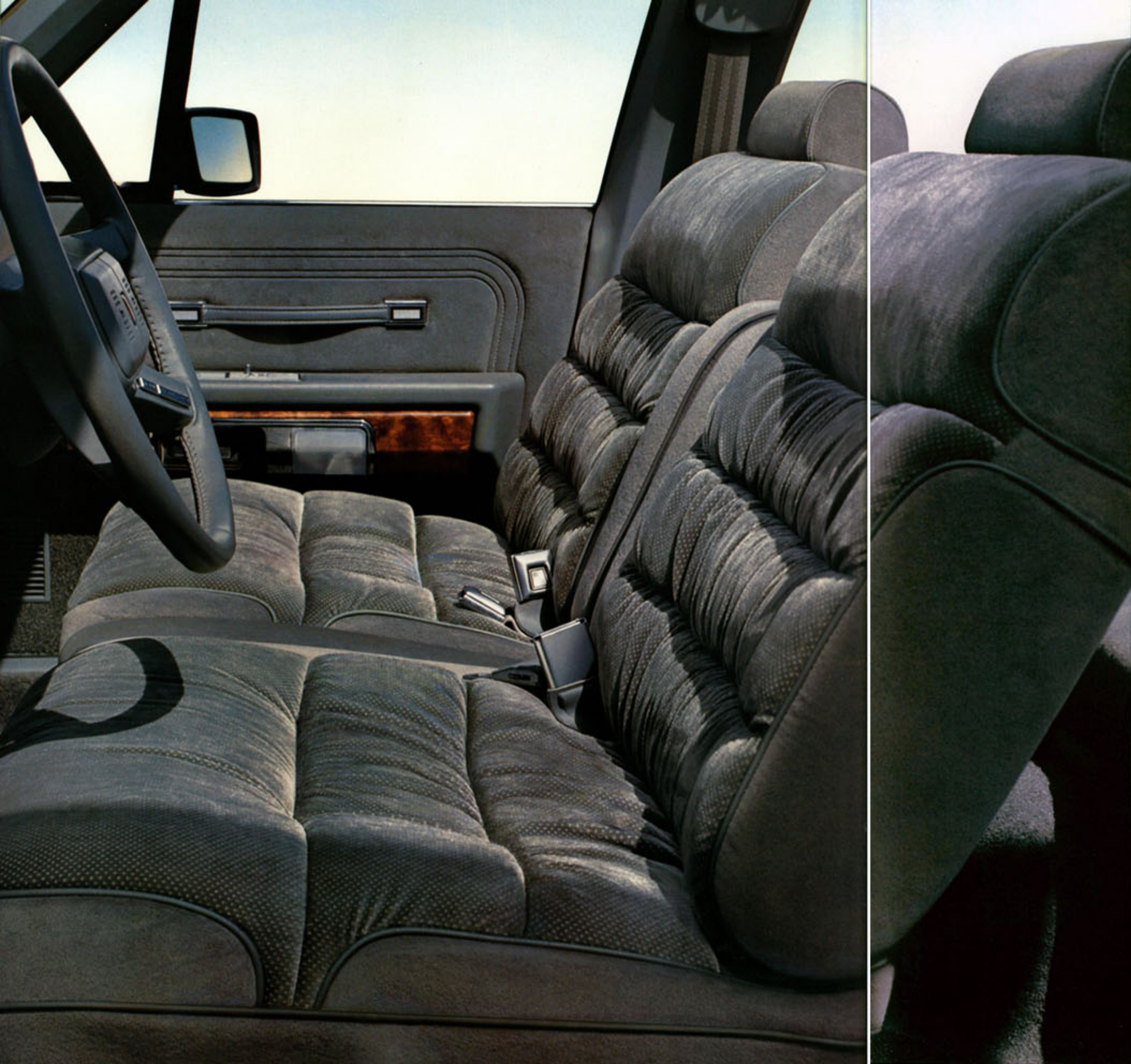
Grand Marquis LS interior in Smoke. Some features shown may be optional. See option list on page 13.

Grand Marquis lets you invest in your own space program. Even carrying six people and their luggage, you'll have room to spare.