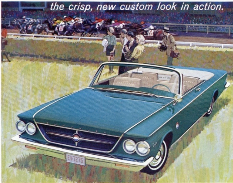
(Convertible in Forest Green with Alabaster interior.)

The Chrysler 300. Few sports cars have its go. None have its deep comfort. A crisp, custom beauty that generates excitement just standing still.