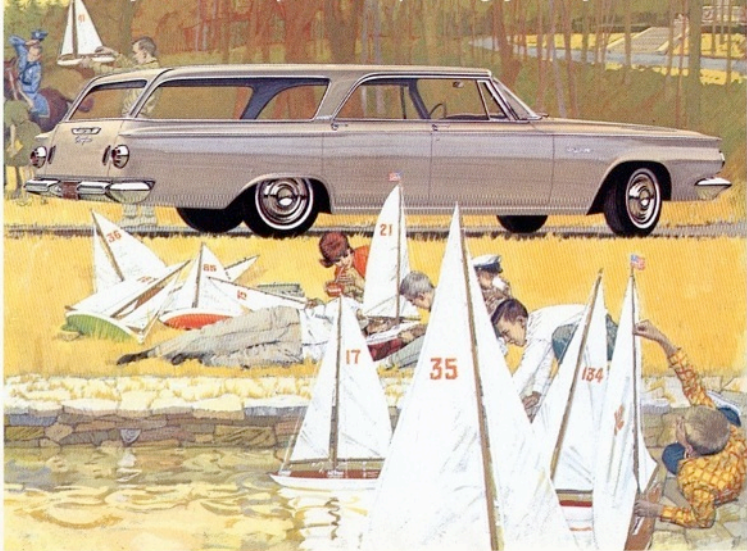
(6-Passenger Town and Country Wagon in Fawn with Alabaster and Black interior.)

The 1963 Chrysler Newport. Full-sized. Surprisingly low priced. Pure Chrysler. A crisp, custom beauty in five different models. Two-door hardtop. Convertible. Four-door sedan. Four-door hardtop. Town and Country wagon.