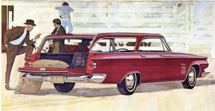
(9-Passenger Town and Country Wagon in Claret with Black interior.)

the crisp, new custom look at its finest.