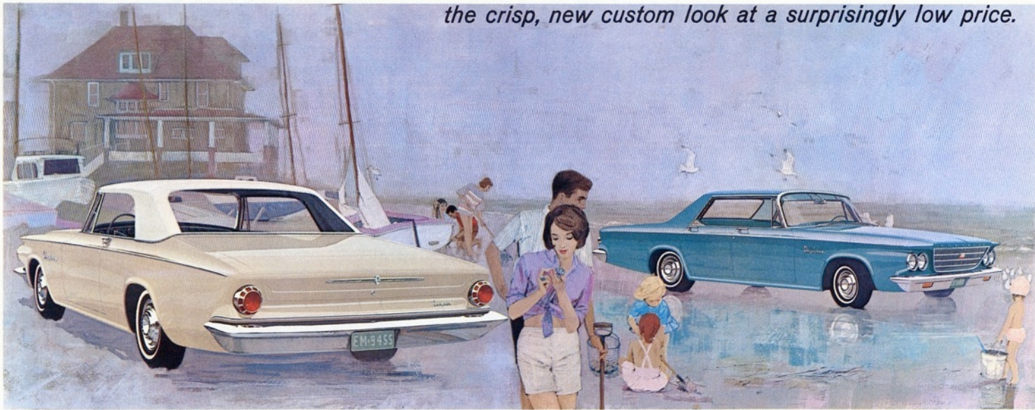
(Convertible in Alabaster with Tan interior.)

the crisp, new custom look at a surprisingly low price.