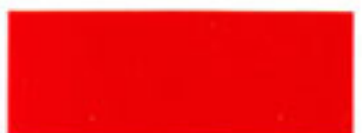
*Lipstick Red 2U