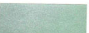
*Light Jade Diamond Fire 7B