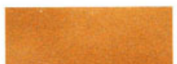
Bronze Gold Diamond Fire 54