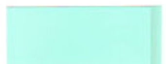
*Light Jade 7A