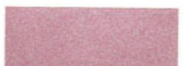
*Rosé Diamond Fire 2T