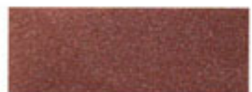
Medium Taupe Diamond Fire 2P