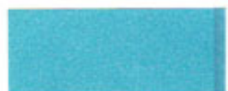
Aqua Blue Diamond Fire 45