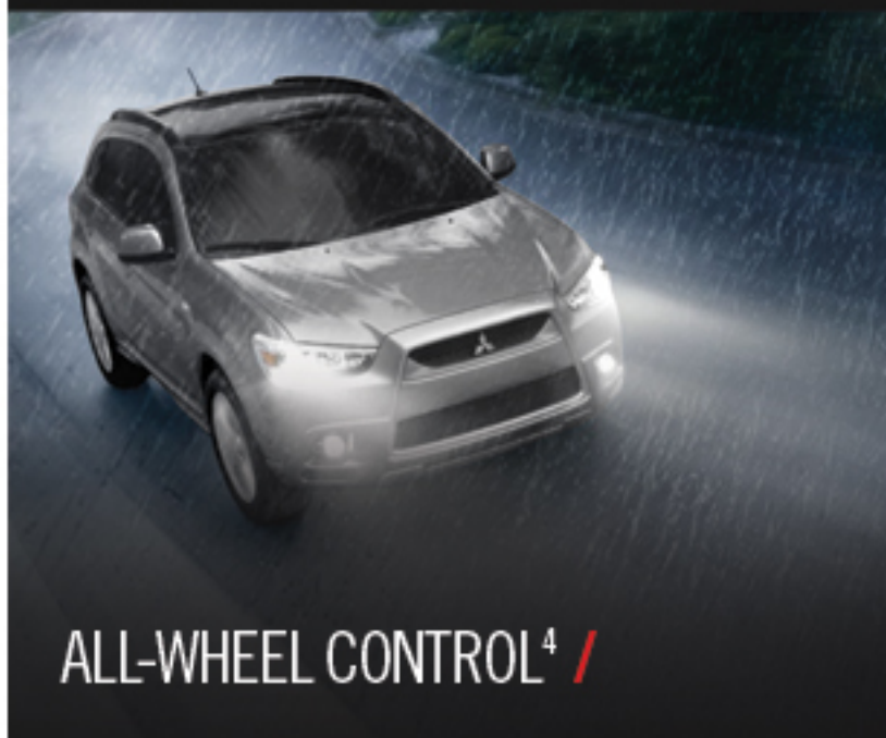
ALL-WHEEL CONTROL 4 /