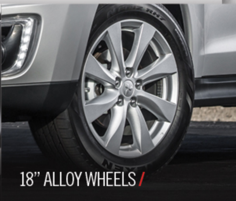
18" ALLOY WHEELS /