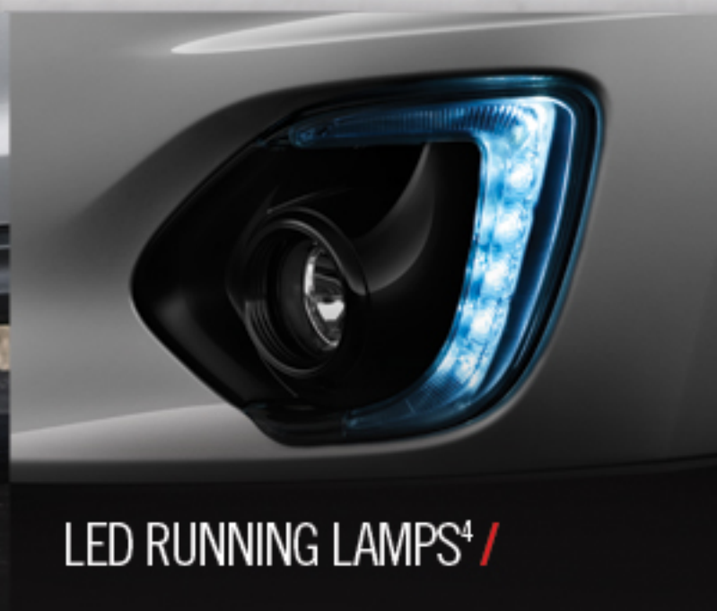
LED RUNNING LAMPS 4 /