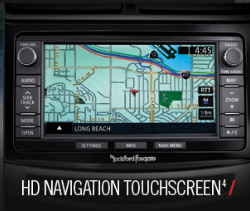
HD NAVIGATION TOUCHSCREEN 4 /