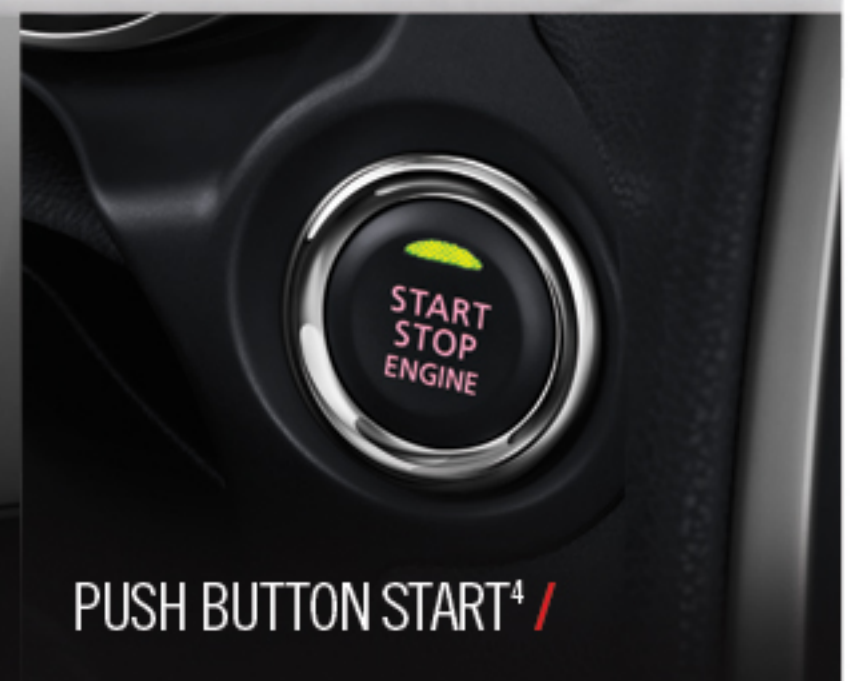
PUSH BUTTON START 4 /