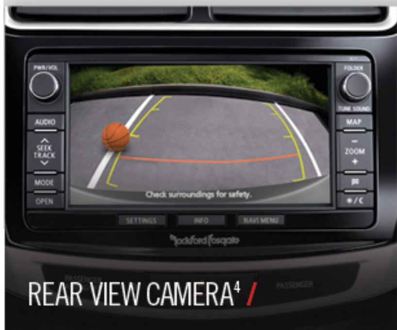
REAR VIEW CAMERA 4 / PASSENGER