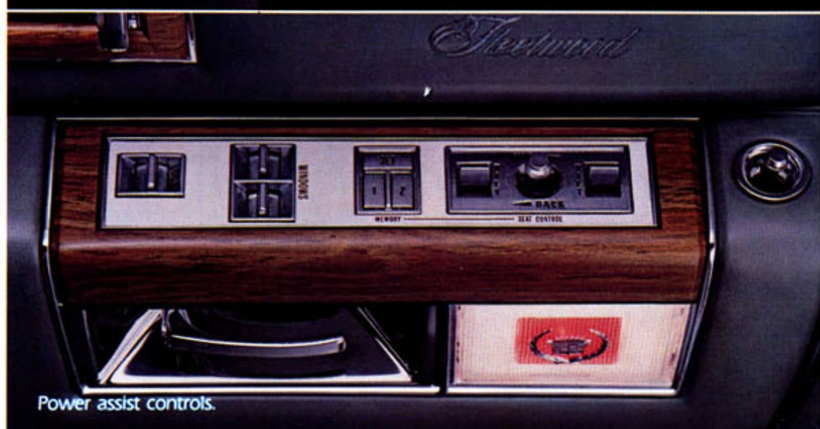
Power assist controls.