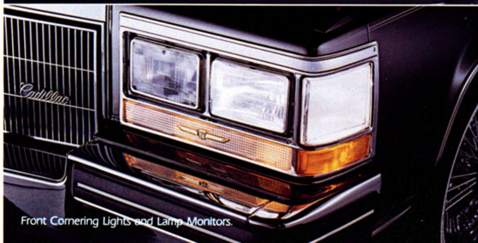
Front Cornering Lights and Lamp Monitors.