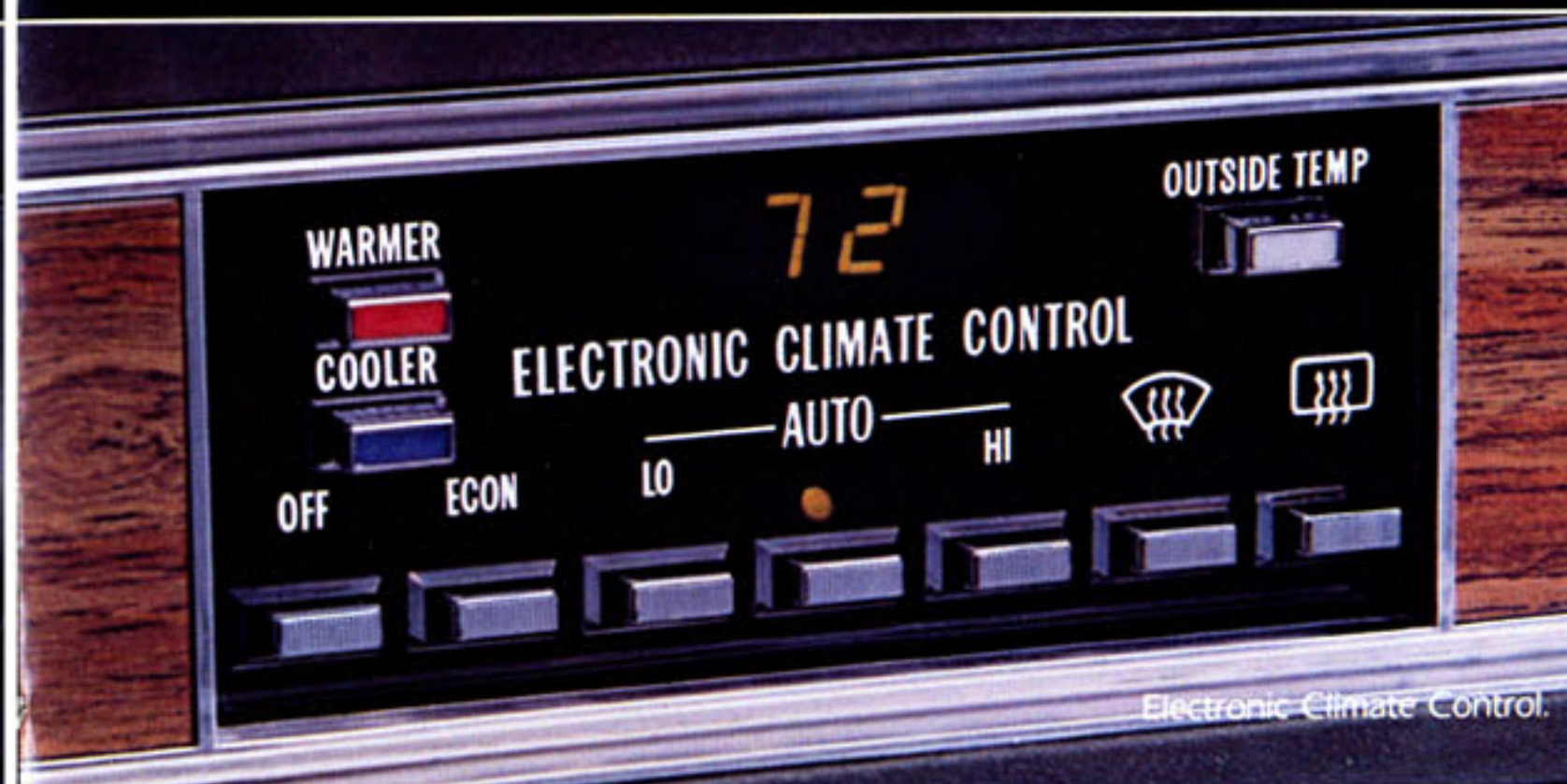
Electronic Climate Control.