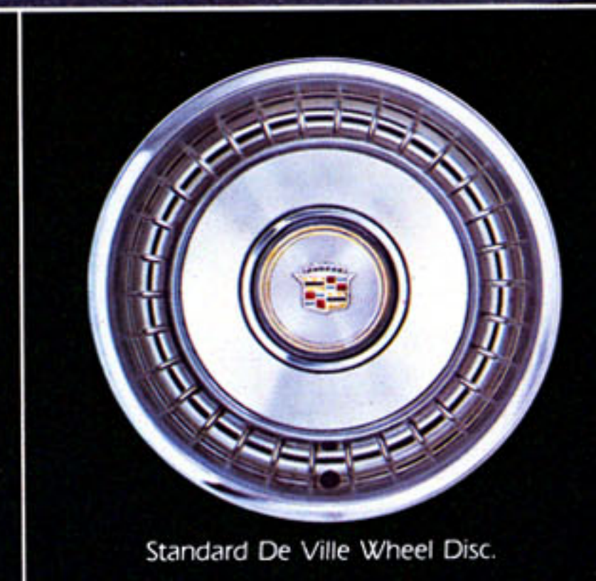
Standard De Ville Wheel Disc.