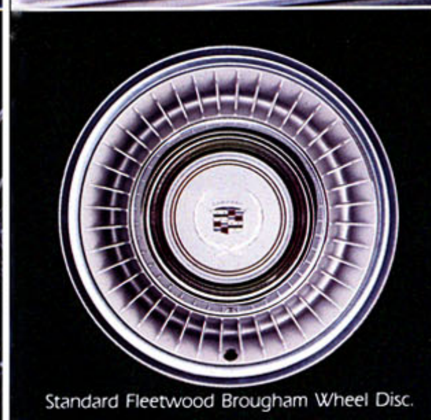
Standard Fleetwood Brougham Wheel Disc.