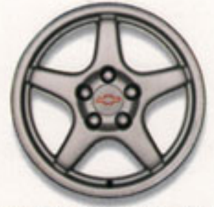
17" cast-aluminum wheel. Included in SS Performance/ Appearance Package.