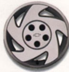
16" bolt-on wheel cover. Standard on Camaro.