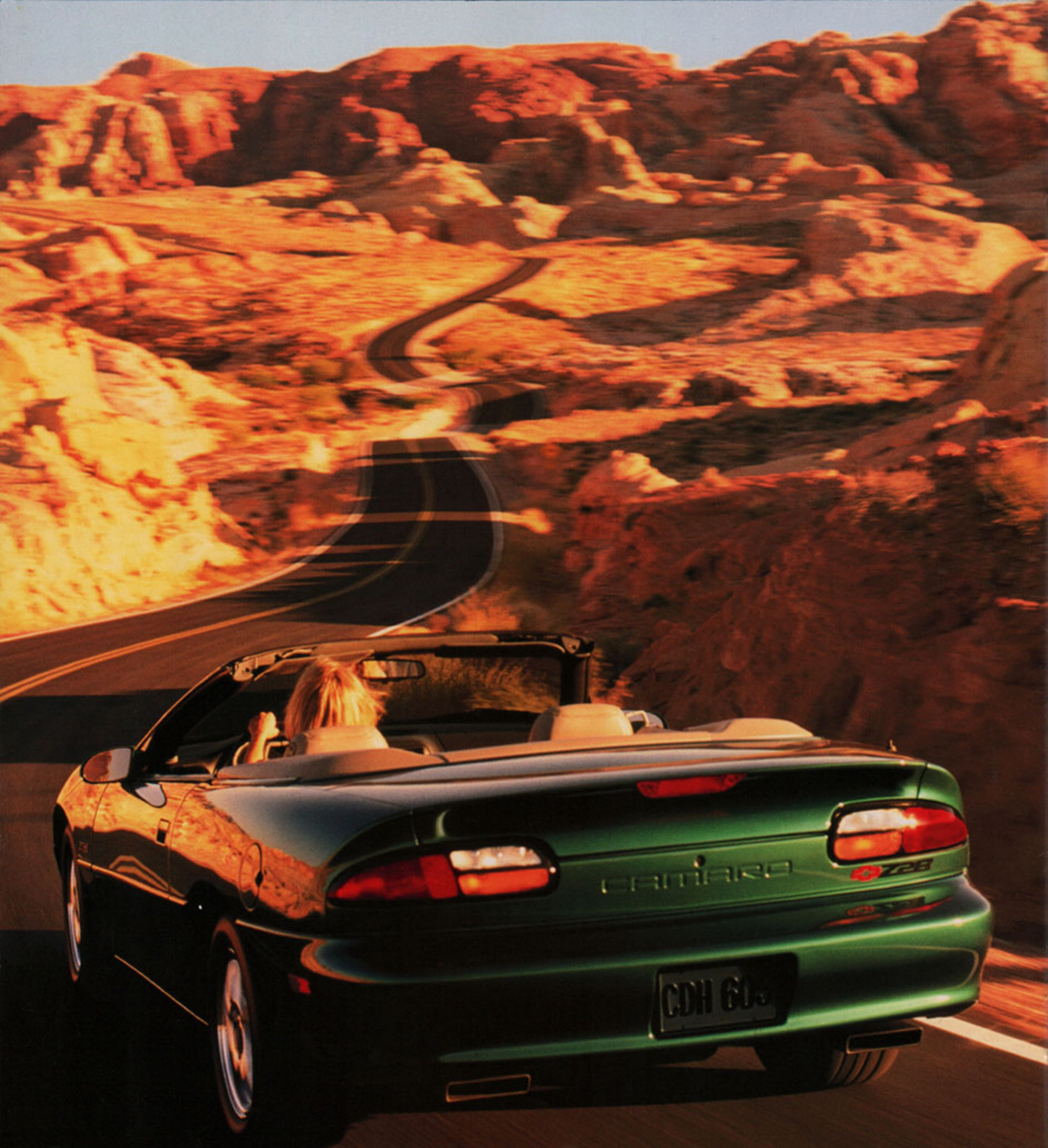
Camaro Z28 Convertible in Bright Green Metallic. Some optional equipment shown.