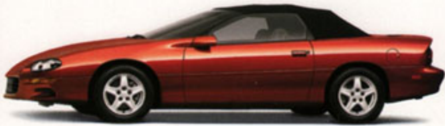
Cayenne Red Metallic (not available with Sport Appearance Package) Available Interiors: Dark Gray, Neutral, White