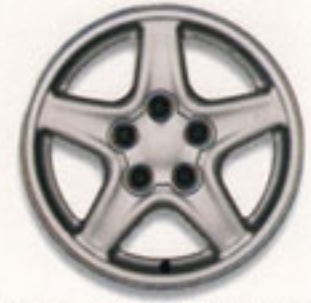
16" cast-aluminum wheel. Standard on Z28, optional on Camaro.