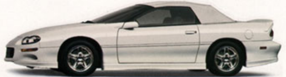
Arctic White Available Interiors: Dark Gray, White, Neutral, Red Accent