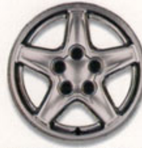
16" chrome-aluminum wheel. Optional on all models.