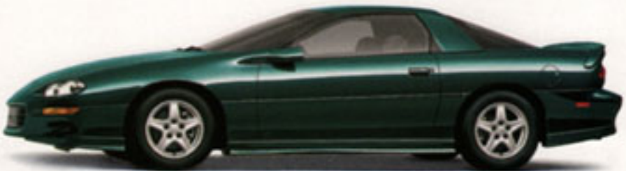
Mystic Teal Metallic (not available with Sport Appearance Package) Available Interiors: Dark Gray, Neutral, White