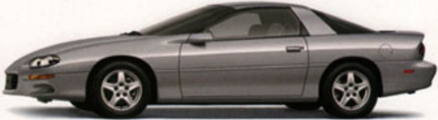
Sebring Silver Metallic Available Interiors: Dark Gray, White, Red Accent