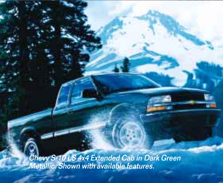
Chevy S-10 LS 4x4 Extended Cab in Dark Green Metallic. Shown with available features.

With four real doors and seating for five, there's lots of room in S-10 Crew Cab 4x4 models. And you'll appreciate the long list of standard features like a factory-installed bedliner, cruise control and Remote Keyless Entry. Also standard are the Insta-Trac 4x4 system and a 190-hp Vortec 4300 V6 engine.