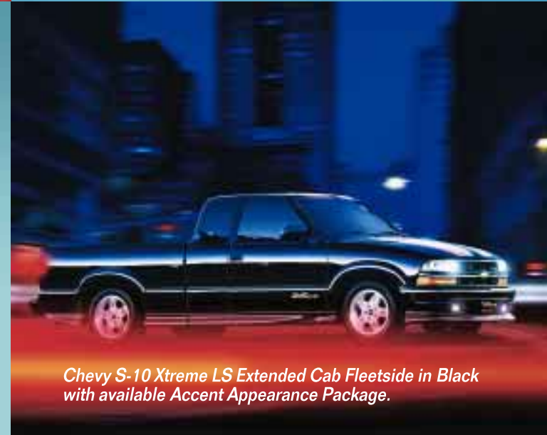
Chevy S-10 Xtreme LS Extended Cab Fleetside in Black with available Accent Appearance Package.

Make a lasting impression with Chevy S-10 Xtreme. Its sleek, street cruising look can be further enhanced with an available Stripe Appearance Package, Accent Appearance Package or new Heat Appearance Package. Go to chevy.com to customize your own Xtreme.