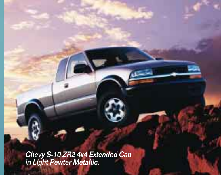
Chevy S-10 ZR2 4x4 Extended Cab in Light Pewter Metallic.

Shown is the Crew Cab 4x4 interior in Graphite with available leather seating surfaces. You may also choose a Deluxe Cloth interior with a 60/40 split-bench front seat. (interim availability).