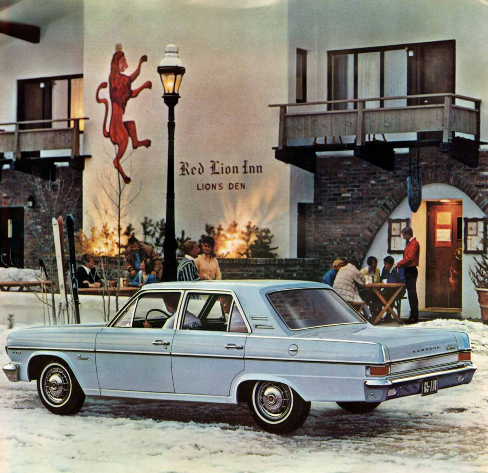
1965 Rambler Classic 770 4-Door Sedan