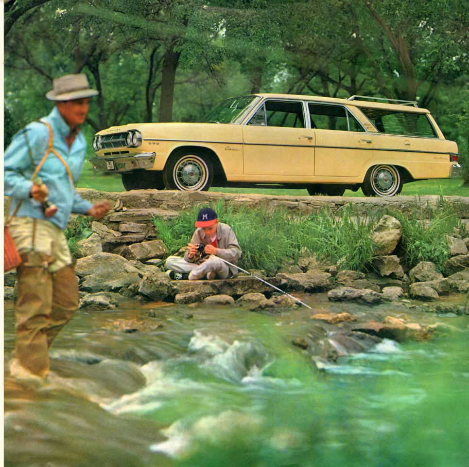
1965 Rambler Classic 770 Cross Country