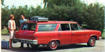
1965 Rambler Classic 550 Cross Country