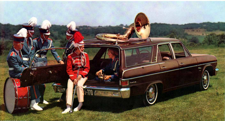
1965 Rambler Classic 770 Cross Country with optional 3rd Seat and Side-Hinged Tailgate Door

Whether it be for sensible cross-country travel on family vacation trips or workaday shopping and business jaunts around town, you'll find the versatile Rambler Classic Station Wagon just right for you. Handy Roof-Top Travel Rack is standard on all 1965 Classic Station Wagon models. Spectacular in appearance and provides extra carrying capacity. Hidden compartment under rear deck safeguards valuables. The large Cross Country cargo area has lots of room for family travel gear and equipment.