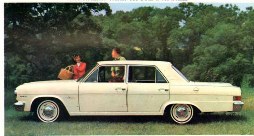
1965 Rambler Classic 550 Four-Door Sedan