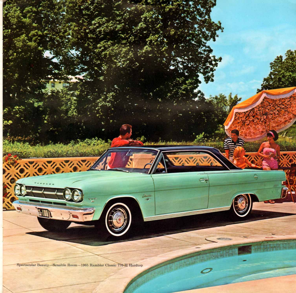
Spectacular Beauty—Sensible Room—1965 Rambler Classic 770-H Hardtop