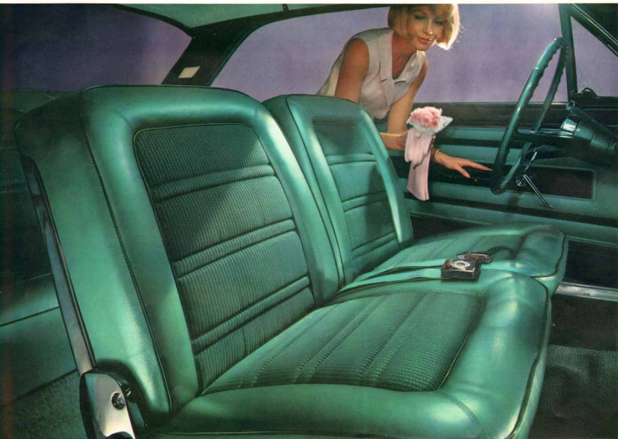
Wide bucket seats are standard on the Classic 770-H

Spectacular as all outdoors, yet snug as your living room when you want it to be! That's the all-new Rambler Classic Hardtop for 1965. The Classic's vigorous new styling is apparent in the tastefully sculptured hood and body lines. You can tailor your Classic Hardtop to your own taste with seven beautiful interior colors and wide choice of seat options, including slim bucket seats with console. 770 model on cover.