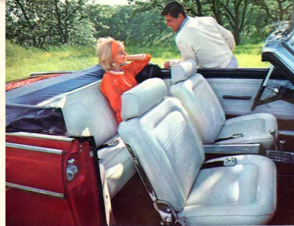
Weather-resistant, all-vinyl upholstery and trim are standard on the new Classic Convertible. Bucket seats, console, stick shift, headrests, optional.

Rambler Classic—the new intermediate-size Rambler—is one of three Sensible Spectaculars from Rambler for 1965. These are the biggest, most powerful Classics ever built. All offer new Spectacular Performance—Sensible Gas Mileage—Five Engine Choices—Six and V-8. All the fresh new spirit, the increased overall length and advanced styling are exemplified in this happiest of models—the all-new 770 Convertible. Here is the vitality of youth—the promise of fresh-air fun in a rock-solid car that extends for 195 beautiful inches. Power-operated convertible top is standard in white, black, blue and aqua. Weather-resistant all-vinyl upholstery and trim are standard on this smart, new Classic Convertible.