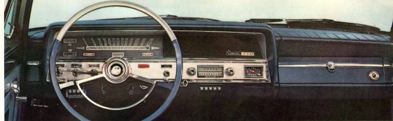
The Rambler Classic instrument panel is all-new in style and concept. Padded panel and visors, optional.