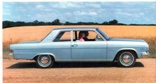
1965 Rambler Classic 550 Two-Door Sedan