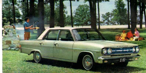
1965 Rambler Classic 660 Four-Door Sedan