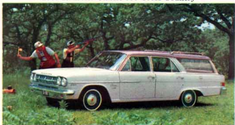
1965 Rambler Classic 660 Cross Country