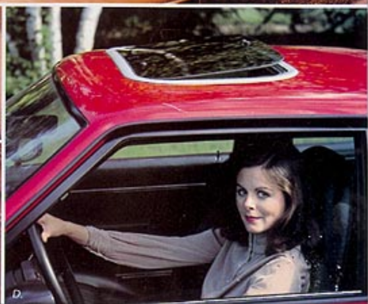
A. Limited Wagon Interior in Chelsea Leather B. Cruise Control (available w/auto transmission only) C. 6-Way Power Seat (Optional) D. Pop Up Sun Roof (Optional NA Wagon)