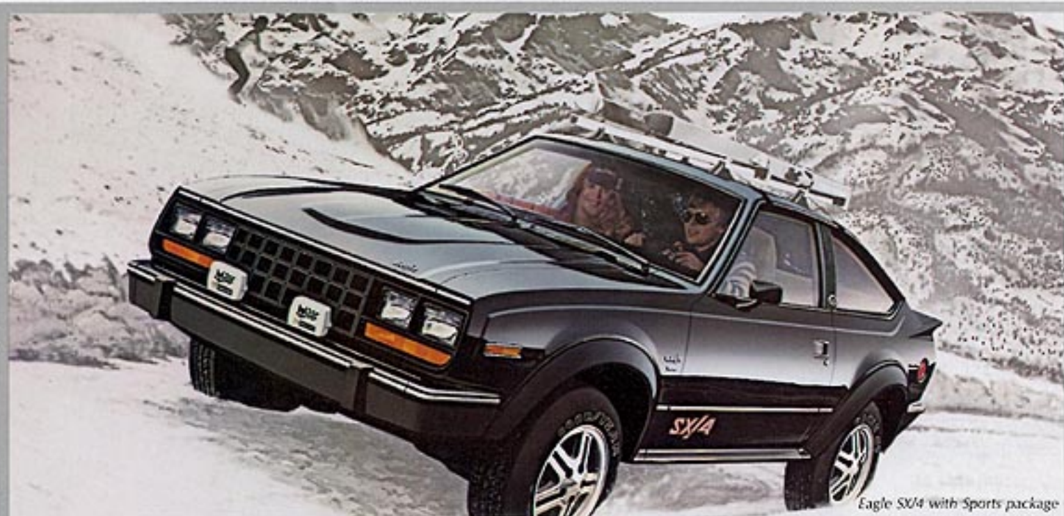
Eagle SX/4 with Sports package

For a complete review of Eagle standard features and popular options see your American Motors Dealer.