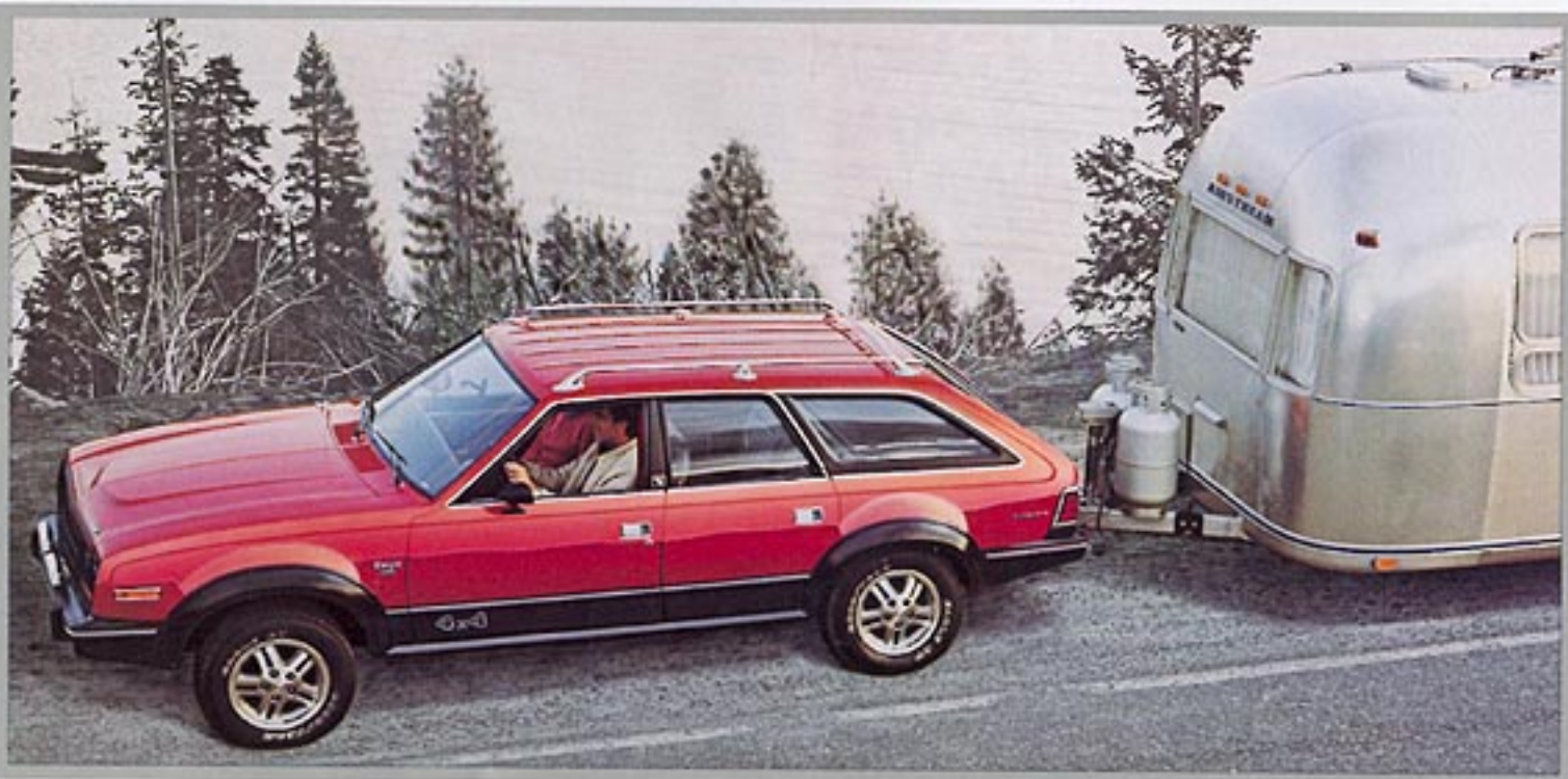
Eagle Wagon with Sport Package