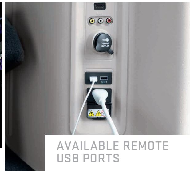
AVAILABLE REMOTE USB PORTS