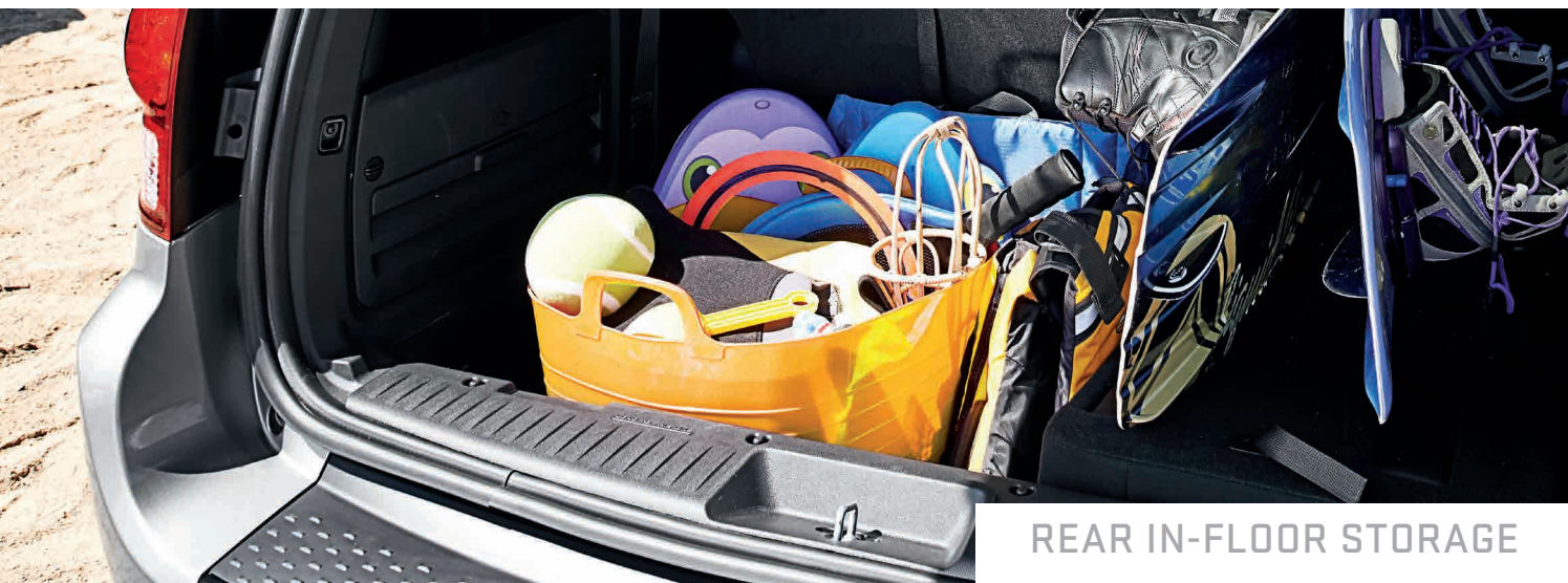
REAR IN-FLOOR STORAGE