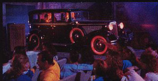
Witness a classic gangster shoot-out in "The Great Movie Ride."

THE Heartbeat OF AMERICA TODAY'S CHEVROLET