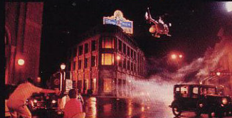
Take a fascinating backlot stroll down a classic New York street.