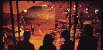
Experience live soundstage productions behind the scenes.