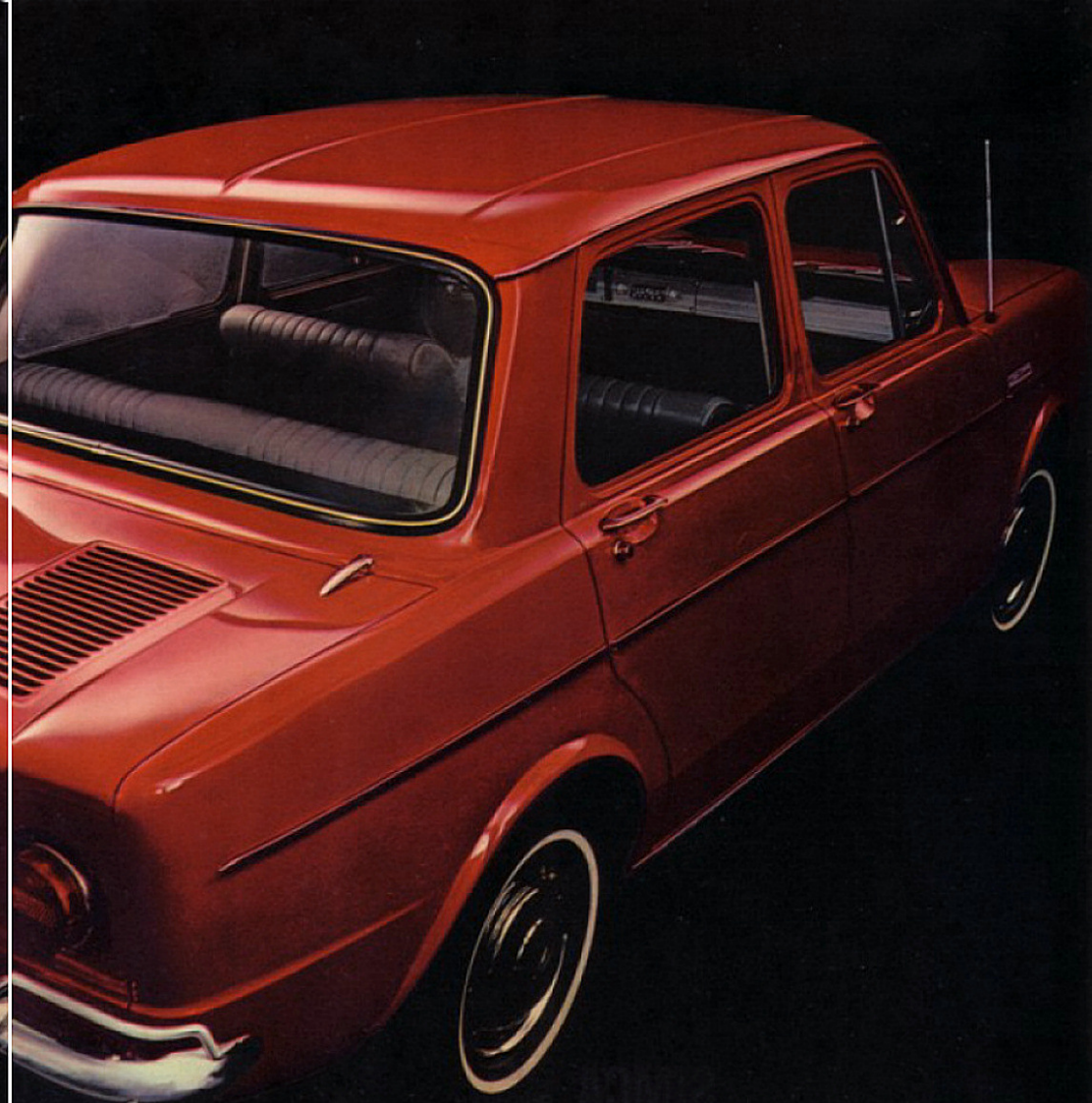
on cover, Simca GLS in Estoril Blue. Shown here (from left to right), Simca GLS in Murphy Grey, Simca Deluxe in Turner Red and Simca 1000 in Montreux Blue.