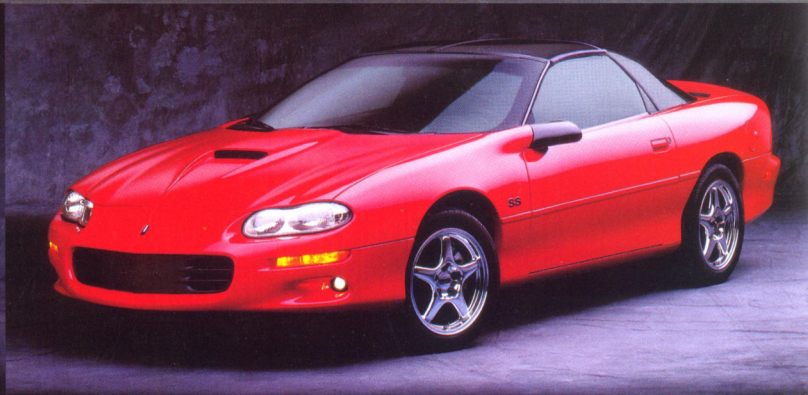
Camaro SS shown with SLP's optional chrome wheels and Performance Exhaust with dual-dual outlets.