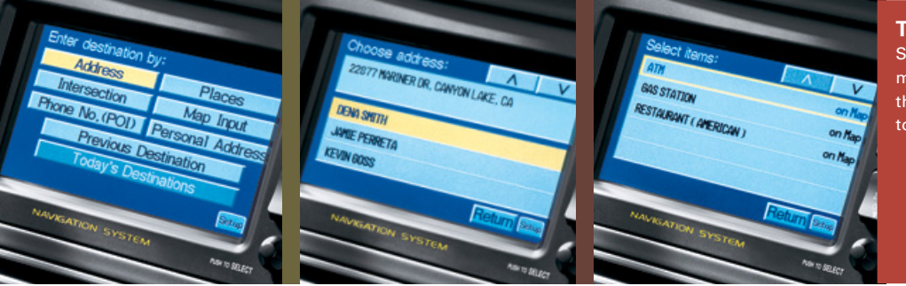
The path is clear. System menus and maps are easy to see, thanks to the 6-inch touch-screen display.

Available on select EX models, the Honda Satellite-Linked Navigation System' is the best and last excuse you'll ever need for not stopping for directions. Using signals from global positioning system (GPS) satellites and an onboard internal guidance system, it pinpoints your location virtually anywhere in the 48 contiguous U.S. states." An 8.0-gigabyte DVD database holds maps of major metropolitan and rural areas, as well as 7 million points of interest. Zero in on a destination and the system guides you with clear voice prompts and a moving map display. It'll even track your path off-road with electronic "bread crumbs."