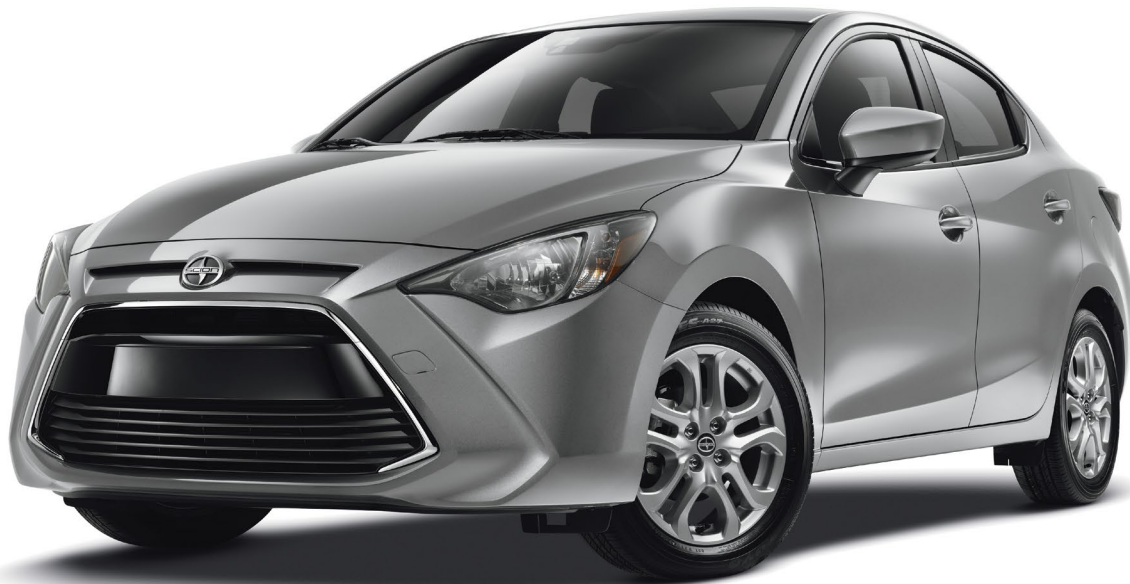
Color Shown Sterling

This is Scion's first sedan. Sophisticated, sculpted styling with an aggressive grille, this car's got the looks and the features to help you arrive in style.