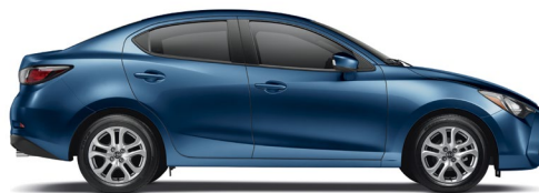
Length 171.7 In.