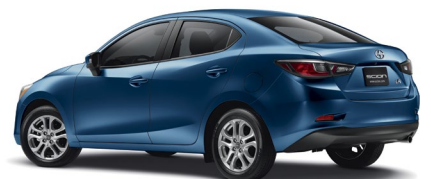
Height 58.5 In.