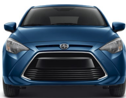
Width 66.7 In.