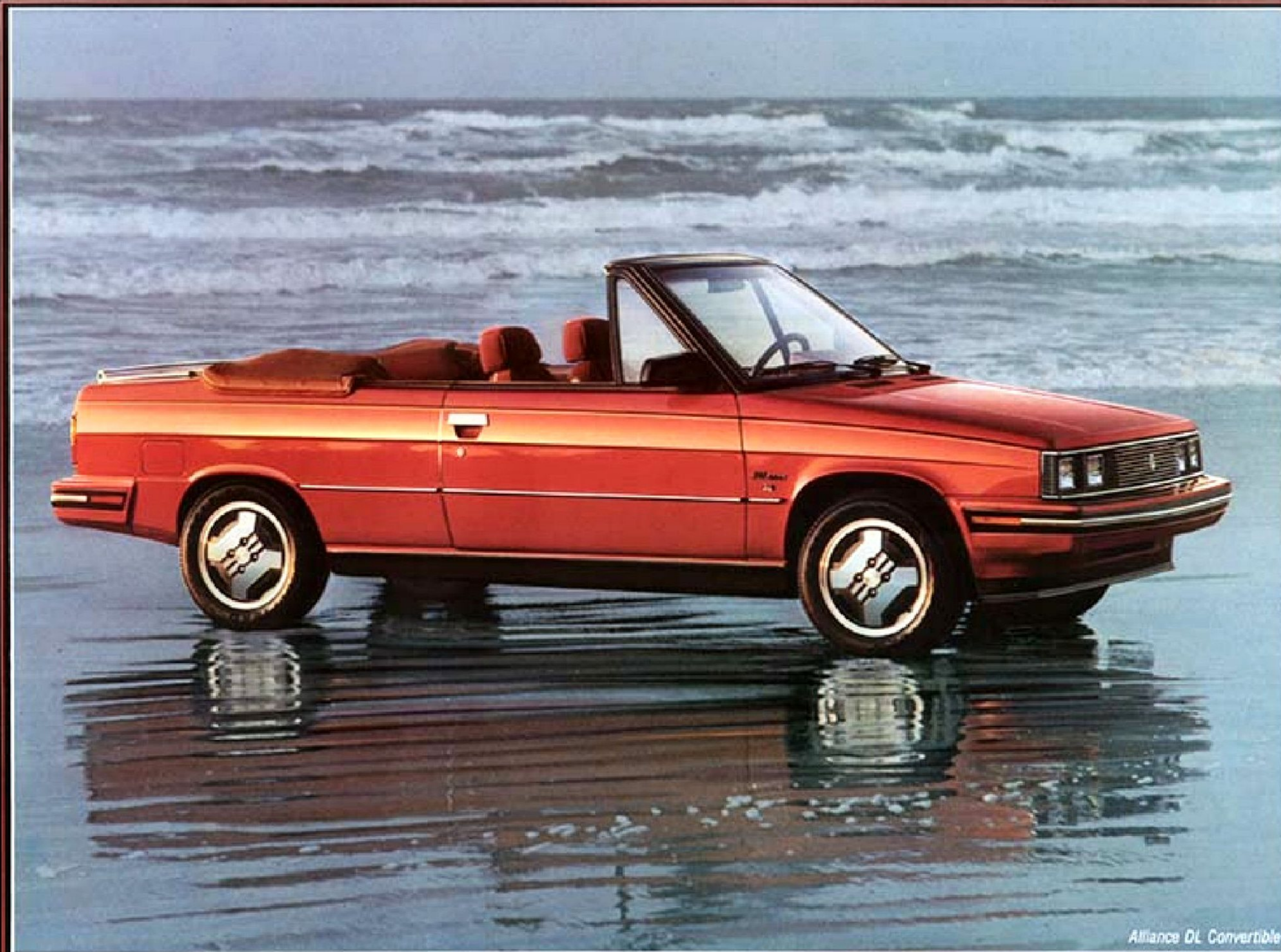
Alliance DL Convertible