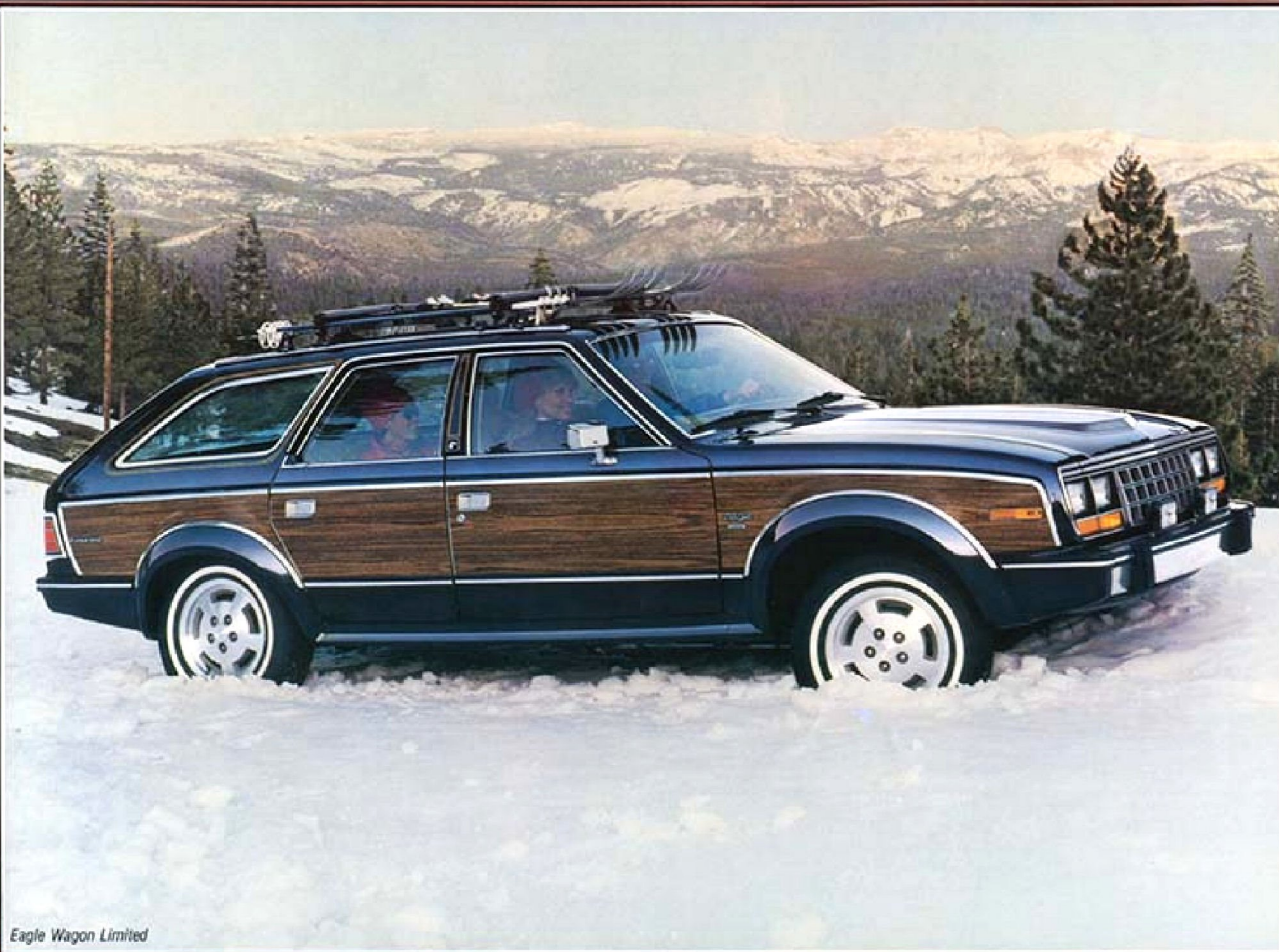
Eagle Wagon Limited