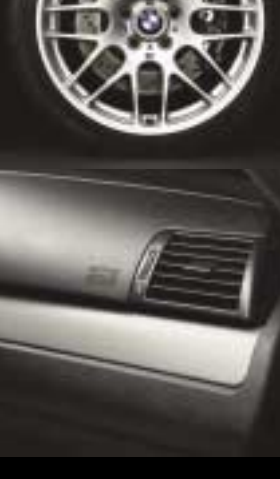
*See previous page.