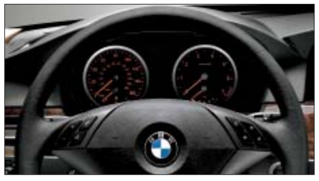
Primary gauges are recessed under a cowl, and designed for glare-free vision during the day. At night, the gauges glow in a color that is restful on the eyes.