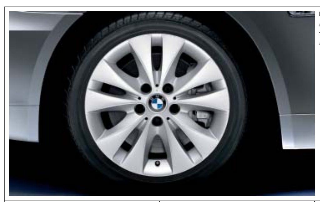
■ 17 x 7.5 Double Spoke (Style 116) cast alloy wheels and 225/50R-17 all-season tires. (std. 550i; spare is a space-saver wheel and tire)