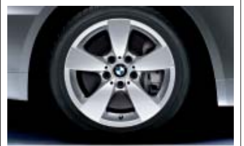
■ 17 x 7.5 Star Spoke (Style 138) cast alloy wheels and 225/50R-17 all-season tires. (std. 525i/xi and 530i/xi; spare is a space-saver wheel and tire)