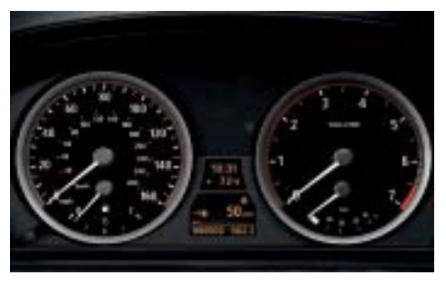
■ Easy-to-read Information Display with precise, dazzle-free analog indicators. Data, such as trip mileage counter, can be checked using LCD displays on the instrument panel.