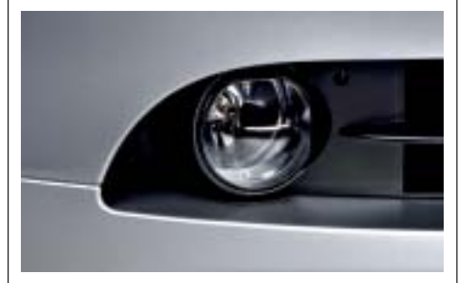
■ Halogen free-form foglights, integrated into the deep front spoiler, enhance your margin of safety in bad visibility. Ellipsoid free-form technology ensures even light distribution on the road.

■ / □ Xenon Adaptive Headlights provide brilliant clarity of the road ahead and to the side at night and in conditions with poor visibility. The dynamic auto-leveling feature adjusts for varying passenger and cargo loads, helping to keep headlight glare out of the eyes of oncoming drivers. BMW Adaptive Headlights provide optimum road illumination around corners, thanks to an electromechanical control system that directs the headlights into and through the bend as soon as the vehicle begins cornering. (std. 530i/xi and 550i; opt. on 525i/xi)