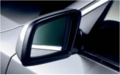
■ Power-adjustable heated side-view mirrors are blue-tinted; the back side matches the body color.