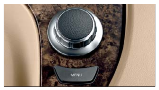
The iDrive Controller, which is conveniently located on the center console, allows you and your passenger to access and tailor many comfort features.