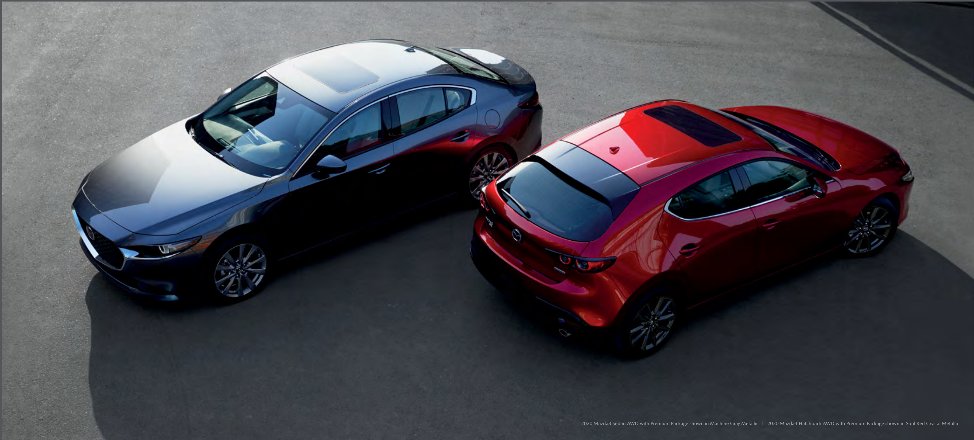
2020 Mazda3 Sedan AWD with Premium Package shown in Machine Gray Metallic | 2020 Mazda3 Hatchback AWD with Premium Package shown in Soul Red Crystal Metallic