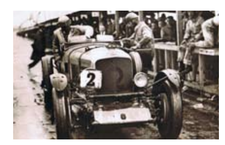
The challenging Brooklands banked racetrack, which this year celebrates its centenary, was the birthplace of British motor racing. During the 1920s and early thirties, Brooklands, located in Surrey, England, was the scene of some of Bentley's greatest racing triumphs, forging an inextricable link between the company's motorsport heritage and this historic race circuit.

"BENTLEY'S PROUD SPORTING PEDIGREE WAS THE INSPIRATION FOR OUR NEW BROOKLANDS COUPE, CAPTURING ALL THE STYLE, POWER AND SPLENDOUR OF THAT ERA."