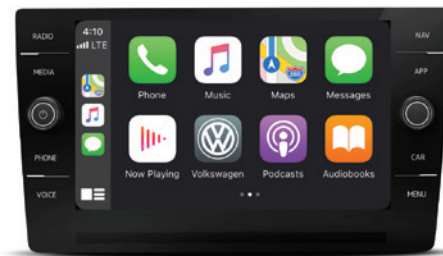
Apple CarPlay integration for your iPhone shown.

App-Connect allows you to connect your compatible smartphone with Apple CarPlay® (below), Android Auto™, or MirrorLink® to access select apps on the touchscreen display. From streaming music to mobile apps, it can be accessed on the touchscreen.