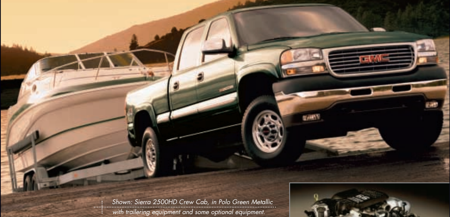
Shown: Sierra 2500HD Crew Cab, in Polo Green Metallic with trailering equipment and some optional equipment.

With a variety of powertrains, the 2002 line of heavy-duty Sierra® pickups offer more powerful engines, higher gross vehicle and cargo weight ratings, and higher towing ratings than any other full-size pickups or Chassis Cabs in their class. 1 Whatever your needs, there's a Sierra Heavy Duty truck built to support them.