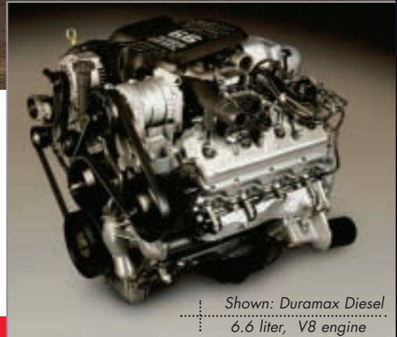
Shown: Duramax Diesel 6.6 liter, V8 engine

With a variety of powertrains, the 2002 line of heavy-duty Sierra® pickups offer more powerful engines, higher gross vehicle and cargo weight ratings, and higher towing ratings than any other full-size pickups or Chassis Cabs in their class. 1 Whatever your needs, there's a Sierra Heavy Duty truck built to support them.