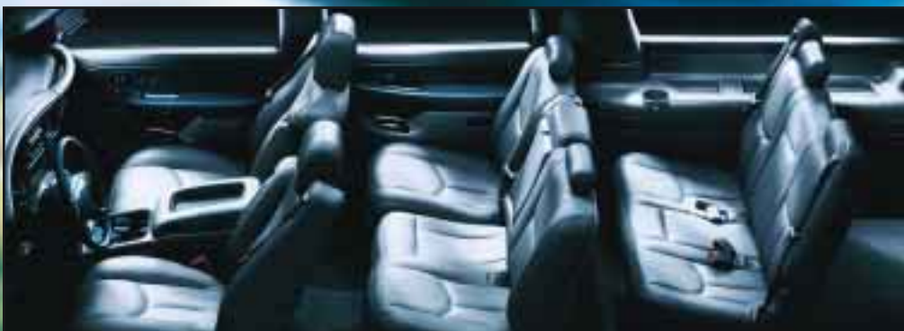
YUKON XL SLT INTERIOR SHOWN WITH AVAILABLE EQUIPMENT.

The Yukon ® line of full-size SUVs is designed to move like no other. Every Yukon model is engineered for surprising agility, whether you're deftly handling traffic or maneuvering through a tight parking garage. A variety of features combines to produce their exceptional responsiveness, including the revolutionary QUADRASTEER* four-wheel steering system, available on Yukon XL 3/4-ton models. Driving a Yukon or Yukon XL may very well shatter your assumptions about the handling capabilities of a full-size SUV.