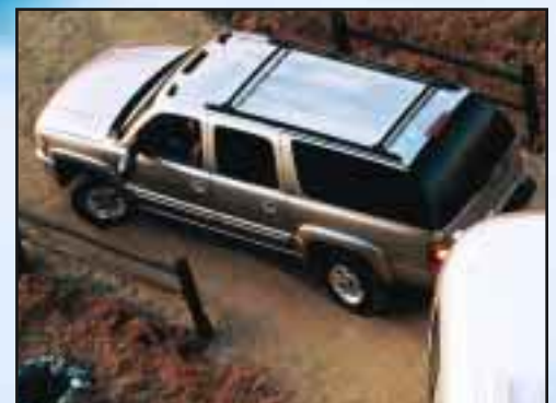
YUKON XL 3/4-TON IN PEWTER METALLIC WITH OPTIONAL QUADRASTEER* AND OTHER AVAILABLE EQUIPMENT.

*QUADRASTEER is only available on 3/4-ton Yukon XL models. See back for further details.