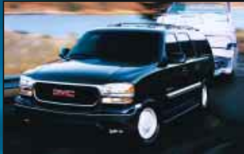
YUKON XL IN CARBON METALLIC SHOWN WITH AVAILABLE EQUIPMENT.