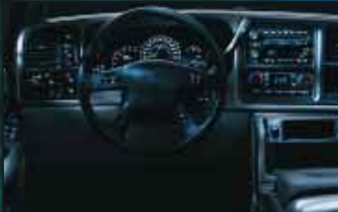
YUKON SLT INSTRUMENT PANEL SHOWN WITH AVAILABLE EQUIPMENT.