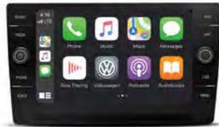
Apple CarPlay integration for your iPhone shown.

App-Connect allows you to connect your compatible smartphone with Apple CarPlay® (below), Android Auto™, or MirrorLink® to access select apps on the touchscreen display. From streaming music to mobile apps, it can be accessed on the touchscreen.