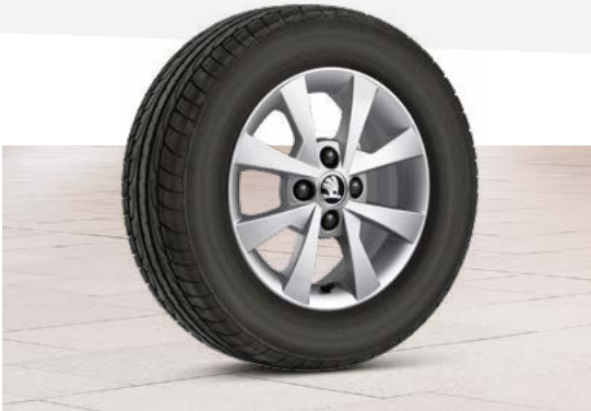
14" APUS ALLOY WHEELS

Already one of the best-equipped small cars in the city, the SE adds further style and comfort enhancing features.