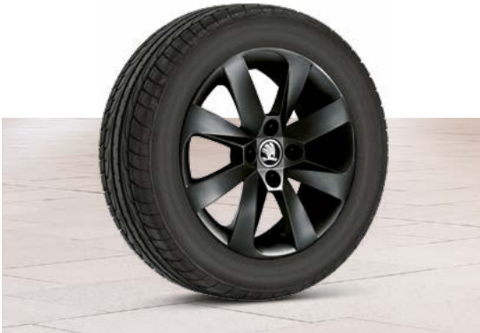
15" CRUX ALLOY WHEELS - IN A CHOICE OF BLACK OR WHITE

Eye-catching in every way, the Colour Edition is packed with extra equipment and offers a wide choice of contrasting roof and body colours.