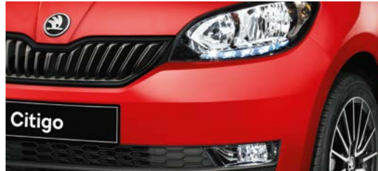
MONTE CARLO EXTERIOR STYLING