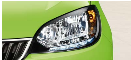
HALOGEN TWIN HEADLIGHTS WITH SEPARATE LED DAYTIME RUNNING LIGHTS