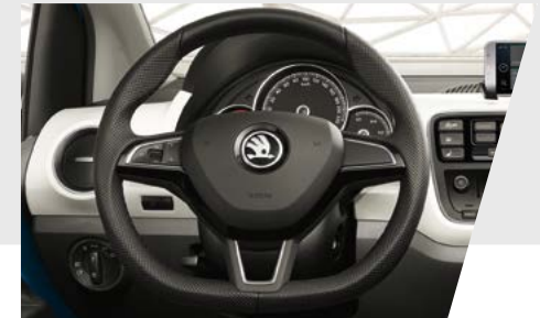
LEATHER MULTIFUNCTION STEERING WHEEL