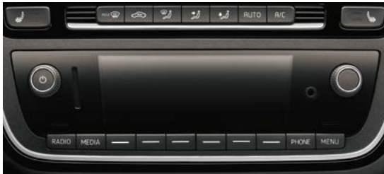
RADIO BLUES WITH CD PLAYER, USB PORT AND TWO SPEAKERS

Packed with thoughtful touches and clever technology, this entry-level trim offers impressive value for money.