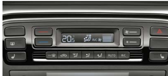
CLIMATE CONTROL AIR CONDITIONING