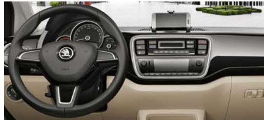
LEATHER STEERING WHEEL WITH GRAIN DASHBOARD