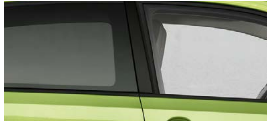
PRIVACY GLASS ON THE REAR WINDOWS