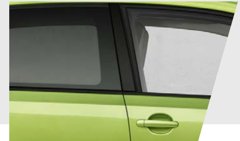
PRIVACY GLASS ON THE REAR WINDOWS