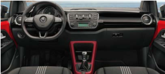
MONTE CARLO INTERIOR STYLING

A celebration of ŠKODA's many adventures on the racetrack, this level features dynamic design touches and includes an exclusive Monte Carlo logo throughout.