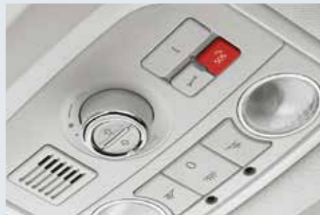
EMERGENCY CALL BUTTON