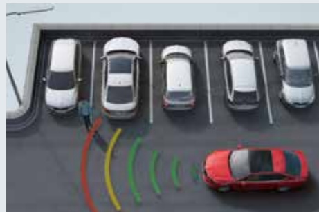
FRONT ASSIST WITH PREDICTIVE PEDESTRIAN PROTECTION