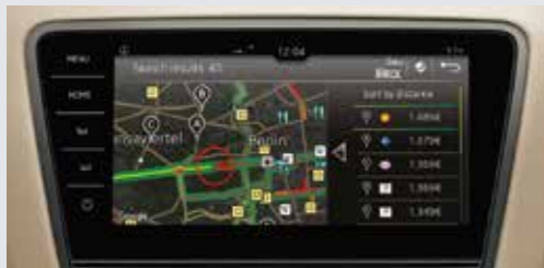
ŠKODA CONNECT - GOOGLE MAPS