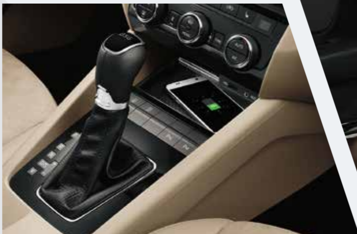
WIRELESS PHONE CHARGING