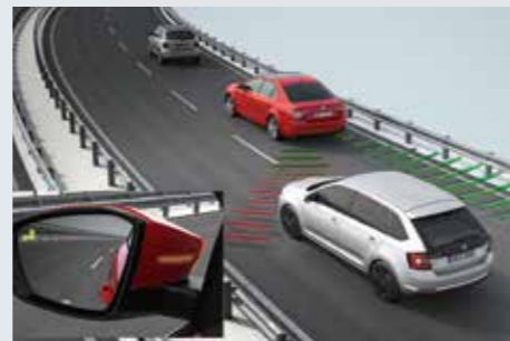
BLIND SPOT DETECTION + REAR TRAFFIC ALERT