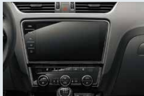
NEW GENERATION INFOTAINMENT (8"–9.2" WITH NEW, ALL-GLASS DESIGN)

The new Octavia demonstrates where ŠKODA stands today, and points to its future – with a variety of new technology features and Simply Clever solutions.