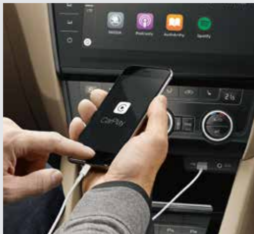
SMARTLINK+ WITH APPLE CARPLAY AND ANDROID AUTO

Being connected online means not only having access to entertainment and information, but to information that can assist you on your journey. ŠKODA CONNECT is your gateway to a world of unlimited possibilities.