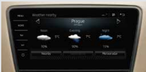
ŠKODA CONNECT - WEATHER