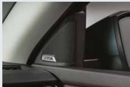
CANTON SOUND SYSTEM