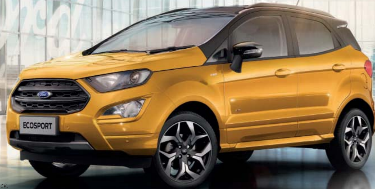
EcoSport ST-Line with contrasting roof in Shadow Black, Luxe Yellow exclusive body colour (available from 2019MY in Sept 2018) and 18" Shadow Black machined alloy wheels (options at extra cost)