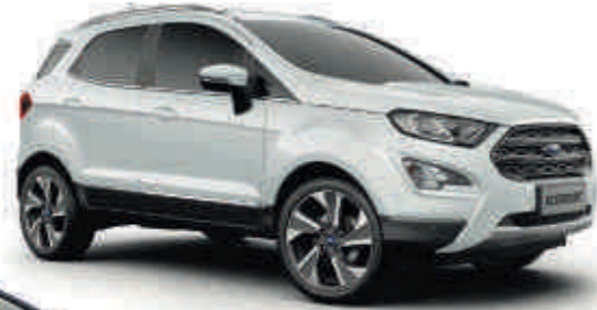
Frozen White Premium body colour*