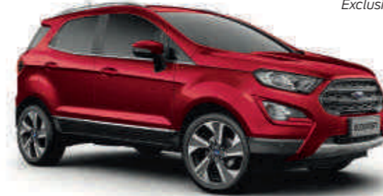
Ruby Red Exclusive body colour*