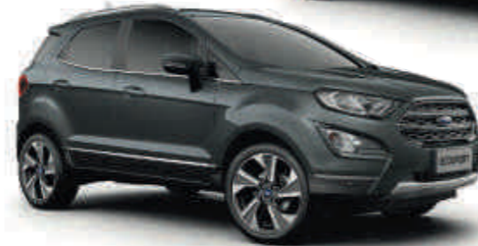
Magnetic Premium body colour*