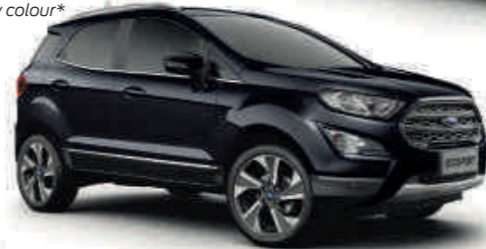
Shadow Black Premium body colour*