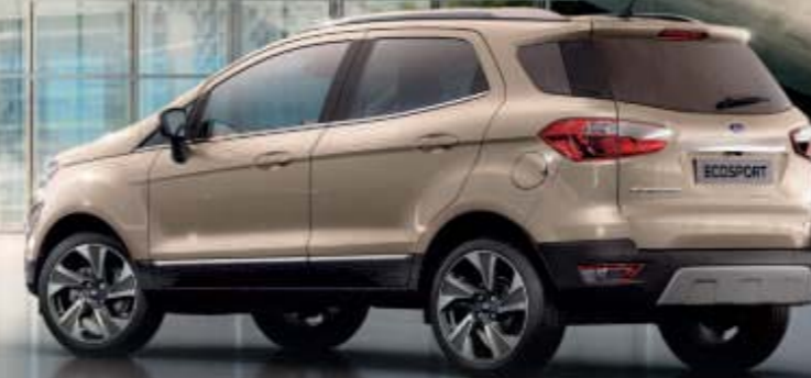
EcoSport Titanium with Silk exclusive body colour and 18" Flash Grey machined alloy wheels (options at extra cost)