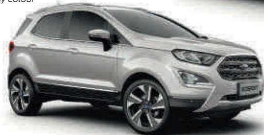
Moondust Silver Premium body colour*