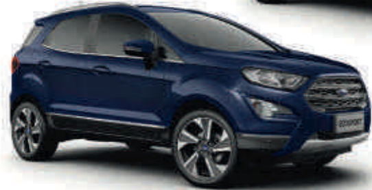
Blazer Blue Standard body colour