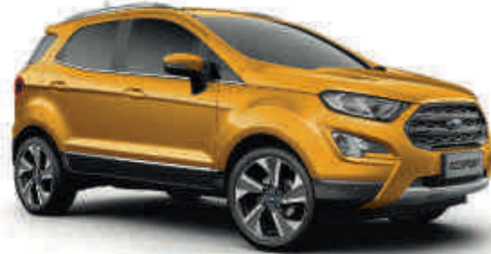
Luxe Yellow † Exclusive body colour*