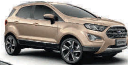
Silk Exclusive body colour*