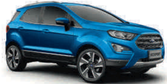
Blue Lightning Premium body colour*