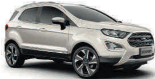
White Platinum Exclusive body colour*