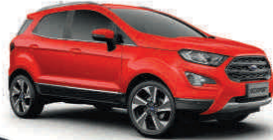
Race Red Standard body colour