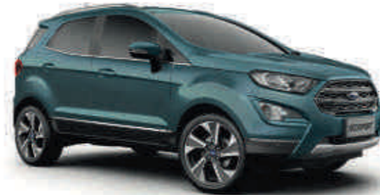
Urban Teal † Exclusive body colour*