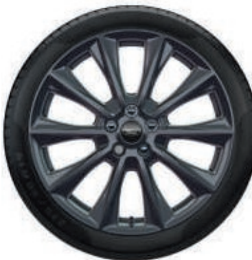
19" 10-spoke Dark Tarnish alloy wheels (Standard on Vignale and Vignale HEV)

Note: Wheels and colours reproduced within this brochure may vary from the actual colours, due to the imitations of the printing process used.