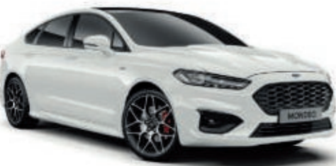
Frozen White Premium body colour*