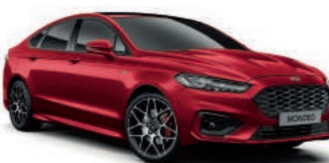
Ruby Red Exclusive body colour*