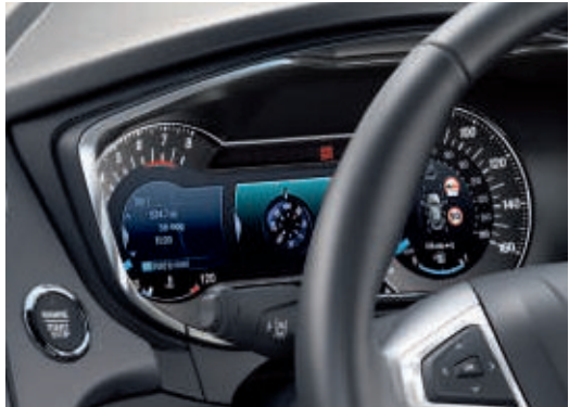
10" Colour TFT cluster display