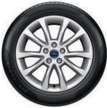
Optional 17" lower CO 2 alloy wheel available for Titanium Edition Hybrid