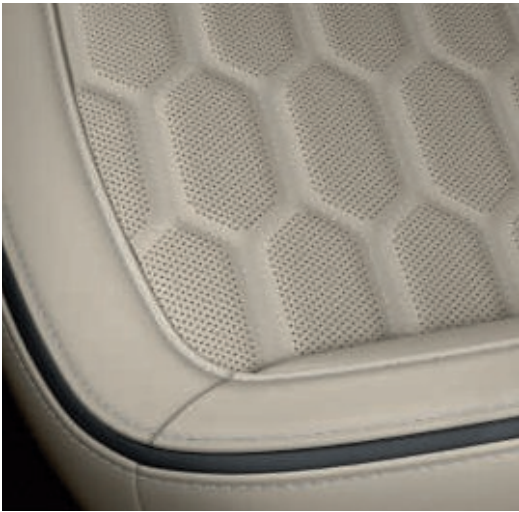
Premium Leather in Cashmere (Standard option on Vignale and Vignale HEV)