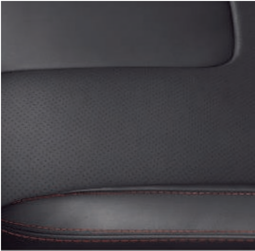
Salerno Leather in Charcoal Black with red stitching (Option as part of the ST-Line Edition Lux Pack at additional cost)