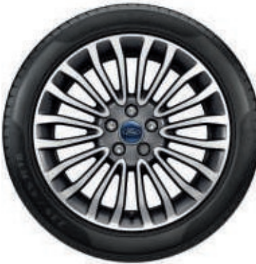
18" 10x2-spoke alloy wheels (Standard on Titanium Edition and Titanium Edition HEV)