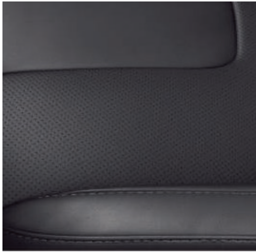
Salerno Leather in Charcoal Black (Standard on Titanium Edition and Titanium Edition HEV)