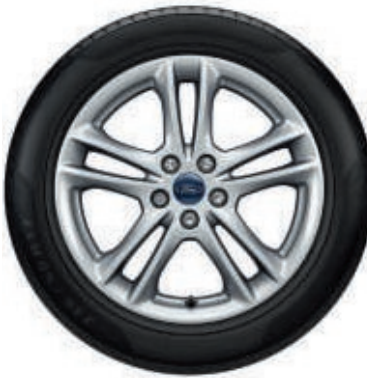
17" 5x2-spoke alloy wheels (Standard on Zetec Edition)