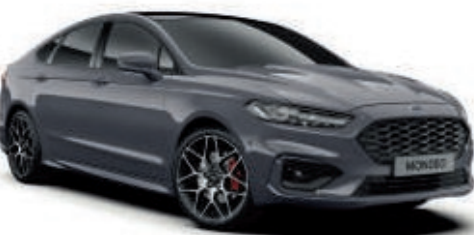
Stealth‡ ST-Line Edition Premium body colour*