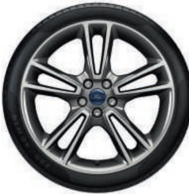
19" 5x2-spoke alloy wheels (Option on Titanium Edition)