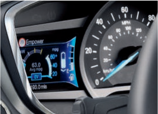
Vignale 4.2" TFT colour cluster display