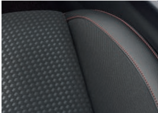
Sports style front seats with partial leather trim with red stitching (standard on ST-Line Edition)