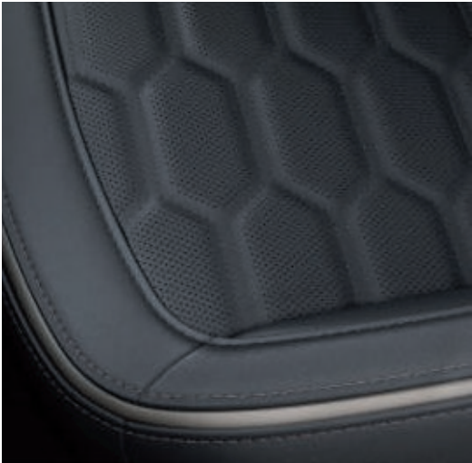
Premium Leather in Charcoal Black (Standard option on Vignale and Vignale HEV)