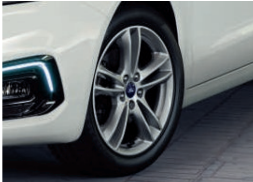
17" 5x2-spoke alloy wheels