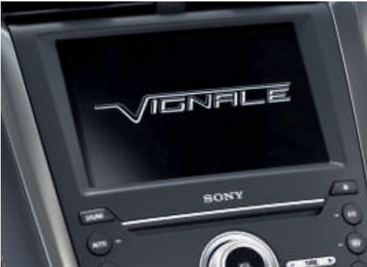
Sony DAB audio system with CD player, Sync 3 and 8" touchscreen