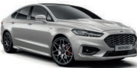
Moondust Silver Premium body colour*