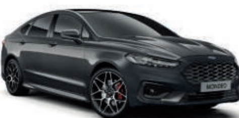
Magnetic Exclusive body colour*