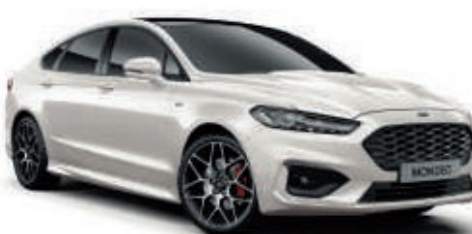
White Platinum Exclusive body colour*