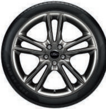
19" 5x2-spoke Rock Metallic alloy wheels (Standard on ST-Line Edition)