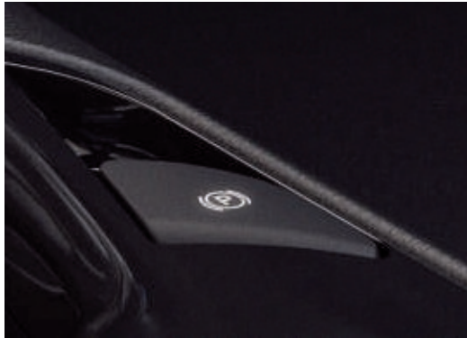
Electric Parking Brake