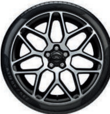
19" Y-spoke alloy wheels (Option on ST-Line Edition)