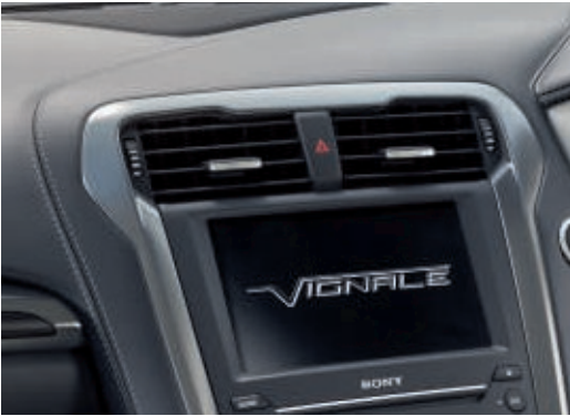
Unique Vignale welcome screen with leather-wrapped instrument panel