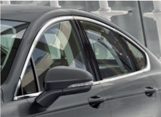
Chrome-finish on side window surrounds