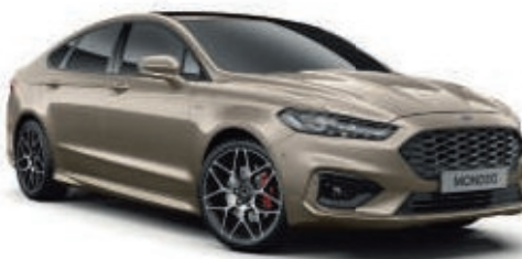
Diffused Silver Premium body colour*