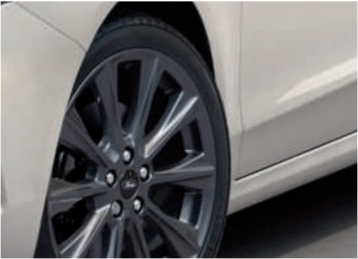
Exclusive 19" 10-spoke Dark Tarnish alloy wheels