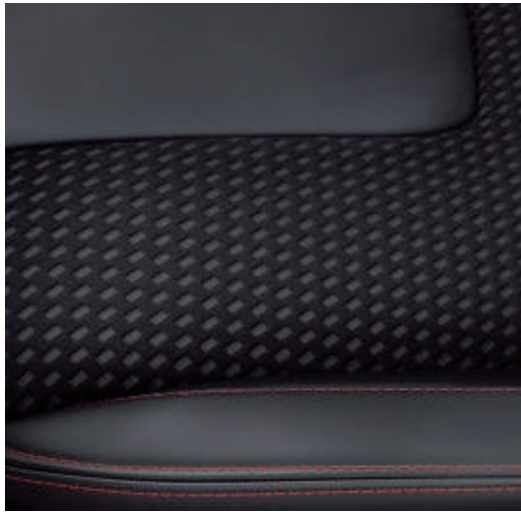
Salerno partial Leather in Charcoal Black (Standard on ST-Line Edition)