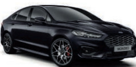
Shadow Black Premium body colour* (Standard on Vignale)