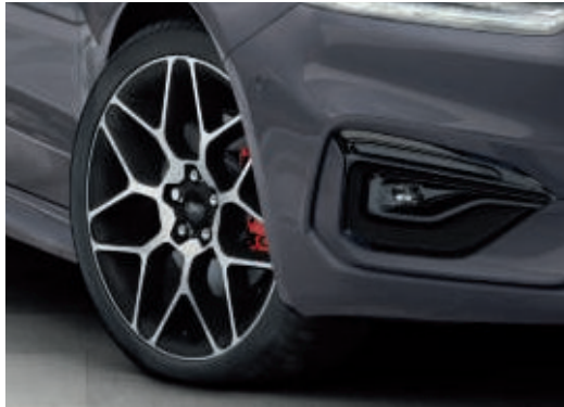
Optional 19" Y-spoke alloy wheels and red brake calipers available for ST-line Edition