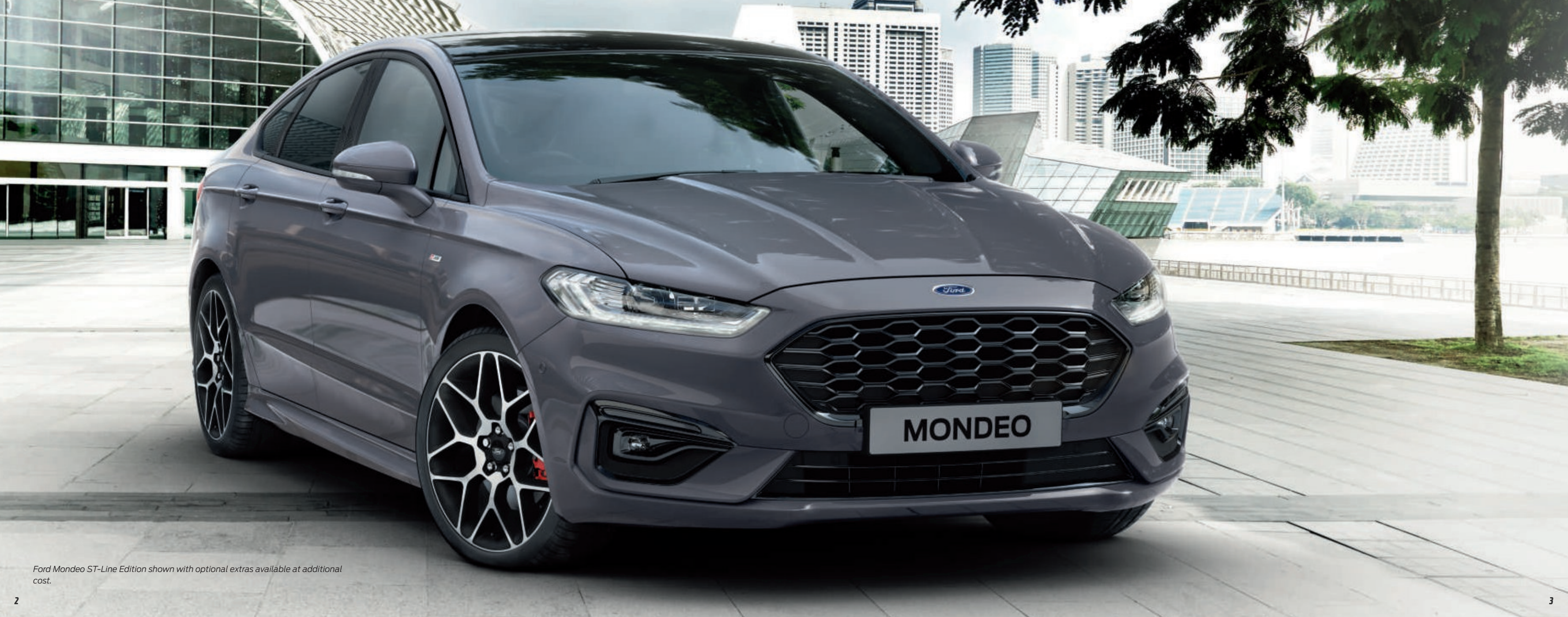
Ford Mondeo ST-Line Edition shown with optional extras available at additional cost.