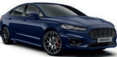
Blazer Blue Standard body colour (excluding Vignale)