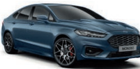
Chrome Blue Premium body colour* (Standard on Vignale)

Mondeo owes its beautiful and durable exterior to a special multi-stage painting process. From the wax-injected steel body sections to the protective top coat, new materials and application processes ensure your Mondeo will retain its good looks for many years to come.