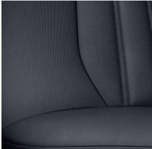
Cypress in Ebony with white dots (Standard on Zetec Edition)