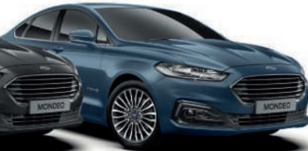
Titanium Edition HEV