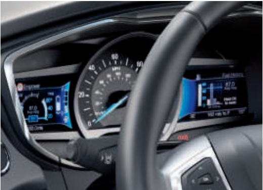
Twin 4.2" colour TFT cluster display with HEV SmartGauge®