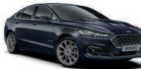
Blue Panther† Vignale exclusive body colour*