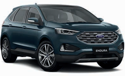
Baltic Sea Green**