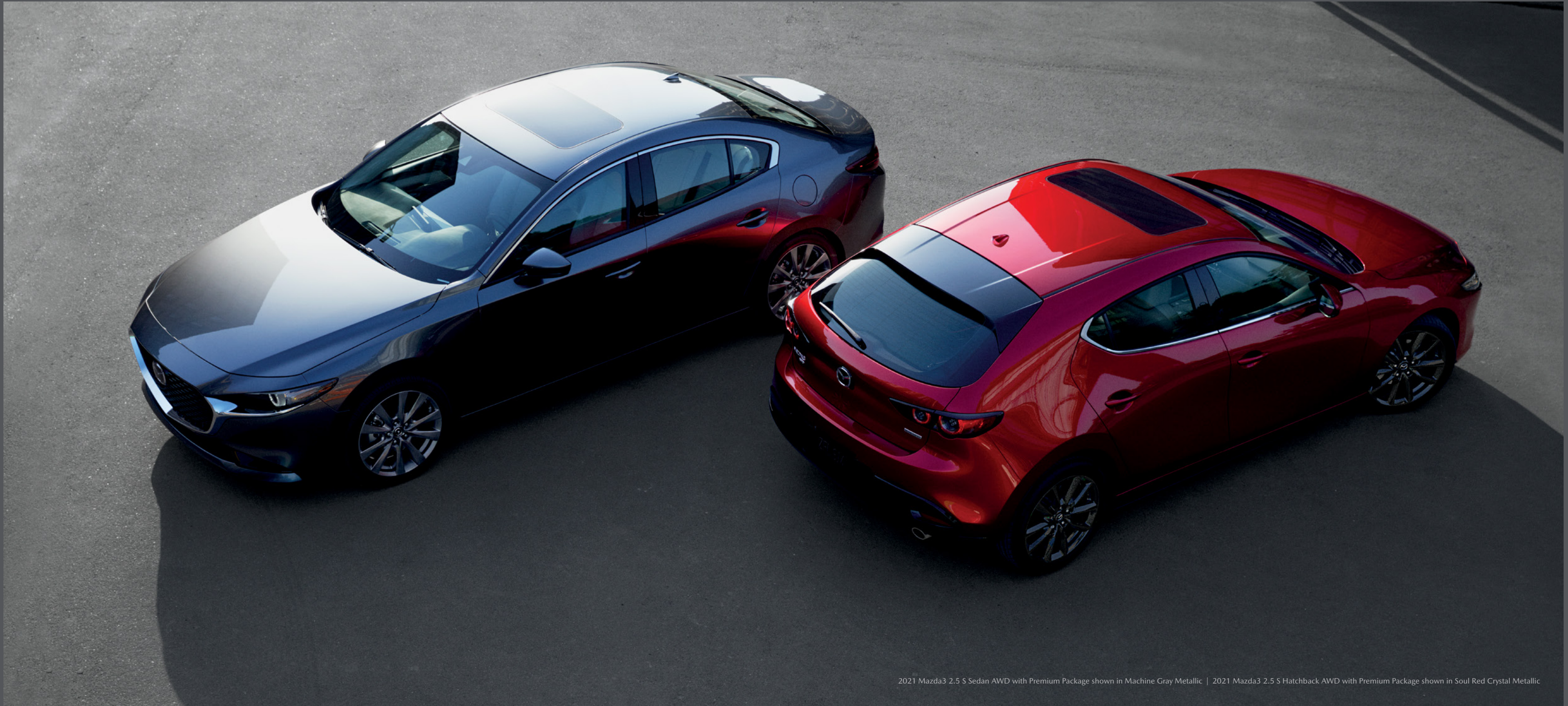
2021 Mazda3 2.5 S Sedan AWD with Premium Package shown in Machine Gray Metallic | 2021 Mazda3 2.5 S Hatchback AWD with Premium Package shown in Soul Red Crystal Metallic