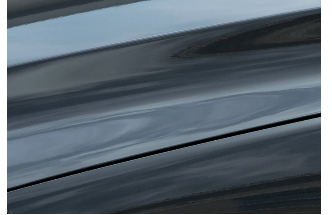
From left to right: Machine Gray Metallic, Soul Red Crystal Metallic, Polymetal Gray Metallic