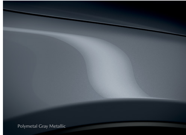
Polymetal Gray Metallic