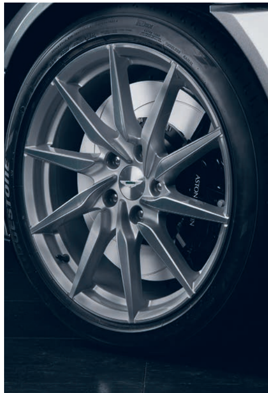
Winter Wheel and Tyre Kit