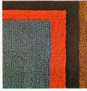
DELUXE CARPETING , wall to wall, makes stepping into the Skylark convertible a pleasure. Choice of many beautiful decorator colors.