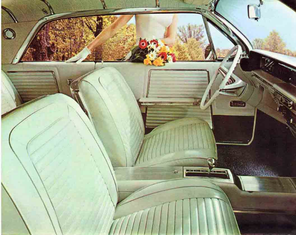
THE LUXURY OF A BUICK with the zest and flair of a sports car. That's the interior of the brilliant new Buick Wildcat. THIS SKYLARK CONVERTIBLE INTERIOR captures the playful spirit of Buick's trim-size luxury car. Bucket seats are standard.