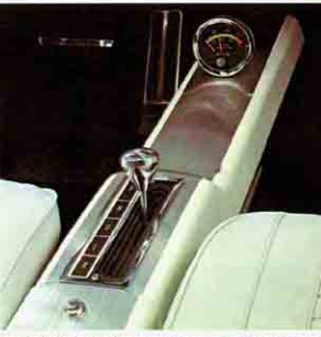
BRIGHT METAL CONSOLE between front seats contains Turbine Drive control and indicator as well as tachometer. Standard equipment.