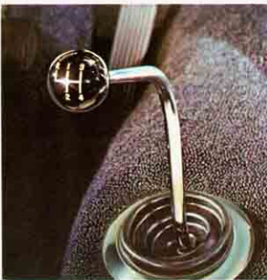
OPTIONAL 4-SPEED TRANSMISSION is a natural for the high-performance, stick-shift fans. All forward gears fully synchronized.