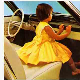
PADDED INSTRUMENT PANEL is standard equipment in the Buick Skylark convertible. Added protection for you and your family.