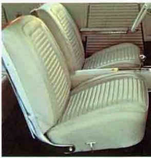
RICHLY-STYLED BUCKET SEATS in a smart selection of leather-grained vinyls set a sporty tone for the Buick Wildcat interior.