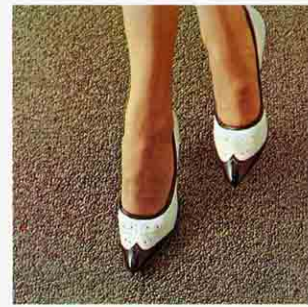
DEEP CARPETING , color-keyed to Wildcat interior decor, puts extra luxury underfoot. Thick, durable weave means long life and good looks.