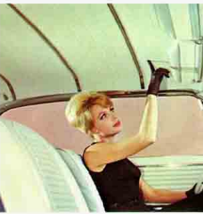
FOAM RUBBER HEAD LINING is a pleasure to look at, a pleasure to touch. Makes a big contribution, too, to Wildcat quietness.