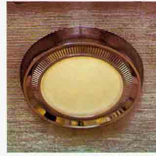
REAR SEAT COURTESY LIGHT is mounted on the back of the console for extra safety and convenience. Lights when door is opened.