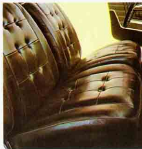
SMART BUCKET SEATS tailored in your choice of rich, leather-grained vinyls. Interiors are color-keyed to exterior color. Five colors to choose from.