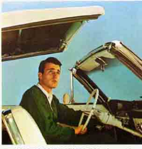
AUTOMATIC CONVERTIBLE TOP raises and lowers at the touch of a button. Nests down under smooth-fitting top boot to make an unbroken deckline.