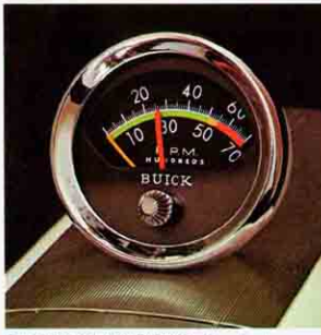
RALLYIST'S TACHOMETER set in a handsome console between the seats is a never-ending delight for performance lovers. Standard equipment.