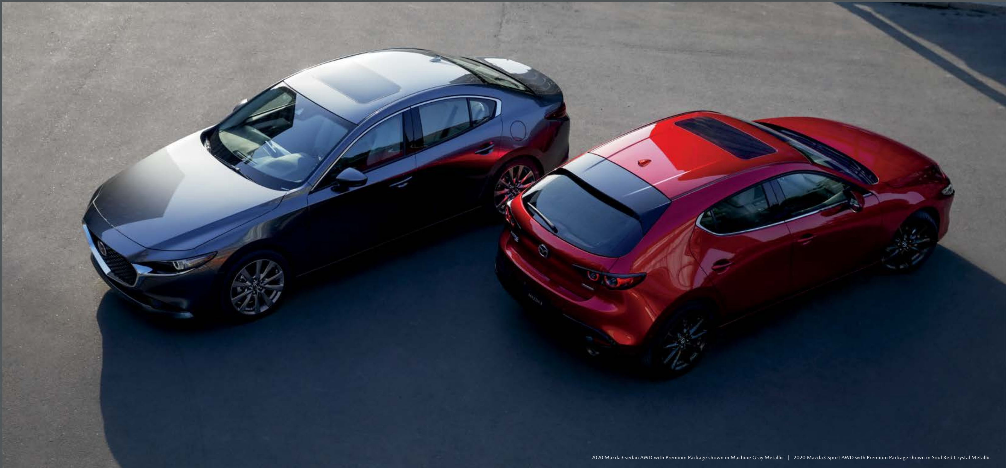
2020 Mazda3 sedan AWD with Premium Package shown in Machine Gray Metallic | 2020 Mazda3 Sport AWD with Premium Package shown in Soul Red Crystal Metallic