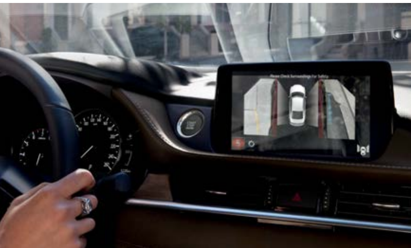
360° View Monitor shown. Now standard on GT models.

To heighten your senses, we created a few of our own. Sophisticated safety innovations that alert you to hazards and help you avoid collisions – or lessen their impact. That’s the thinking behind i-Activsense. This suite of i-Activsense safety features,* such as available Lane-keep Assist† system and Mazda Radar Cruise Control‡ and the standard Advanced Blind Spot Monitoring† and Rear Cross Traffic Alert,† helps improve your visibility and awareness of the road.