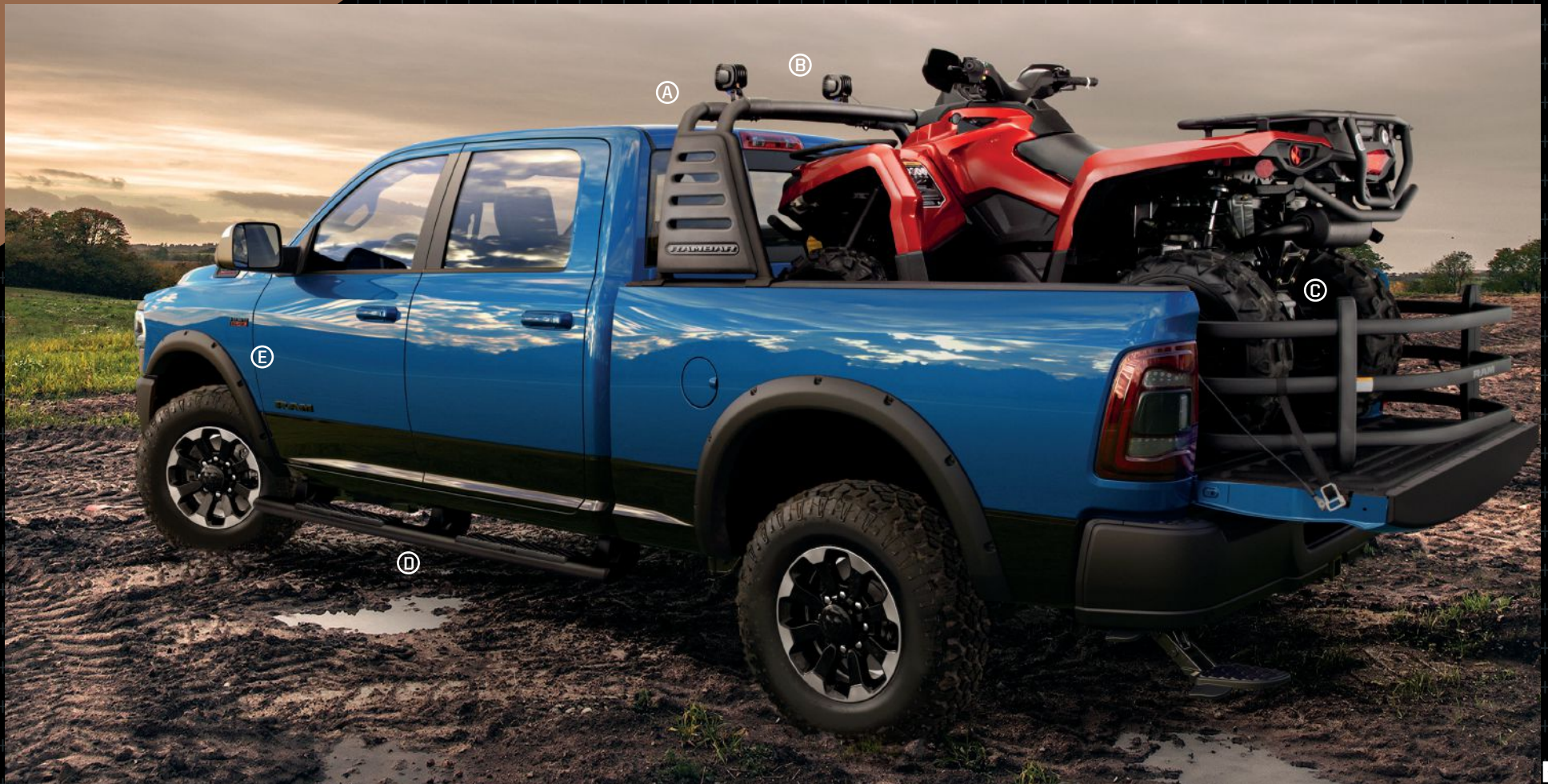
RAM HEAVY DUTY POWER WAGON ® IN HYDRO BLUE AND DIAMOND BLACK FEATURES RAMBAR, OFF-ROAD 5-INCH LED LIGHT KIT, LIGHT MOUNTING BRACKETS, BED EXTENDER, BLACK TUBULAR SIDE STEPS AND MOPAR ® UNIQUE WHEEL FLARES

(1) Off-Road Lights are aftermarket only, may not be installed by a Chrysler, Dodge, Jeep ® , or Ram dealer on any vehicle prior to its first retail sale, and may not be sold or financed in conjunction with the sale of a new vehicle. FCA US LLC does not authorize the installation of these parts on any vehicle prior to its first retail sale. (2) Properly secure all cargo.