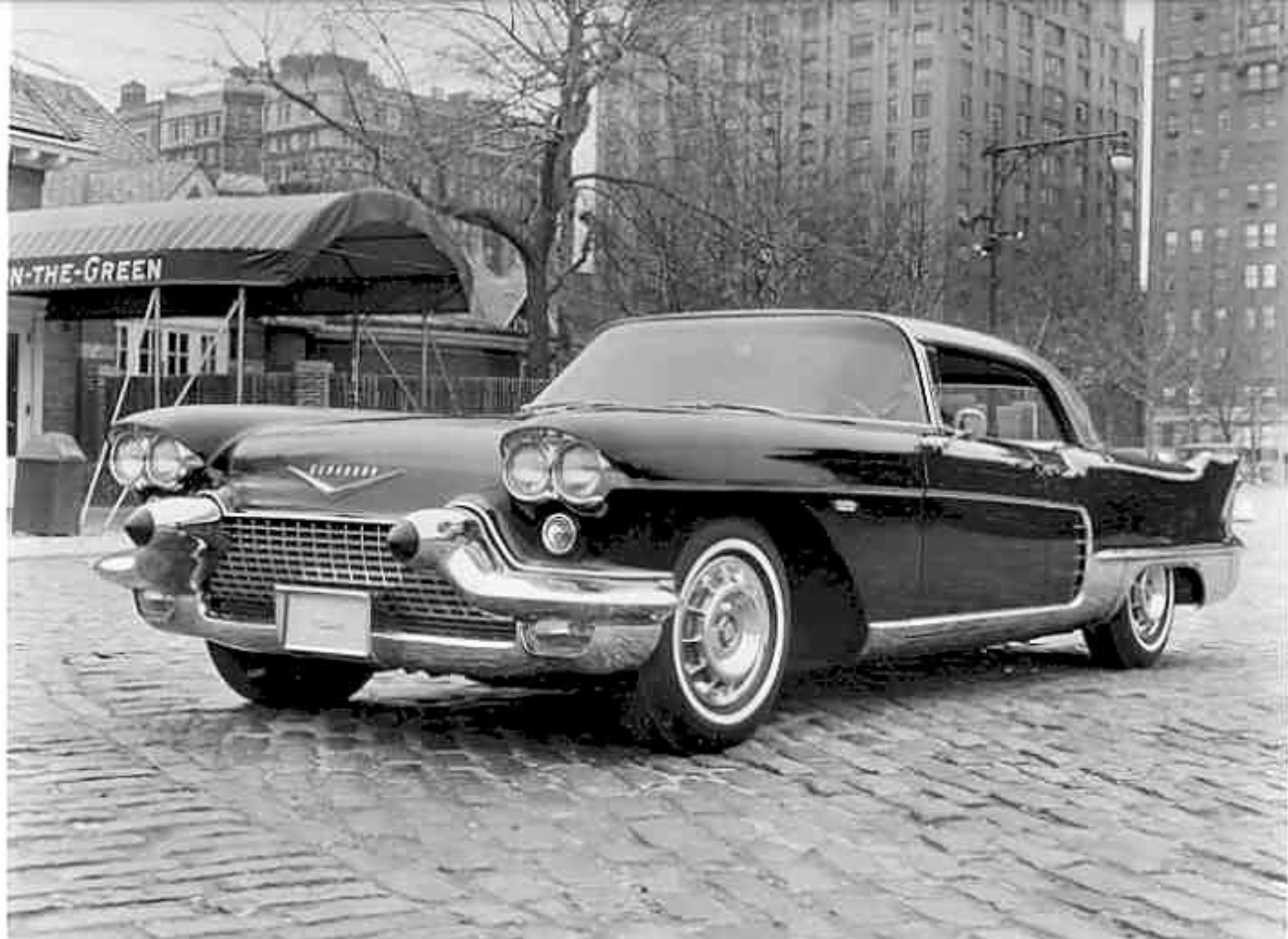
THE CADILLAC ELDORADO BROUGHAM -- This ultra luxury automobile features a true four headlamp system, which was pioneered by Cadillac. The Brougham is 55 1/2 inches high and has a length of 216 inches.