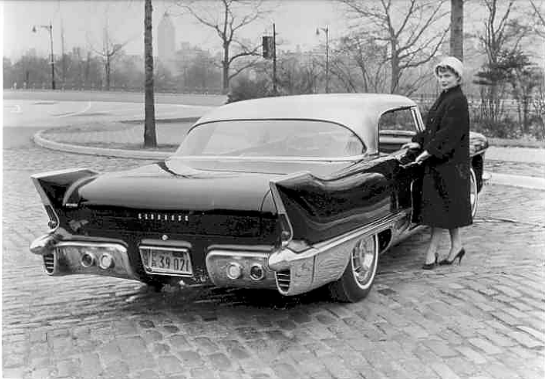
THE CADILLAC ELDORADO BROUGHAM -- This super luxury sedan features dramatically styled rear quarter panels and swept back tail fin styling with delicately formed stainless steel fender skirts extending from the vertical molding to the rear bumper section. Protective chrome rear bumper pieces in three sections are mounted flush with the body.