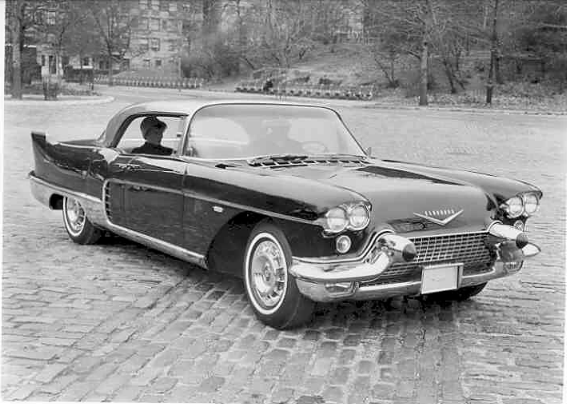
THE CADILLAC ELDORADO BROUGHAM -- This is the exclusive Cadillac Eldorado Brougham. An ultra-luxury four-door model, the Brougham features such outstanding engineering advances as the four headlamp system, air suspension and tubular center X-frame. The Brougham stands 55-1/2 inches high and is 216.3 inches long.