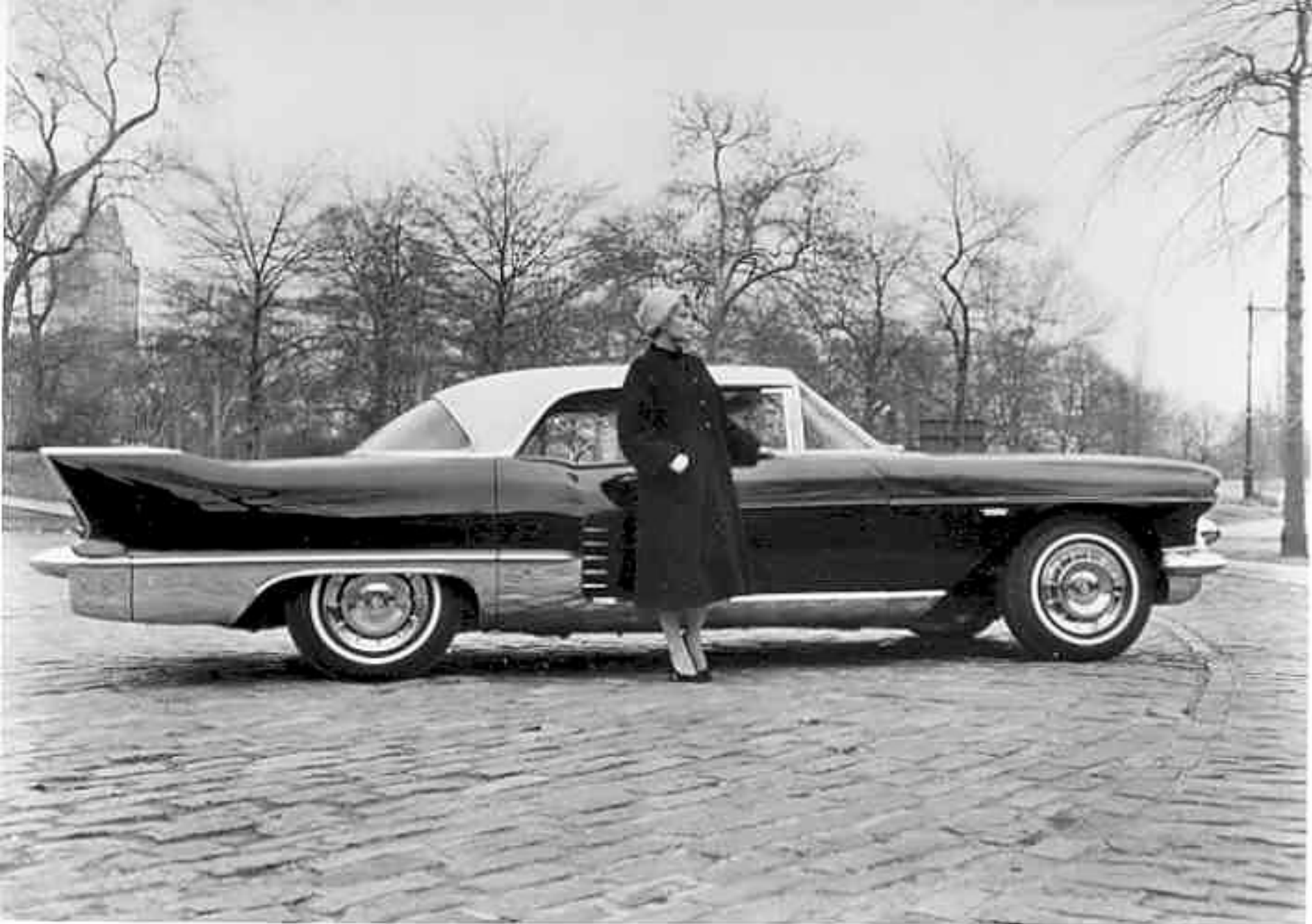
THE CADILLAC ELDORADO BROUGHAM -- The stainless steel roof and stainless steel moldings in contrast with the dark exterior of Cadillac's Eldorado Brougham present a new appearance in sculptured metal. The doors on the Brougham open outward from a center locking plate. The rear doors are secured to this plate when the car is in any drive gear.