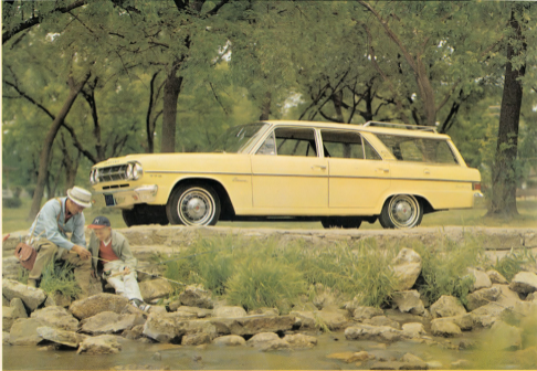
Classic 770 Station Wagon