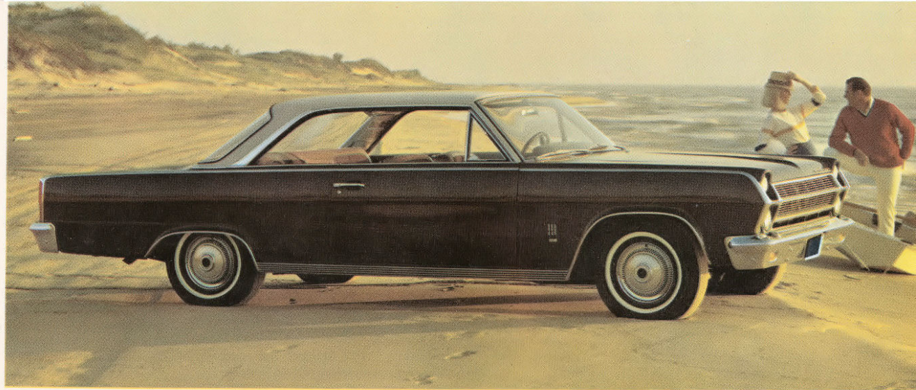
Ambassador 990 2-Door Hardtop