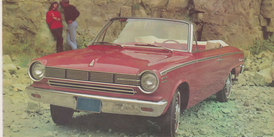
Rambler American 440 Convertible

Rambler American 440 Convertible: Take a sunny day, a pretty girl, a carefree heart, the 440 Convertible, and you're on your way to happy times. Press a button. Zip! goes the Power Top. And with all its happy-go-lively ways, the 440 is still the lowest-priced Canadian-built convertible you can buy.