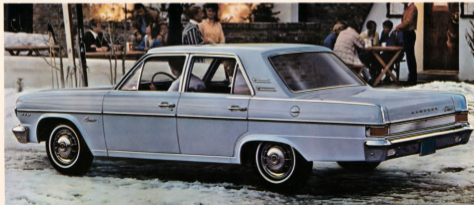
Classic 770 4-Door Sedan

Get behind the wheel of the fast new Rambler Classic. Touch the accelerator. You'll have proof positive that a family-minded car can be an exciting highway performer, too. What's the secret? The new Torque Command 7-Main Bearing engine, the bold new six that performs like an eight for quick, responsive, right-now performance. In the '65 Classic, Torque Command delivers superior street and highway performance. A ten minute test drive will prove it! The new 7-Main Bearing crankshaft with eight counterweights gives an amazingly smooth, vibrationless quiet ride. You have your choice of 128, 145, or 155 h.p. If you're a dyed-in-the-wool V8 man, move to the Classic 198 h.p. V8 for quick-going, sure-going travel. No other comparable V8 matches the exhilarating action of this Classic engine. Look inside the new Classic. You'll find more people space—more foot-room, leg-room, elbow-room. You'll find more luggage space, too. The completely re-styled Classic offers you a full range of eight models in three series—550, 660, 770. There are excitingly-styled 2 and 4 door sedans, wagons, hardtops. And there's a wide new choice of power options and features. With completely new styling, with more people space and more luggage space, with authoritative new 6 and V8 performance, it's no wonder the '65 Rambler Classic is Canada's best car value!