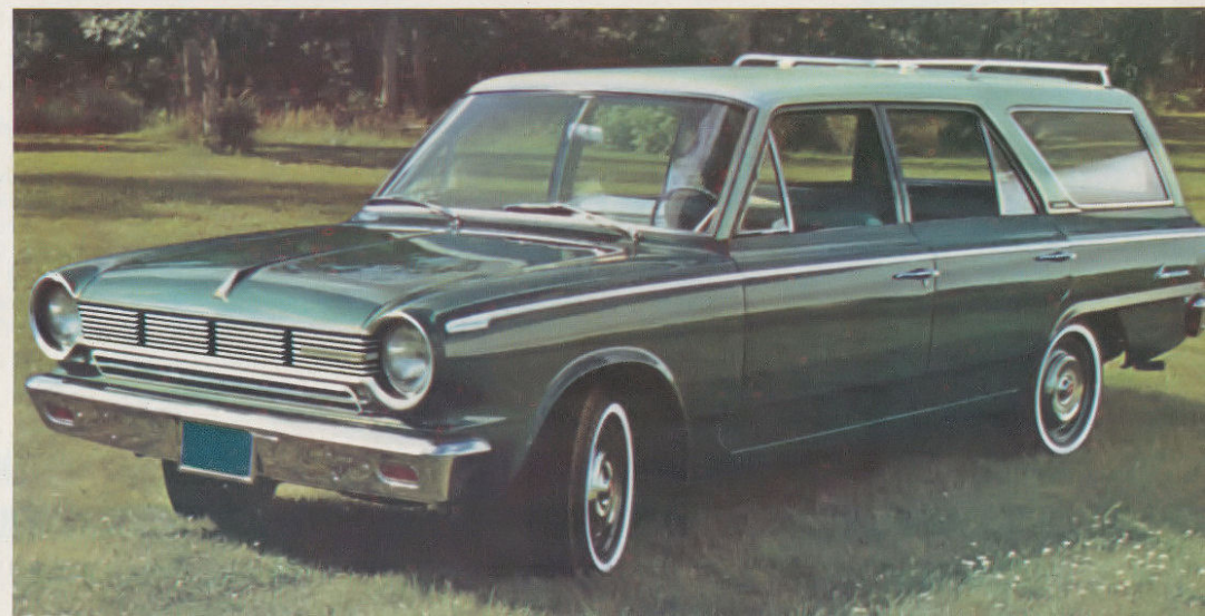
Rambler American 330 Station Wagon

Rambler American 330 Station Wagon: Whatever you carry—kids, pets, camping gear, building supplies, groceries—there's plenty of good useable space. Special wagon options include Power-Lift tailgate window. Sensibly-sized, easy-handling, a pleasure to drive—a remarkable wagon, especially when you consider its low price!