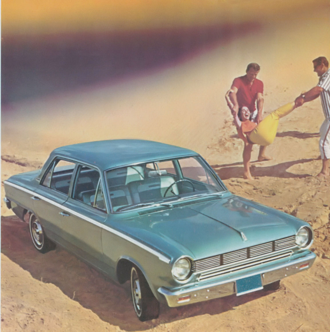
Rambler American 330 4-Door Sedan

Rambler American 440 2-Door Hardtop (on previous page): Brand-new and beautiful for '65—the latest addition to the Rambler American line! Delightful young-at-heart style and spirit, smooth open-road performance. Dressy glamour options. Roomy, handsome interiors. Optional reclining seats and new improved adjustable headrests. You can't beat the 440 Hardtop for value, style and performance!