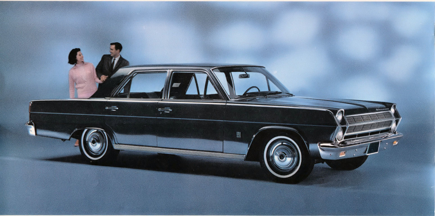
Ambassador 990 4-Door Sedan

Ambassador 990 Cross Country Station Wagon (bottom right): New elegant thoroughbred. Full power options. Full-size cargo and people space. Luxury and style in the country estate tradition. Extras include chrome Roof Top Travel Rack and hidden compartment for storing valuables (standard equipment). New simulated external woodgrain option.