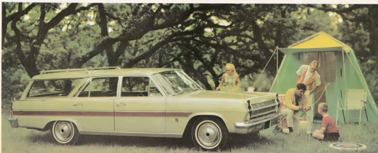
Ambassador 990 Cross Country Station Wagon