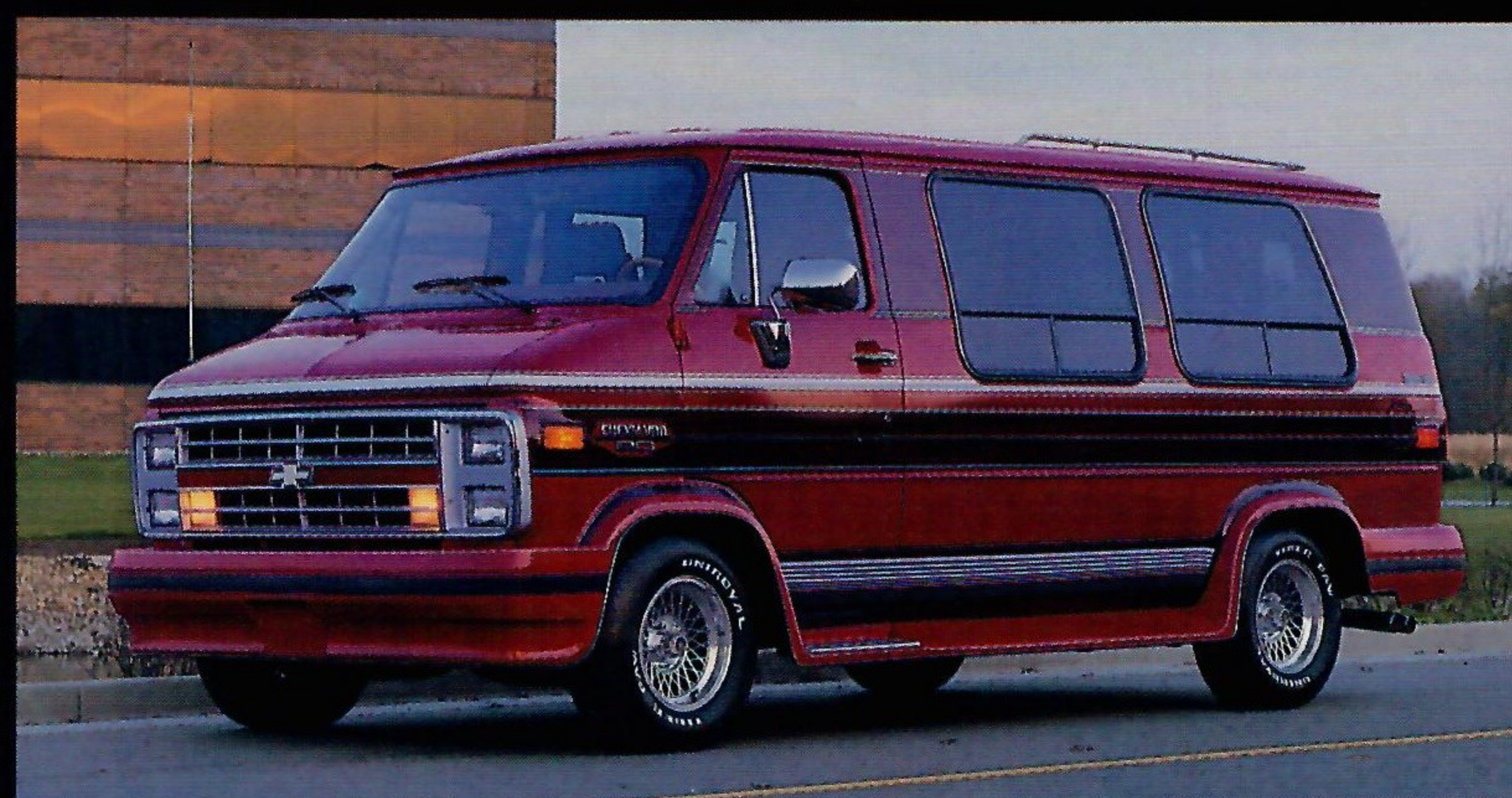
Eagle Seville with optional ground effects sports package.