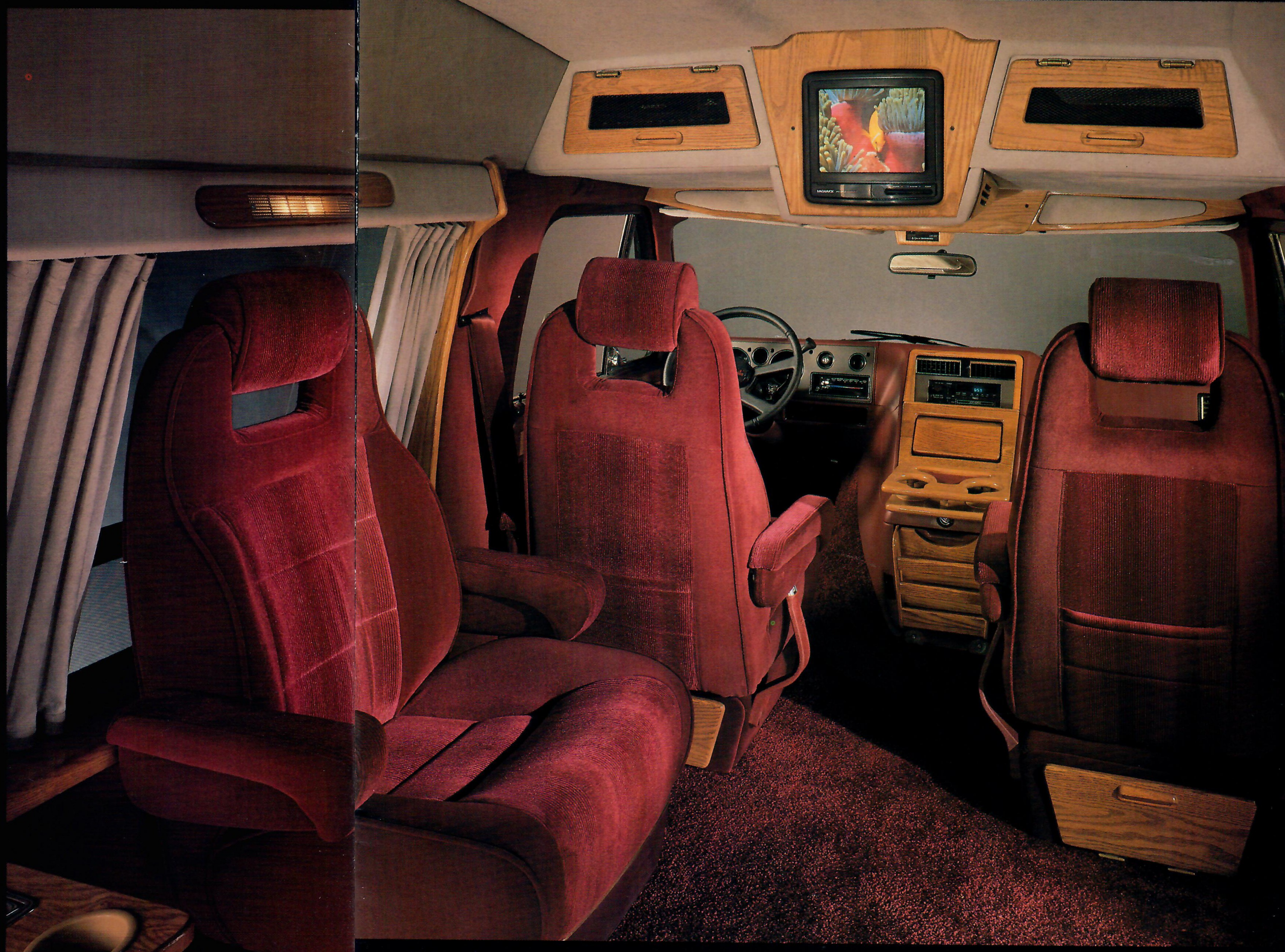
Eagle Seville raised roof interior - all new exciting design.