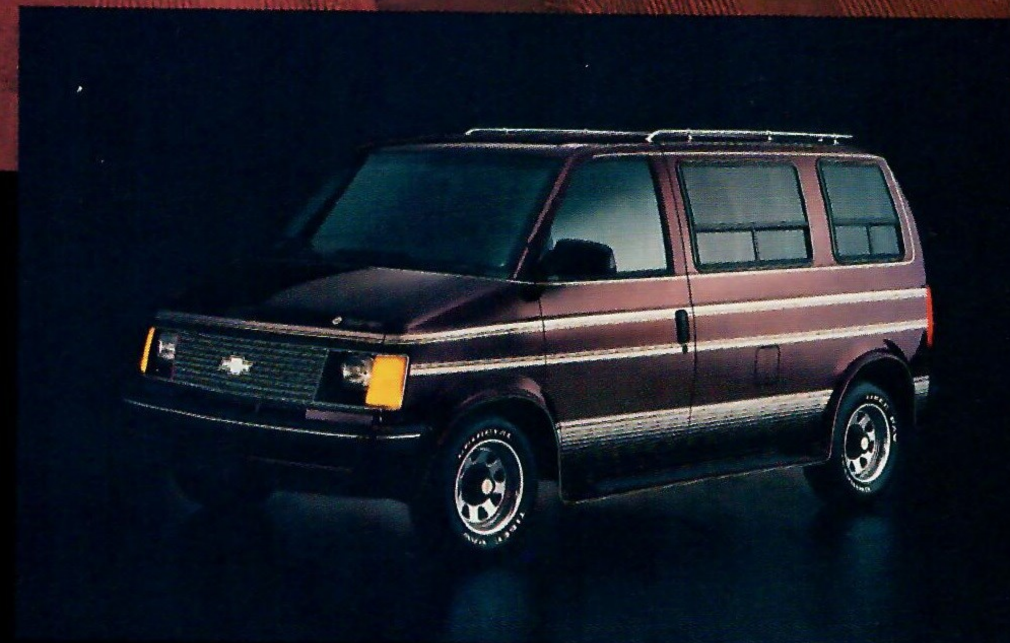
Trans-Aire's decorative exterior tape scheme.

*Available in regular and extended mini vans