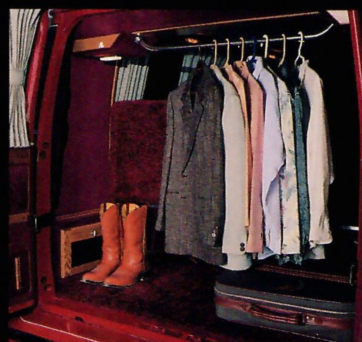
Large storage area in rear. Clothes bar standard.