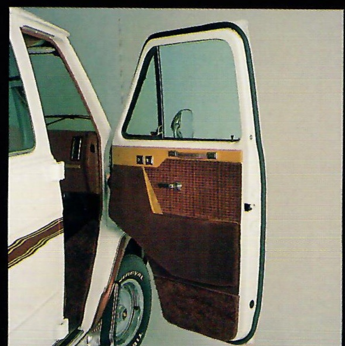
Ranger door panel features oak accents and built-in map pocket.