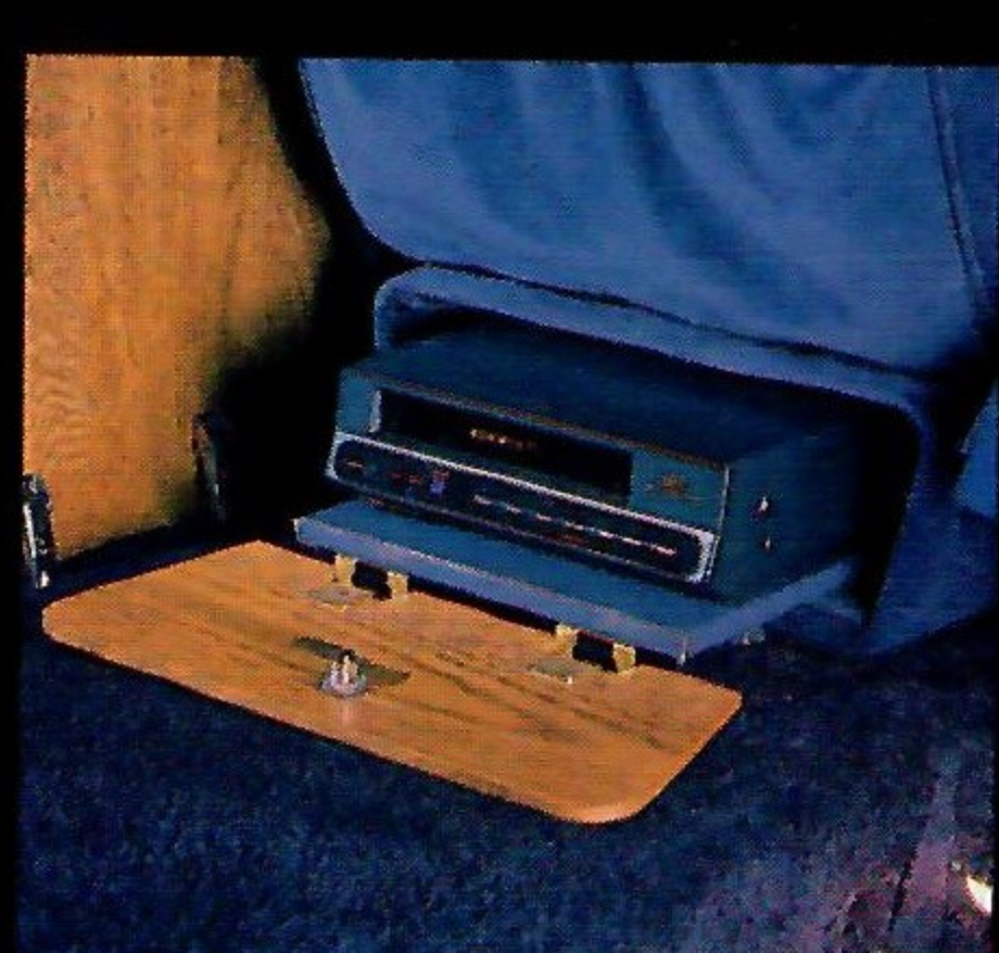
Slide-out VCR compartment

S - Standard O - Optional N/A - Not Available