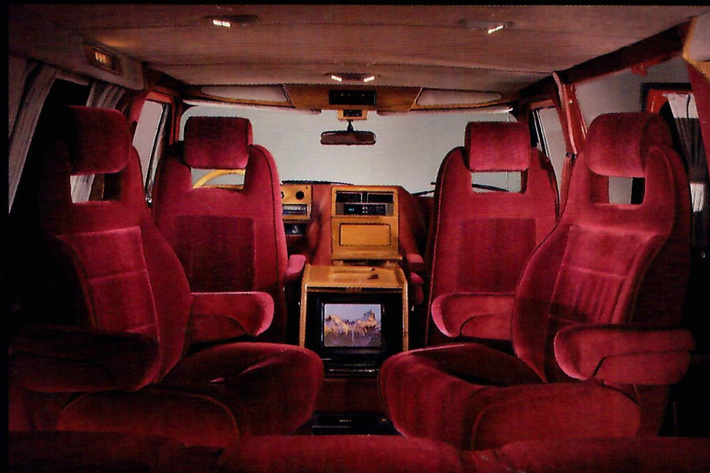
Eagle Seville luxury is everywhere you look.

The all new Eagle Seville constitutes a whole new class of luxury travel. Engineered to be one of the finest driving luxury machines available the Eagle Seville is the clear choice of those who for reasons of profession or prestige, demand the best in product design, durability and distinction. The Eagle Seville has many luxury features as standard including a concealed steel impact bar** welded in both sides and built in 3/4" solid oak side rails** - Eurostyle seats and much more.