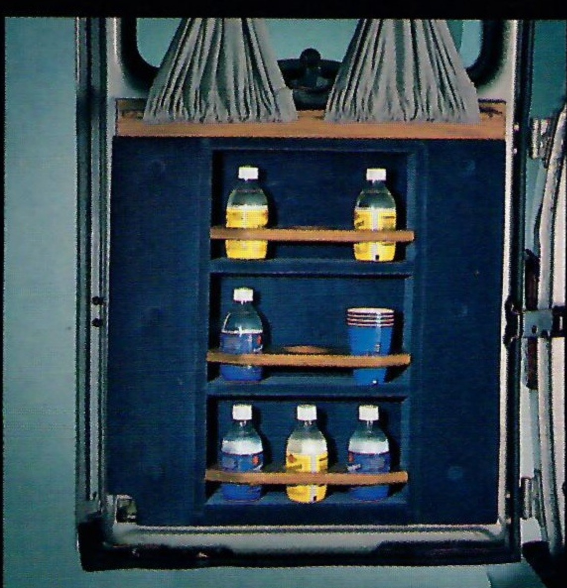
Delta Ranger rear door panel.

Plush style contoured seats, overhead rear heat and air conditioning, indirect lighting, steel impact bar welded in both sides, full width overhead console are just a few of the many standard features.