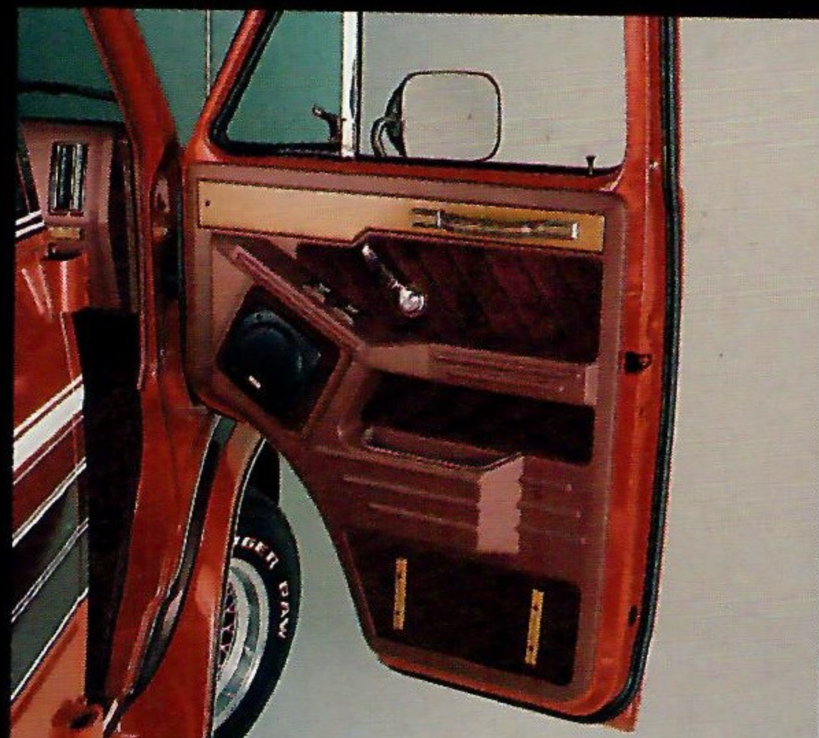
Automotive style molded door panels