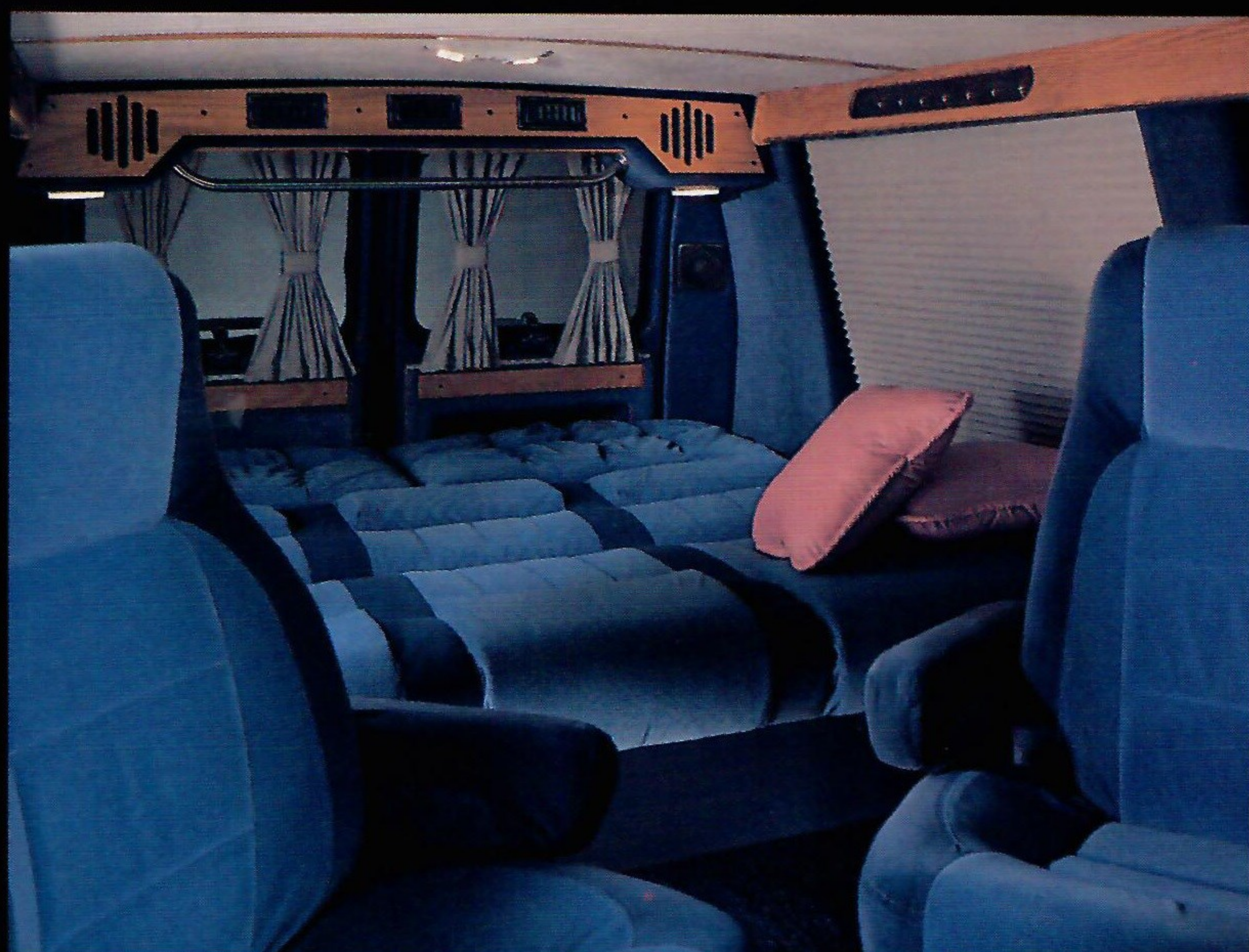
Trans-Aire 3 way bed extender is standard on every model with rear sofa. Makes extra large comfortable bed.