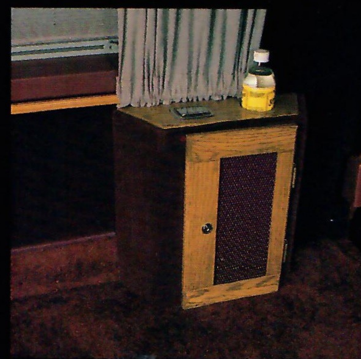
Ranger sidewall cabinet with lockable storage, beverage holder and ash tray.