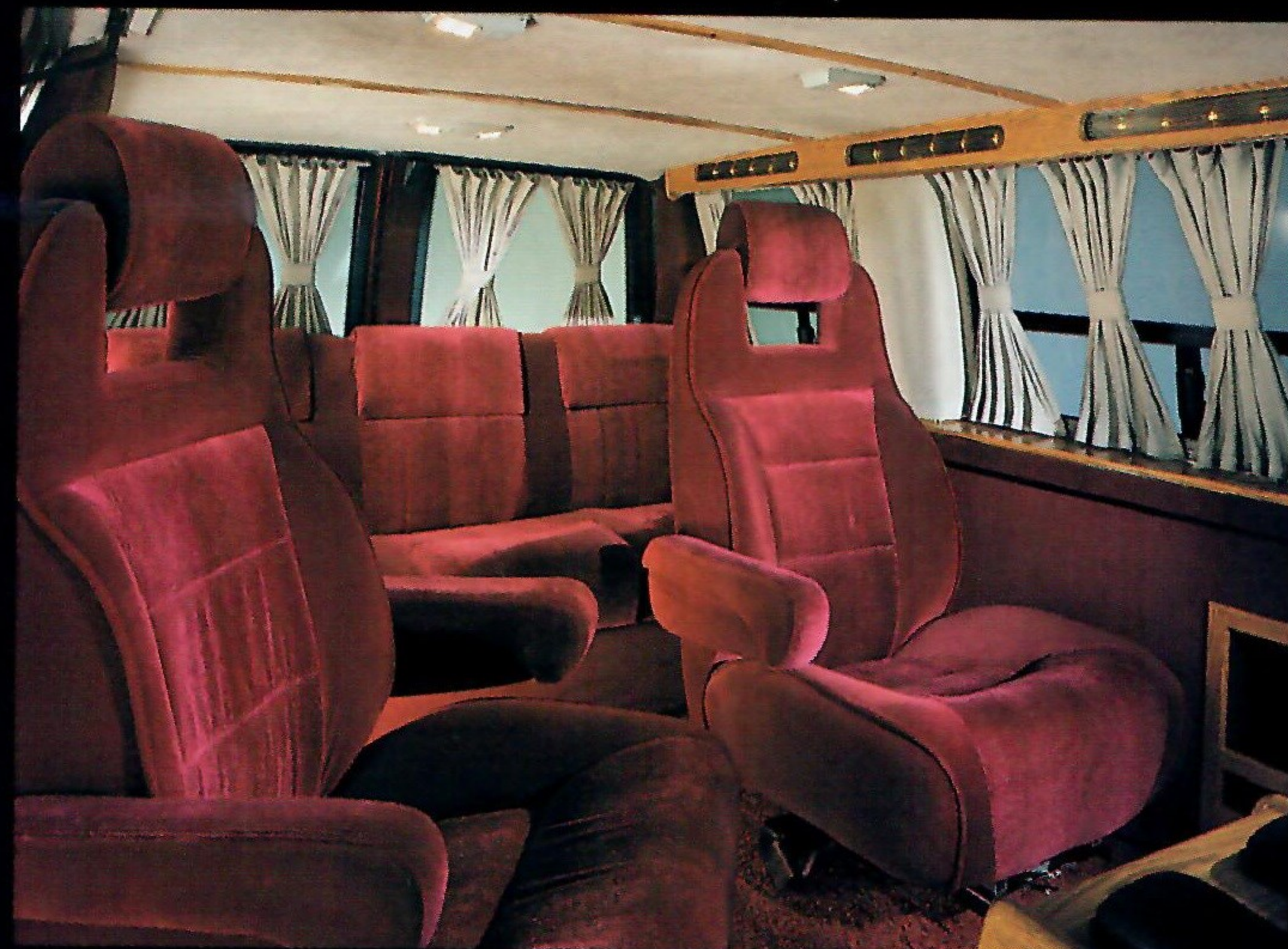
Trans-Aire's exclusive split wall construction with built in solid oak side rails.

*Available in regular and extended mini vans