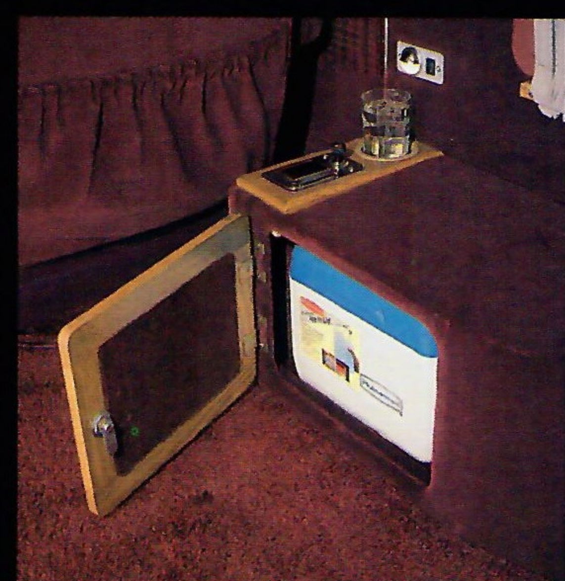
Ranger side cabinets with removable cooler, beverage holder, ash tray and cigarette lighter.