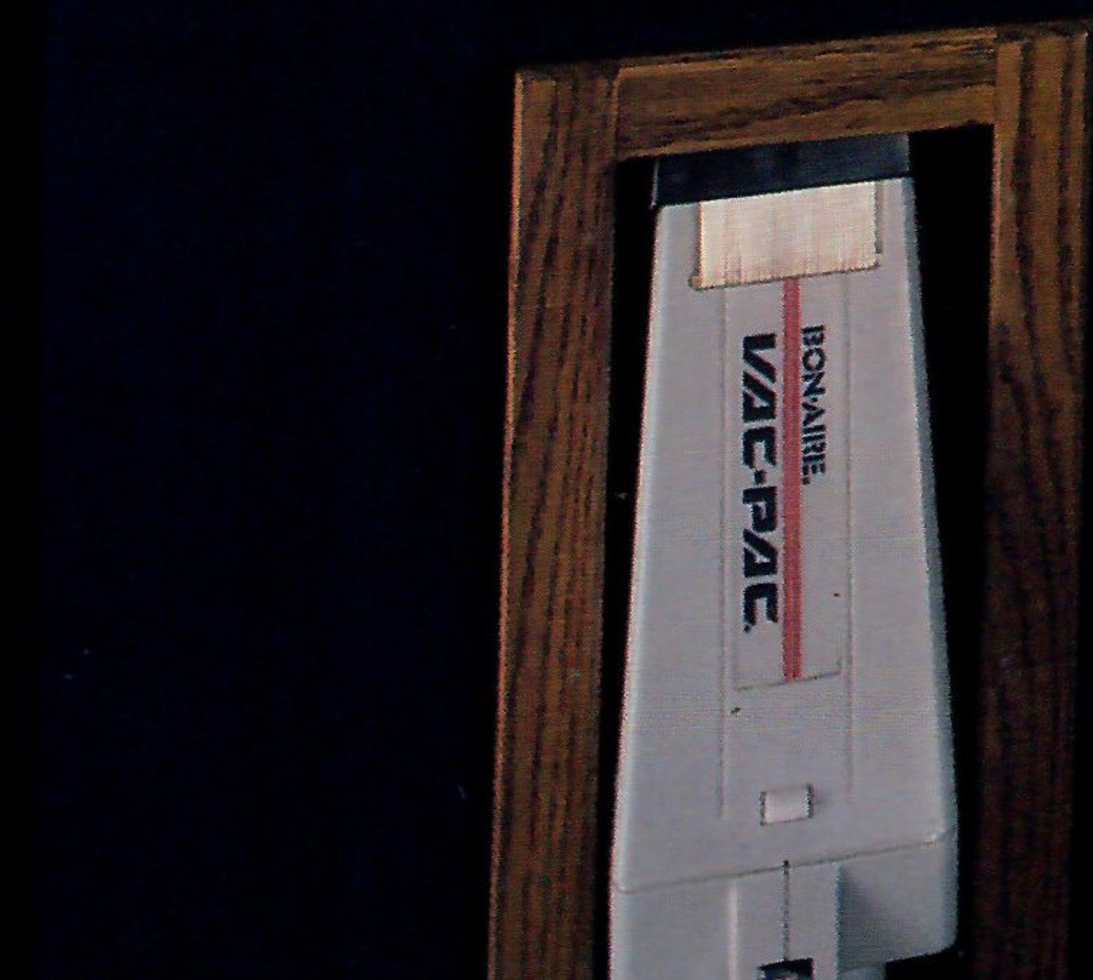
Hand crafted oak end panels, plush wrap around seat cushions and lots more in Trans-Aire's exclusive wrap-around lounge.