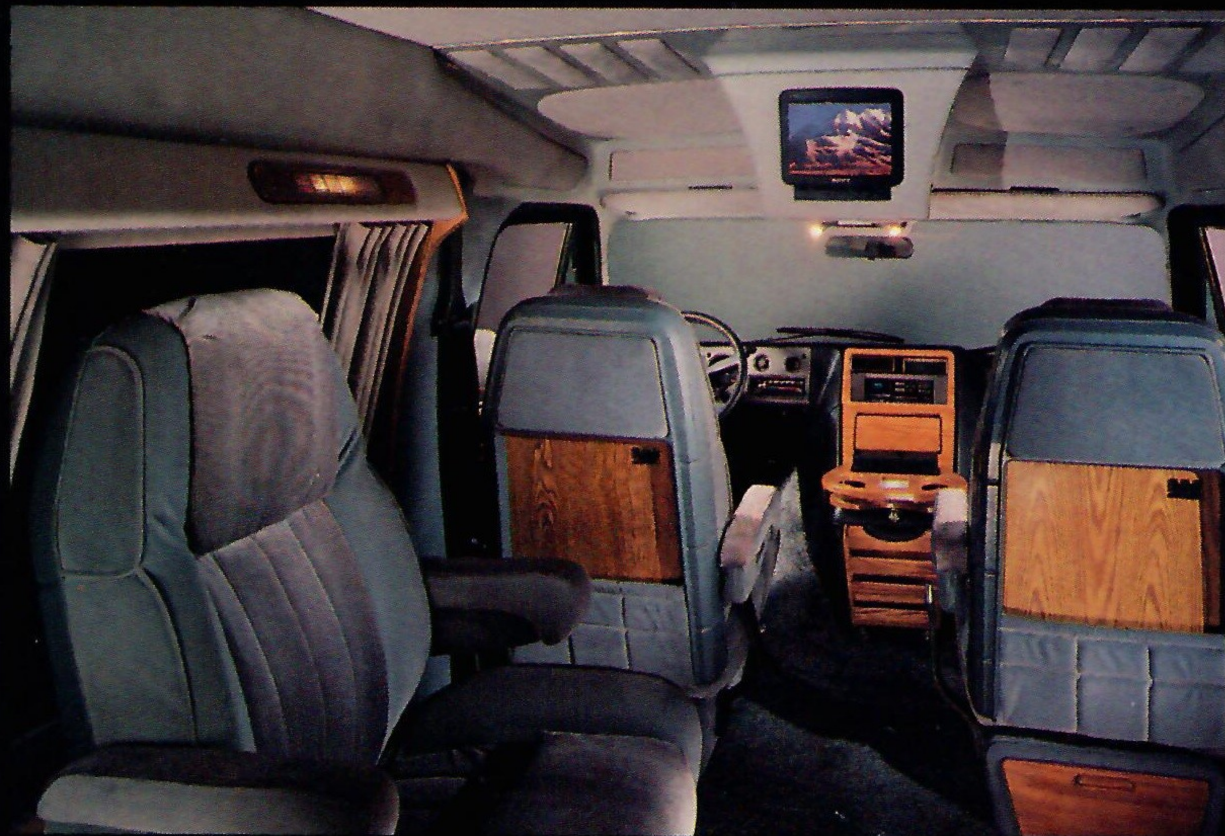
Eagle Limited without optional sun roofs.

Luxurious and exciting. Compare the Eagle Limited to the world's most prestigious cars. The quest for excellence is evident the moment you open the door. Plush custom aircraft style captain seats*, overhead cockpit console* with built in Sony color television (raised roof), exclusive glide track* drapery tracks, concealed steel impact bar** welded in both sides, built in 3/4" solid oak side rails**, recessed ceiling mounted mood travel lighting**, plus many, many other luxury features. A complete list of optional and standard features is shown on page 14.