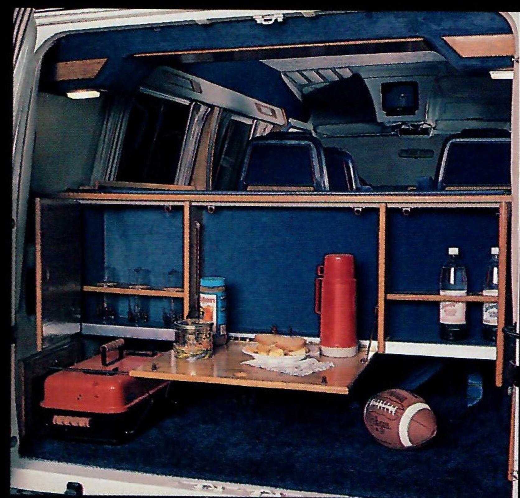
Solid oak entertainment center is standard on wrap-around lounge. Makes tailgating parties more fun.