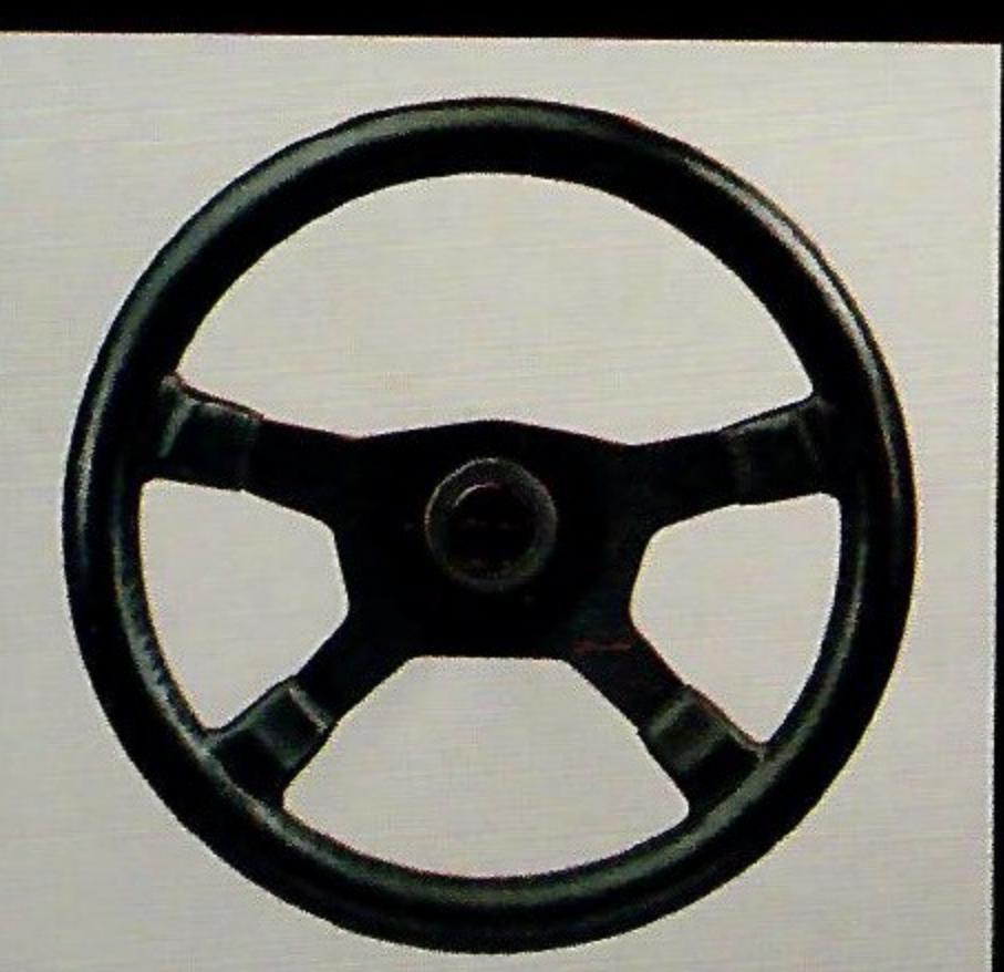
Leather wrapped steering wheel