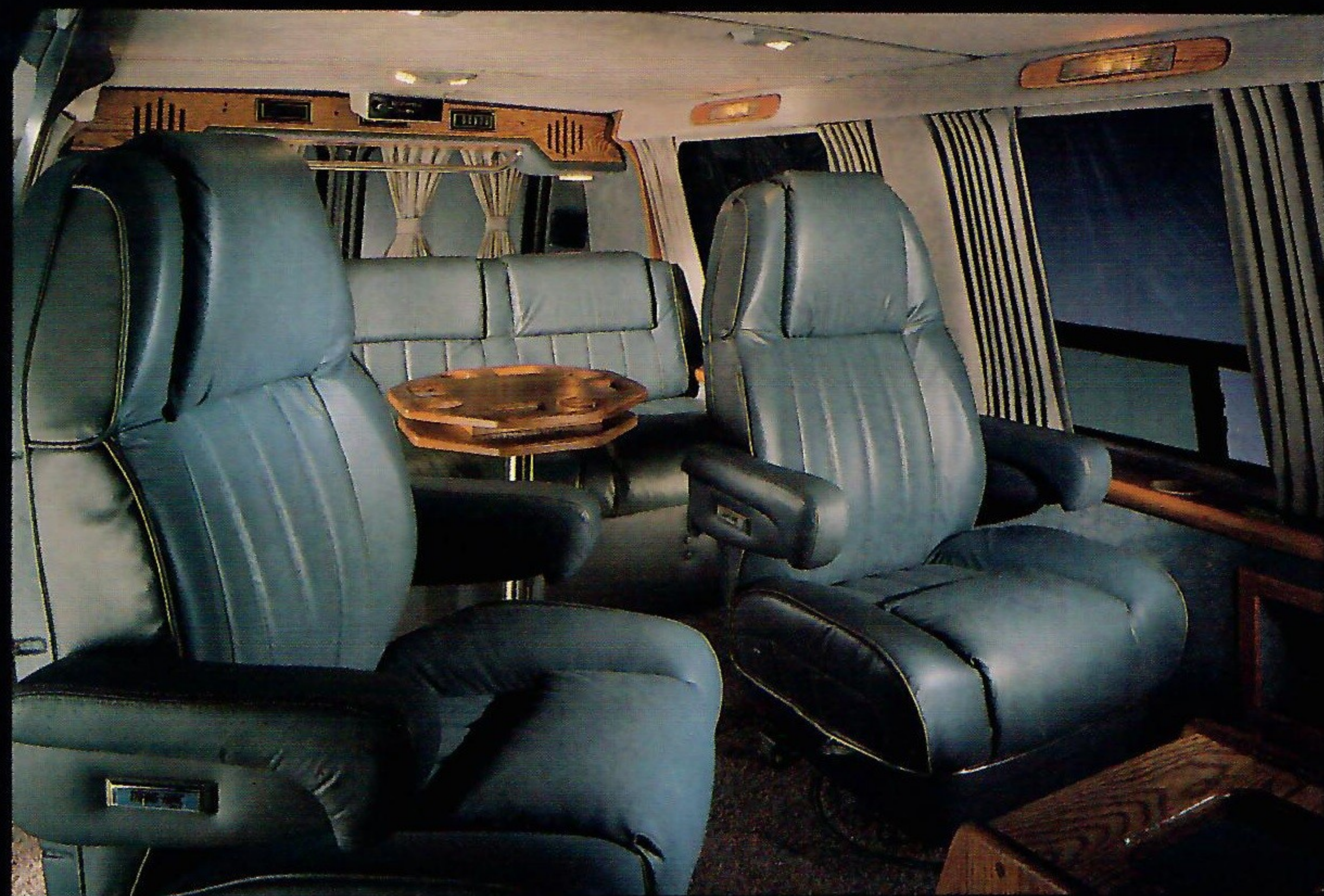
Eagle Limited with optional luxury leather.