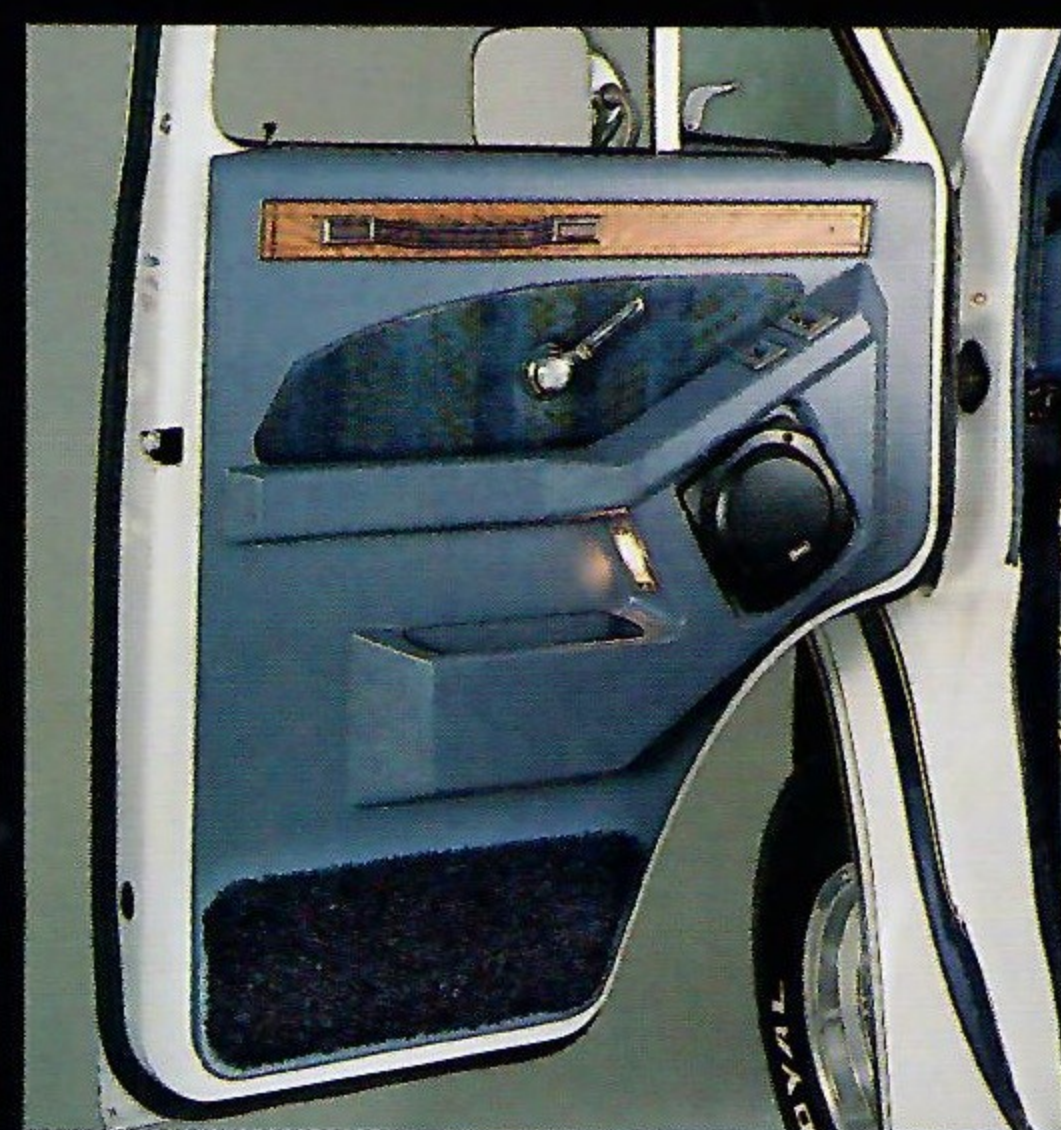
Soft and elegant automotive style door panels.