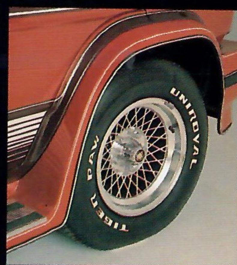
Custom aluminum star mag wheel