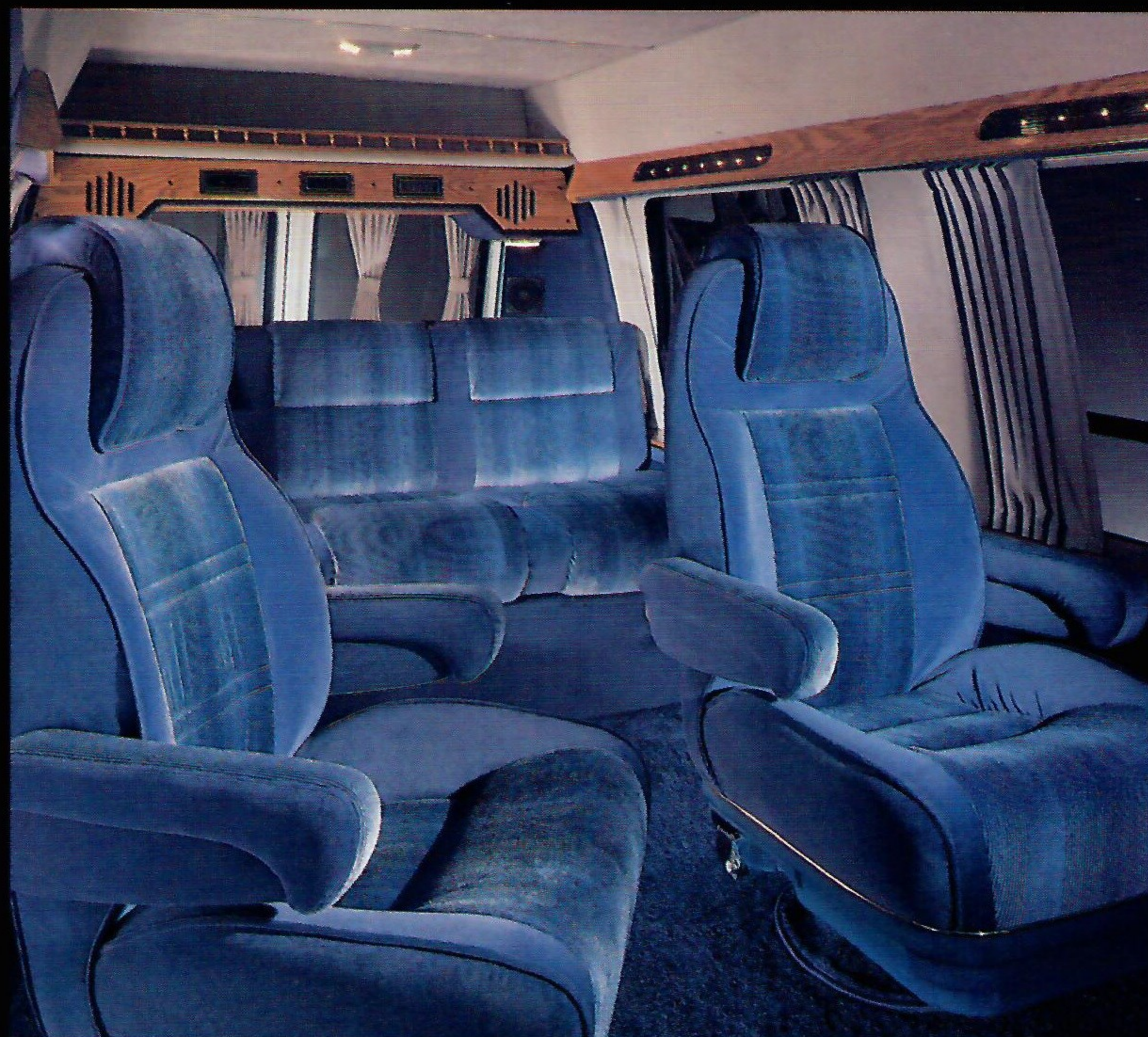
Deluxe plush style contoured seats are just one of the fabulous features of the all new Trans-Aire Sierra.

The elegant style of the all new Trans-Aire Sierra will please the most discriminating buyer. The raised roof model shown has an exclusive front overhead cockpit design** with built in remote color T.V., oak accents and storage compartments. The compartment over the driver's seat is pre-wired for video cassette player. Built in 3/4" solid oak side rails** and concealed steel impact bar** welded in both sides, plus many other features are standard.