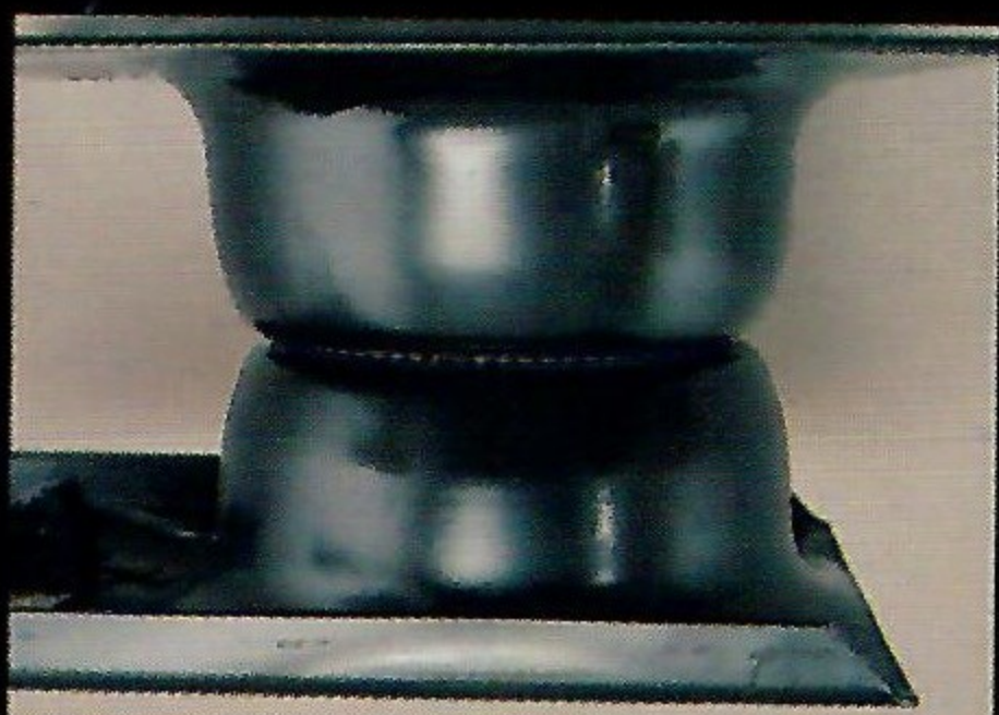
67 ball bearings for easy swivel