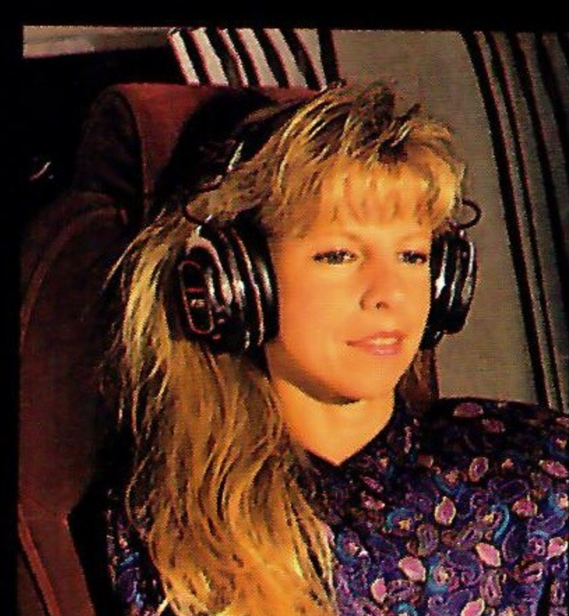
Wireless headphones. Listen to radio or T.V.