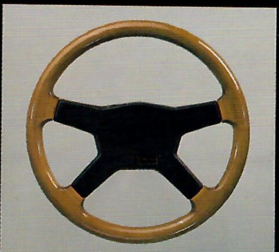
Oak steering wheel