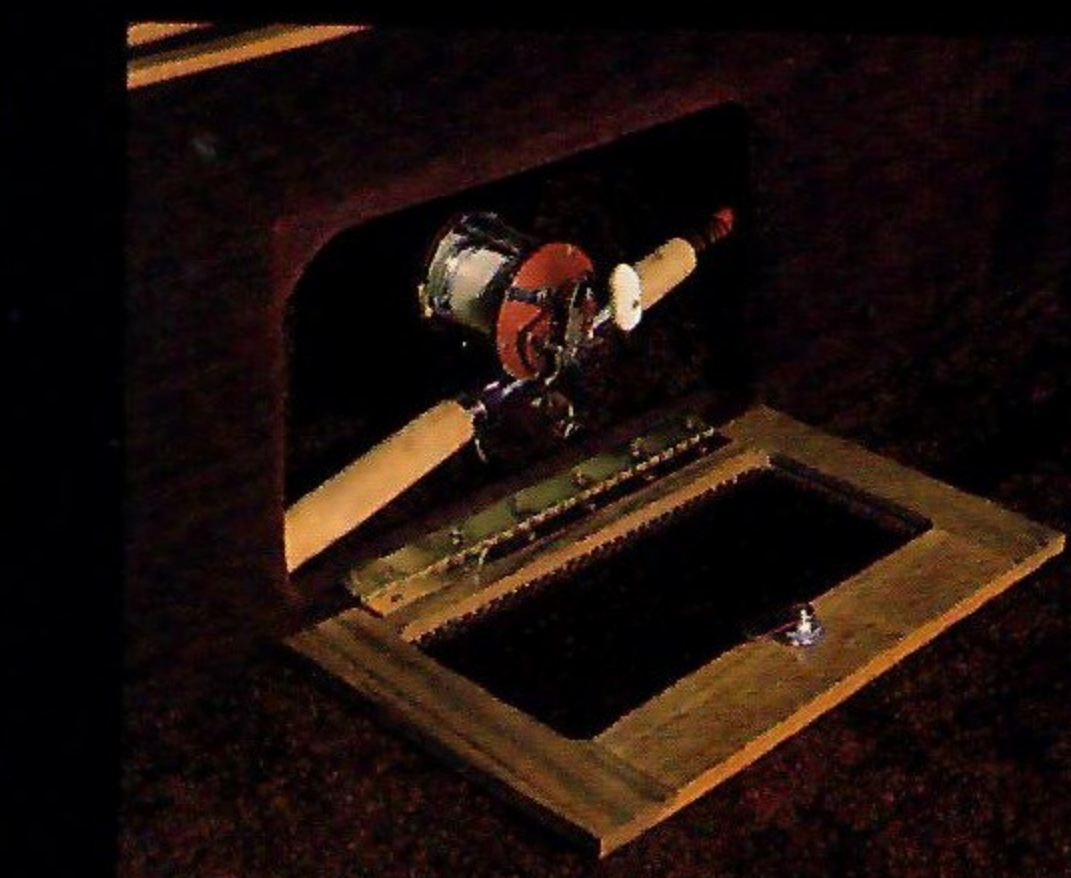
Rear storage compartment