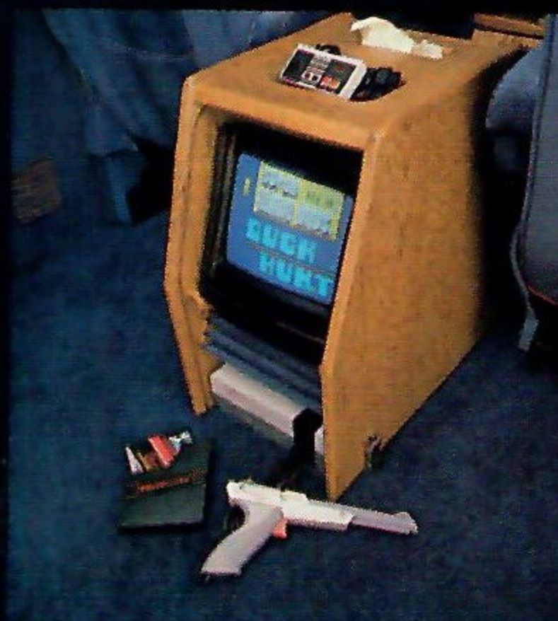
Oak TV cabinet with Nintendo game