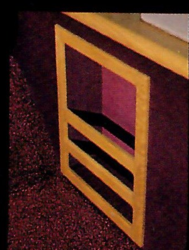
Oak magazine rack