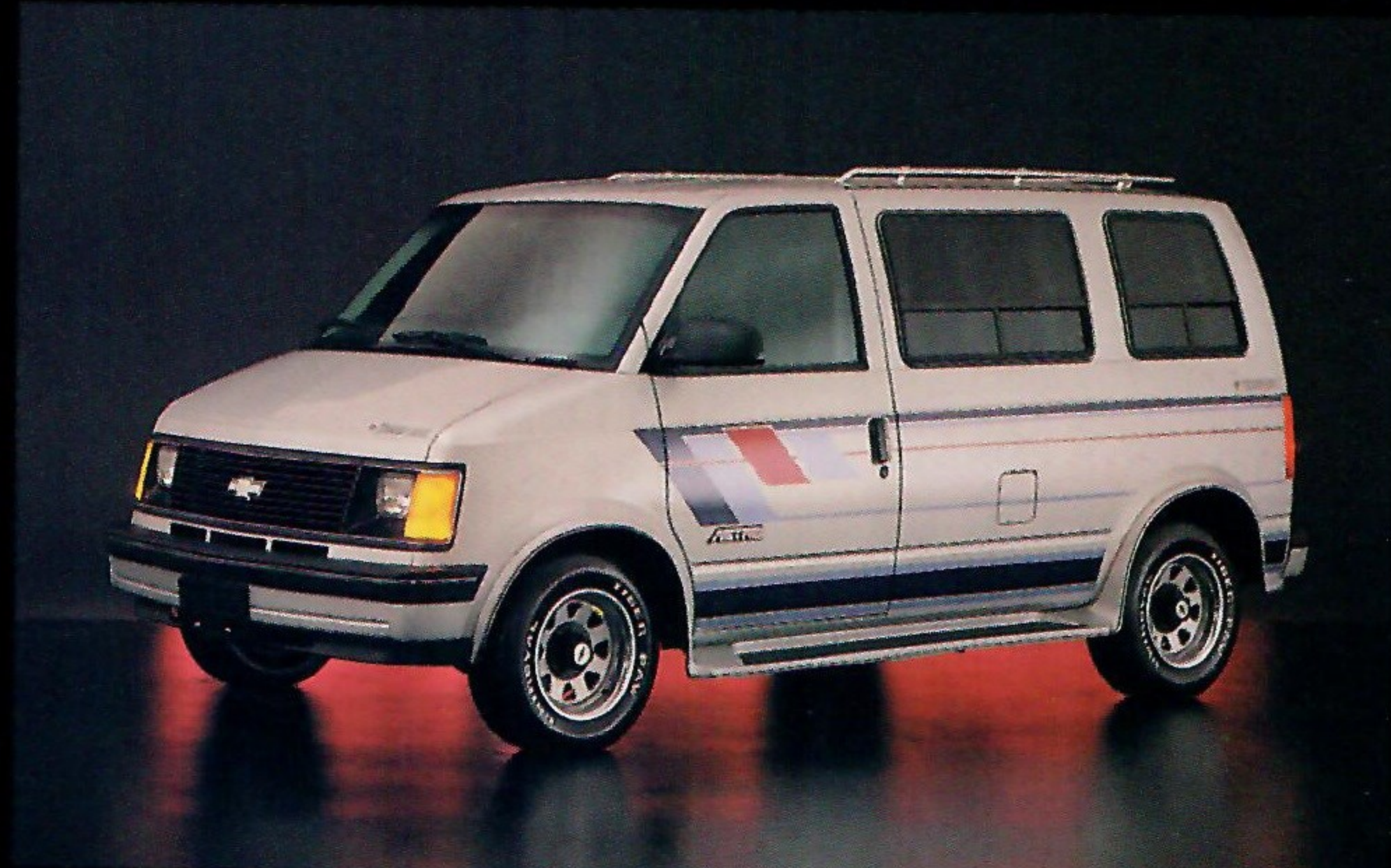
Optional custom exterior paint graphics.