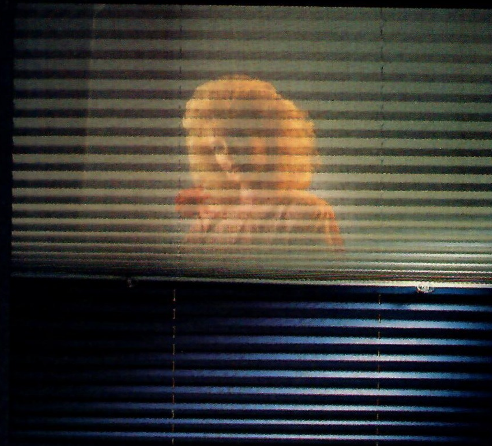
Day/night pleated fabric shades