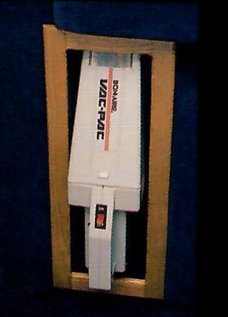
Built in power vac