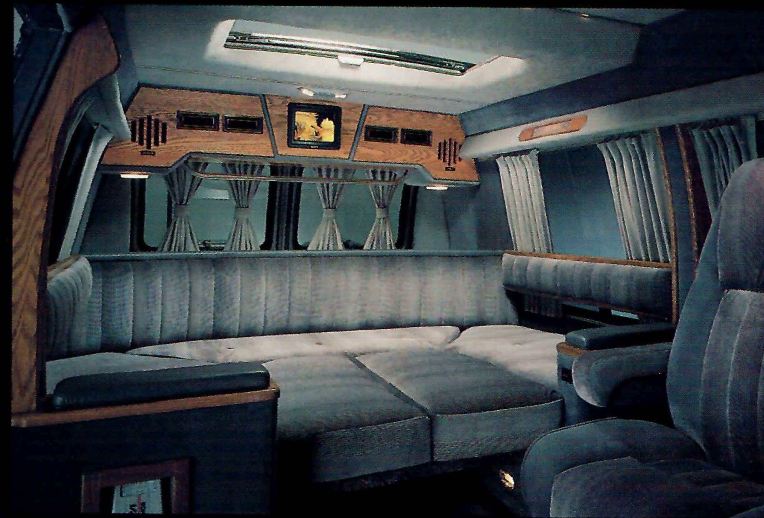
Wrap-around lounge in bed position. Shown with optional electric rear sliding moon roof and rear television.

The Wrap-Around Lounge is an exclusive design of Trans-Aire International. Beautiful handcrafted oak paneling accents the plush interior. Sofa end panels have built in ashtrays, beverage holders and power vac compartment. Four (4) custom contoured captain seats complete the seating arrangement. Lots of storage behind rear lounge and under seat cushions. The Wrap-Around Lounge is available in the Sierra and Eagle models.