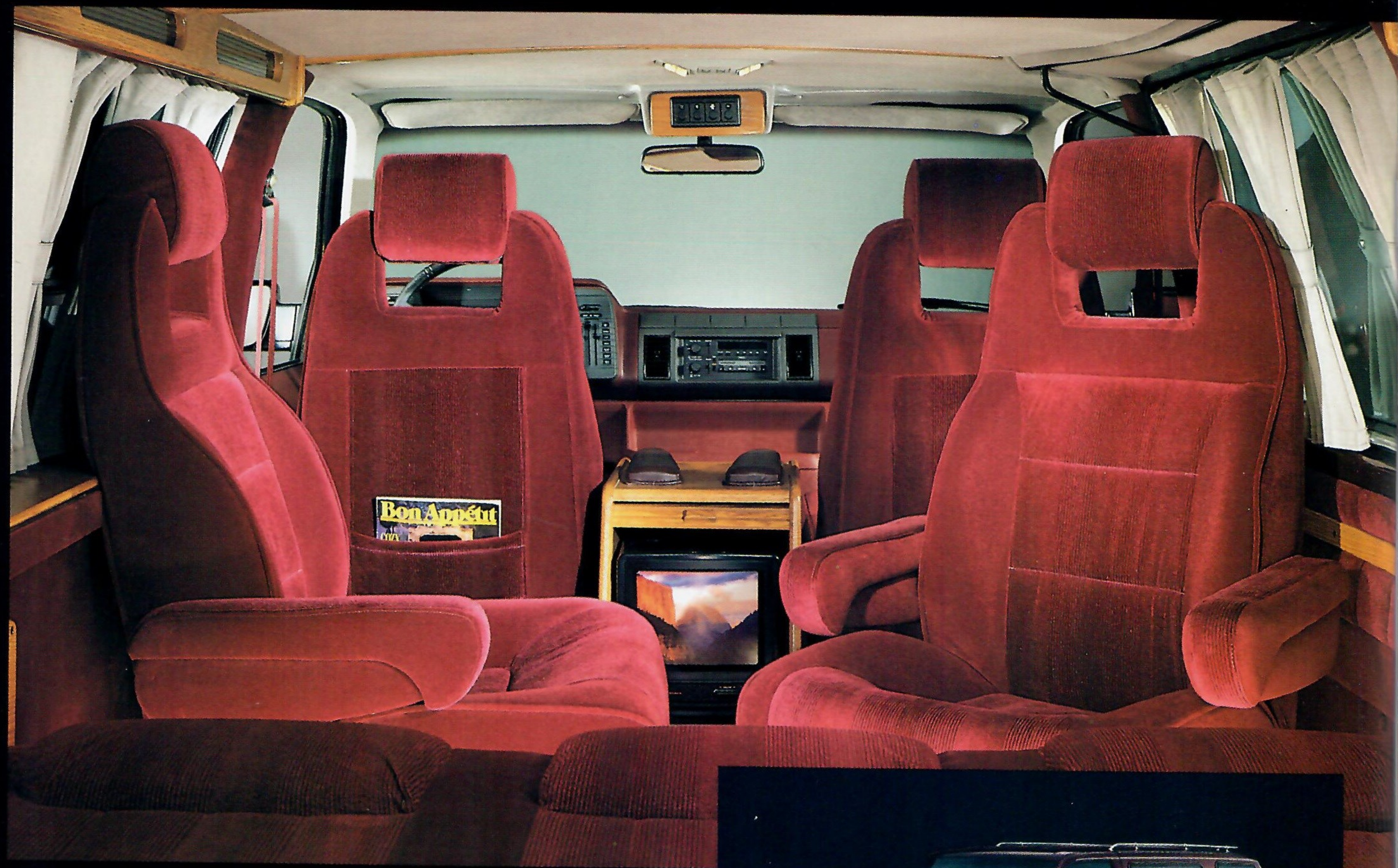
Trans-Aire's Luxury Sport Cruiser with plush style contoured seating and optional remote control 9" color T.V. in solid oak cabinet.

Designed to Satisfy the Most Discriminating Taste!