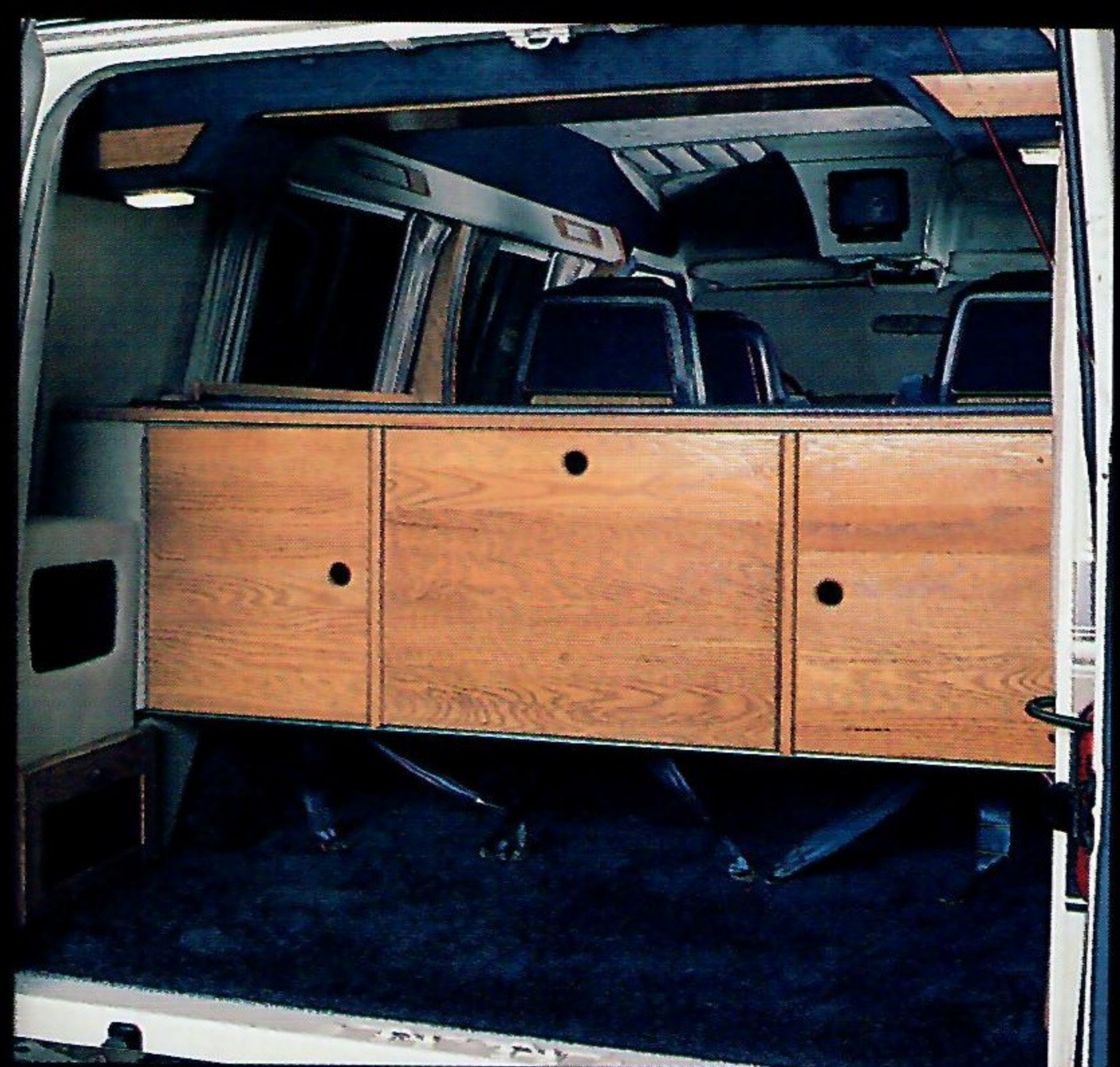
Large storage area behind and under rear lounge.