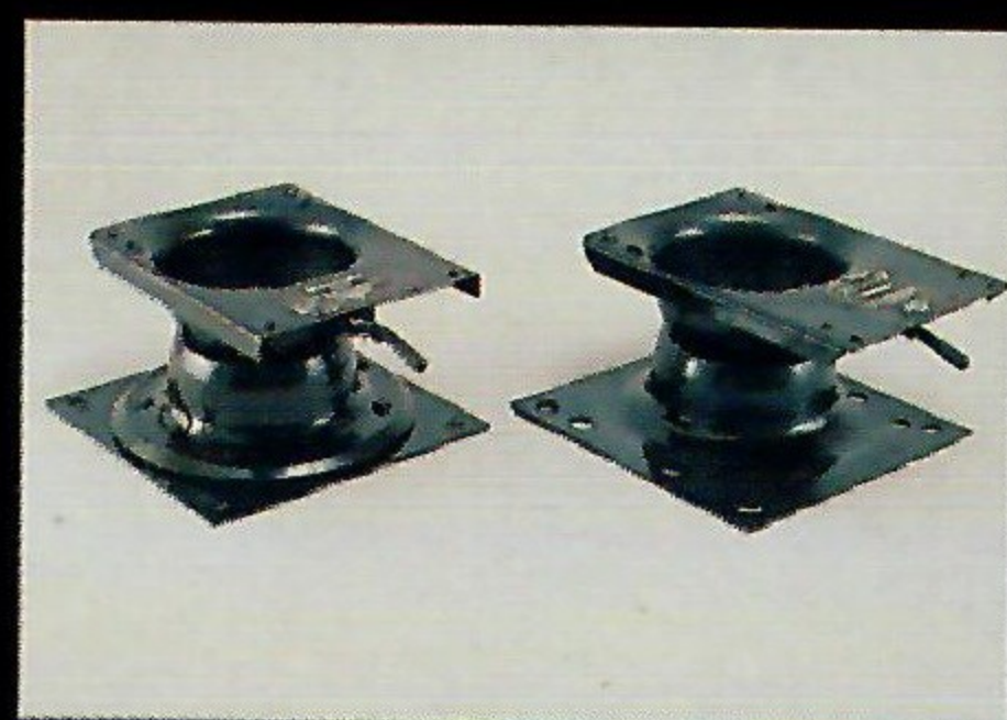
Stamped steel non-welded pedestals