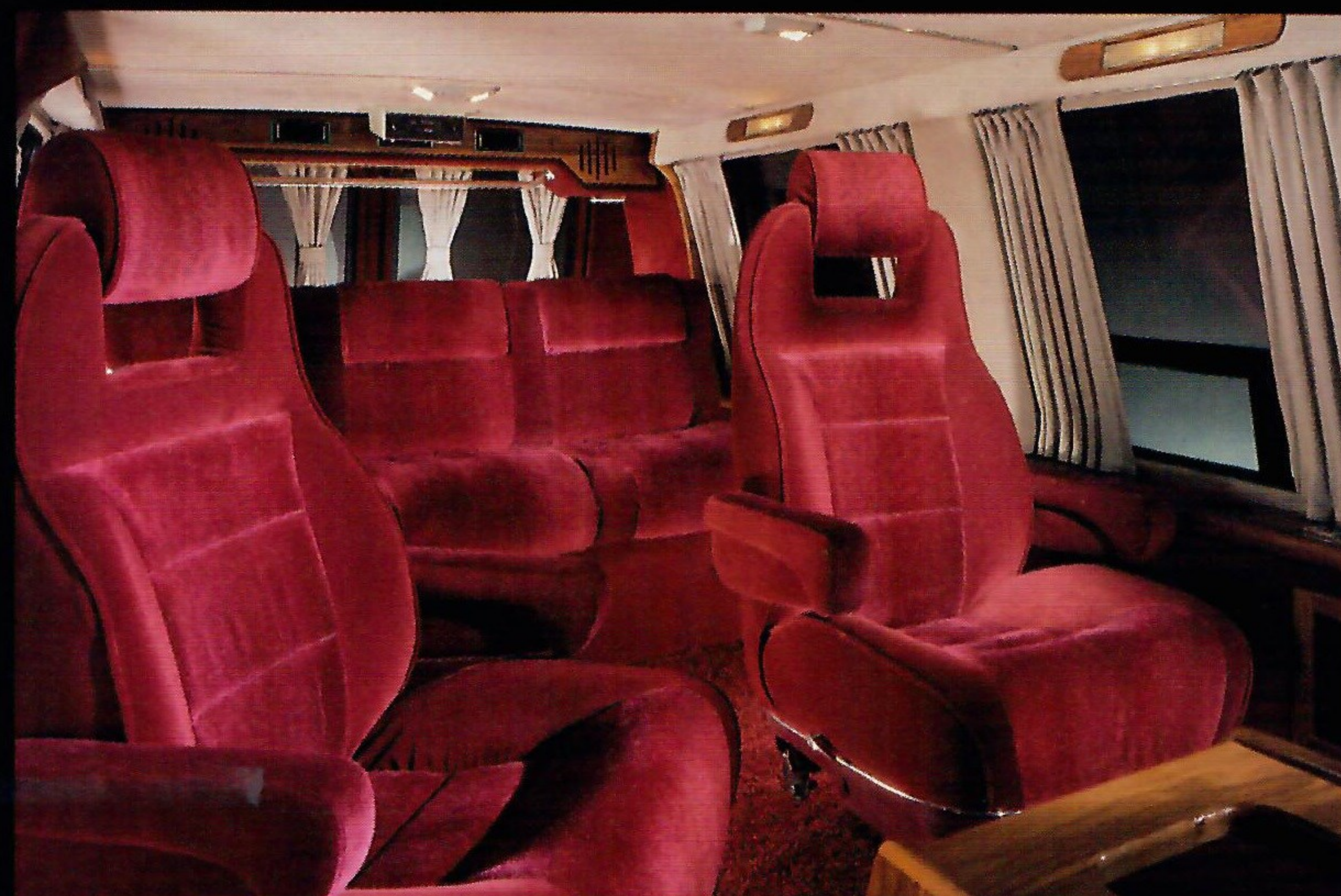
Eagle Seville Regular roof interior with plush Eurostyle contoured seats.