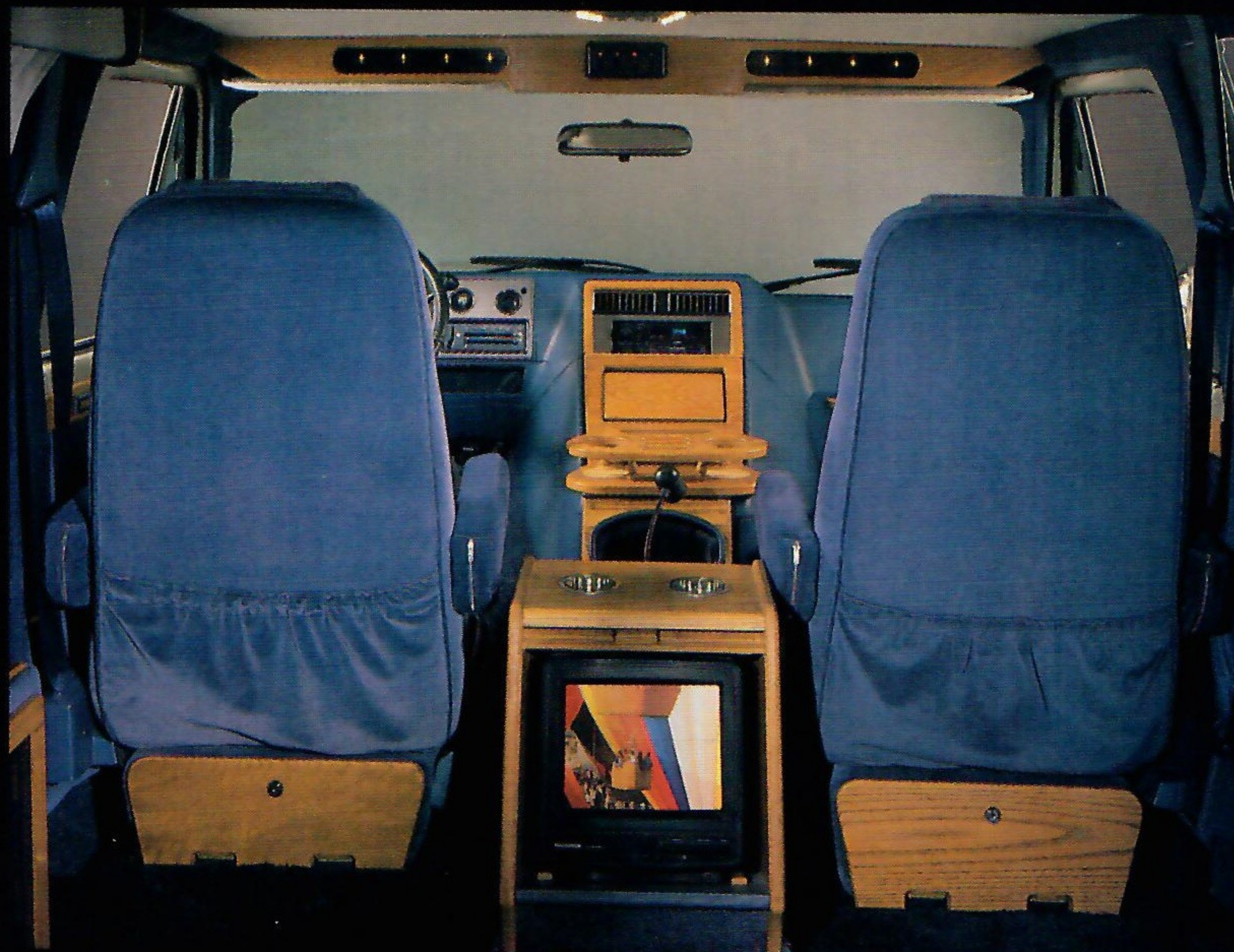
Delta Ranger interior shown with optional 9" color T.V. in quick release removable solid oak cabinet.

The Delta Ranger is an all new Trans-Aire model and far surpasses anything at or near its price. Designed for those who demand quality at an affordable price. Standard features include contoured style reclining captain seats and matching reclining sofa with 3-way bed extender**, full width oak overhead console, built in concealed storage areas, rear heat and air conditioning, clothes bar, concealed steel impact bar** welded in both sides, plus many other features.