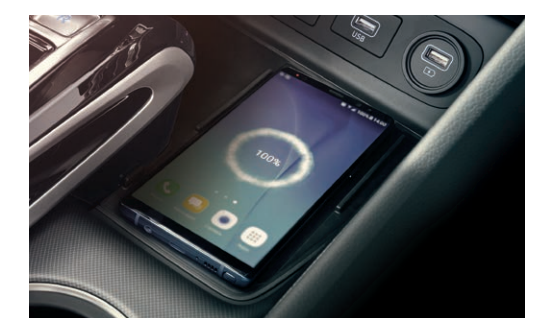
Standard interior ambient lighting Standard wireless charging pad<sup>▼</sup>