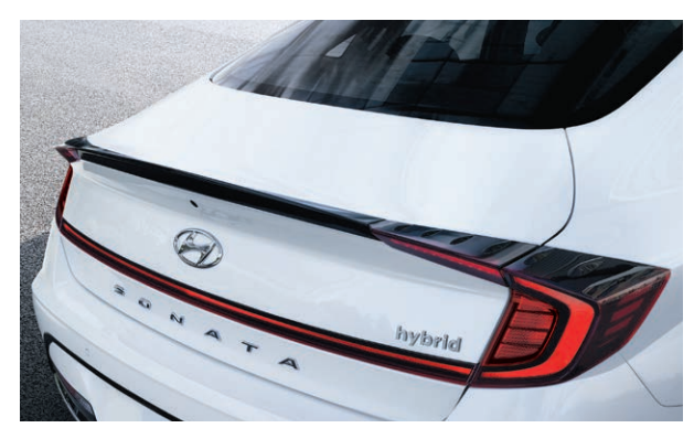
Standard 17" aero alloy wheels Standard premium full LED tail lights