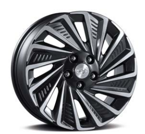
17" aero alloy wheel