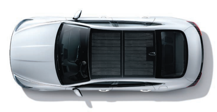
Solar panel roof

The Sonata Hybrid maximizes efficiency with the solar panel roof. When exposed to sunlight, the solar panels create energy to charge the batteries, and can generate enough electric power to increase the driving range by approximately 1,300 kilometres per year*.