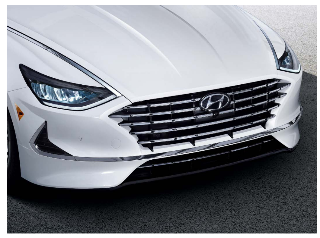
Standard LED headlights

The design of the Sonata Hybrid not only looks stunning, but also delivers outstanding aerodynamics thanks to smart engineering details. Its cross-hole grille can be easily overlooked but this unique-looking design feature comes with highly innovative technology — active air flaps that are designed to automatically open and close, to balance the need for engine cooling and improved aerodynamic efficiency. The integrated rear spoiler is another small detail that plays a key role in reducing air turbulence, as does the design of the alloy wheels.