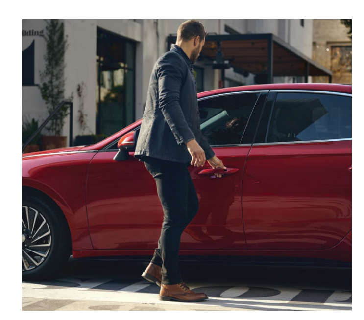
Standard proximity keyless entry with push-button ignition and remote start

The Sonata Hybrid features proximity key technology with the convenience of remote start, so you can warm up the cabin seamlessly on cold mornings.