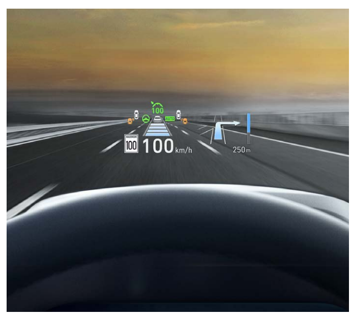
Standard Head-Up Display

The Sonata Hybrid features proximity key technology with the convenience of remote start, so you can warm up the cabin seamlessly on cold mornings.