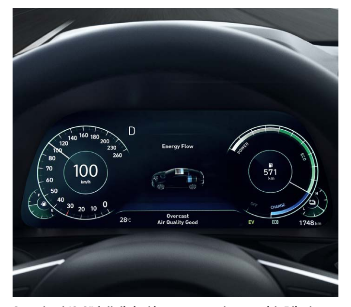
Standard 12.3" full digital instrument cluster with Blind View Monitor

With the Head-Up Display, you can keep your attention focused on the road with key information like your speed, the speed limit, notifications of whether there is a vehicle in either of your blind spots and navigation commands — all projected within your line of sight.