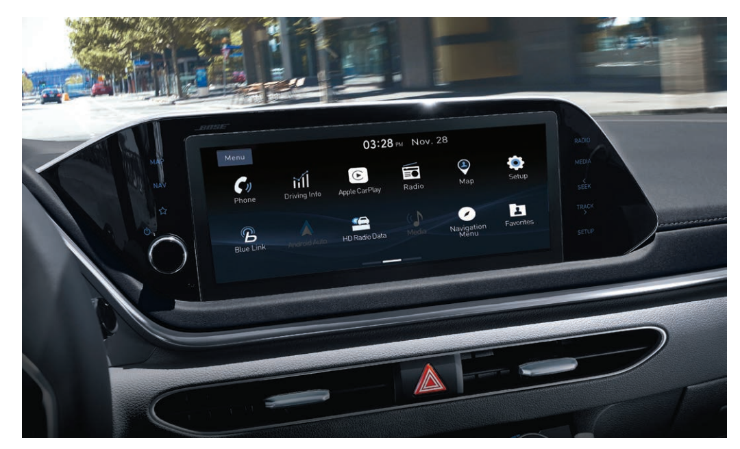
Standard 10.25" touch-screen display with navigation system

Make the most of your drive with seamless connectivity offered by Apple CarPlay<sup>™∆</sup> and Android Auto<sup>™⋄</sup>. The high-definition 10.25" touch-screen display offers intuitive smartphone mirroring to access your favourite apps, as well as multiple viewpoints with the 360-degree Surround View Monitor for ease in tight spaces. A Bose<sup>®</sup> premium 12-speaker sound system provides the ultimate immersive experience for your favourite music.