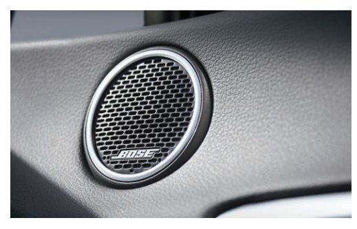
Standard Surround View Monitor Standard Bose® premium audio with 12 speakers