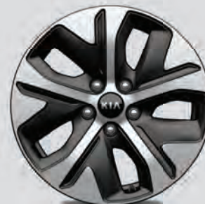
17" alloy wheels