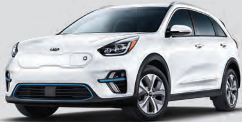
Snow White Pearl