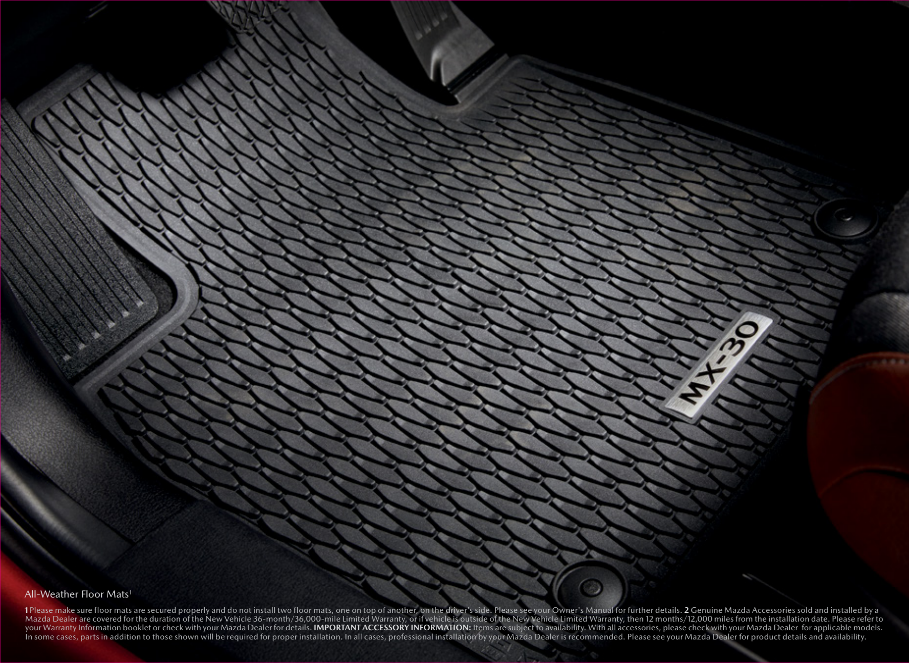
All-Weather Floor Mats 1

1 Please make sure floor mats are secured properly and do not install two floor mats, one on top of another, on the driver's side. Please see your Owner's Manual for further details. 2 Genuine Mazda Accessories sold and installed by a Mazda Dealer are covered for the duration of the New Vehicle 36-month/36,000-mile Limited Warranty, or if vehicle is outside of the New Vehicle Limited Warranty, then 12 months/12,000 miles from the installation date. Please refer to your Warranty Information booklet or check with your Mazda Dealer for details. IMPORTANT ACCESSORY INFORMATION: Items are subject to availability. With all accessories, please check with your Mazda Dealer for applicable models. In some cases, parts in addition to those shown will be required for proper installation. In all cases, professional installation by your Mazda Dealer is recommended. Please see your Mazda Dealer for product details and availability.