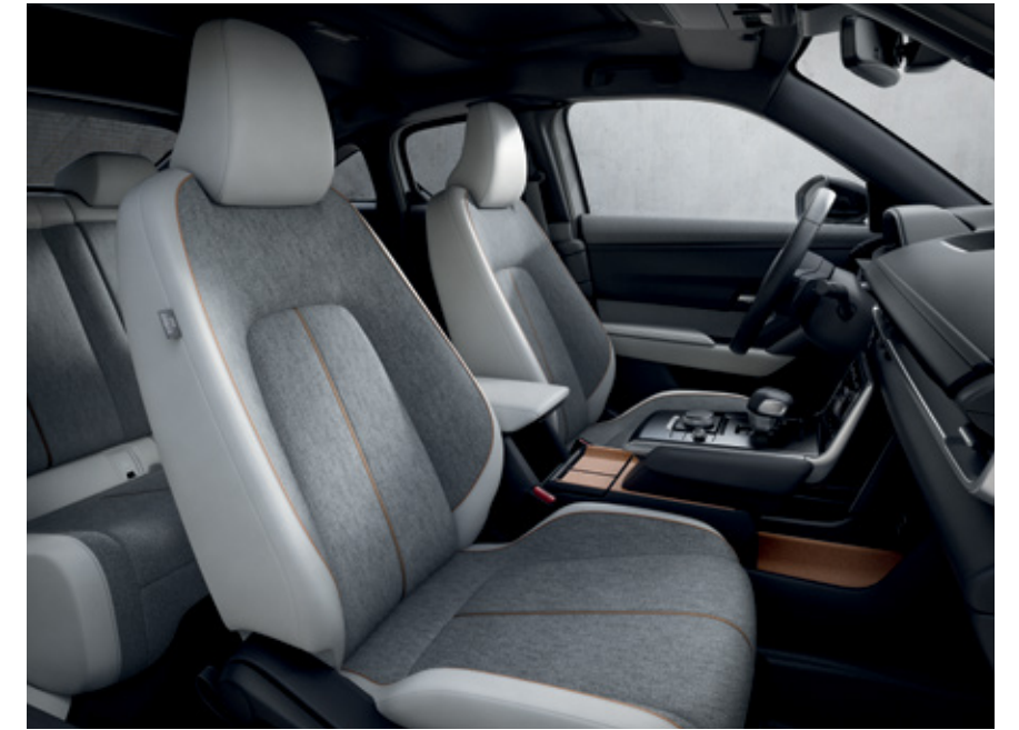
Modern Confidence 1,2 interior color scheme—Light Gray fabric inserts with Pure White leatherette trim