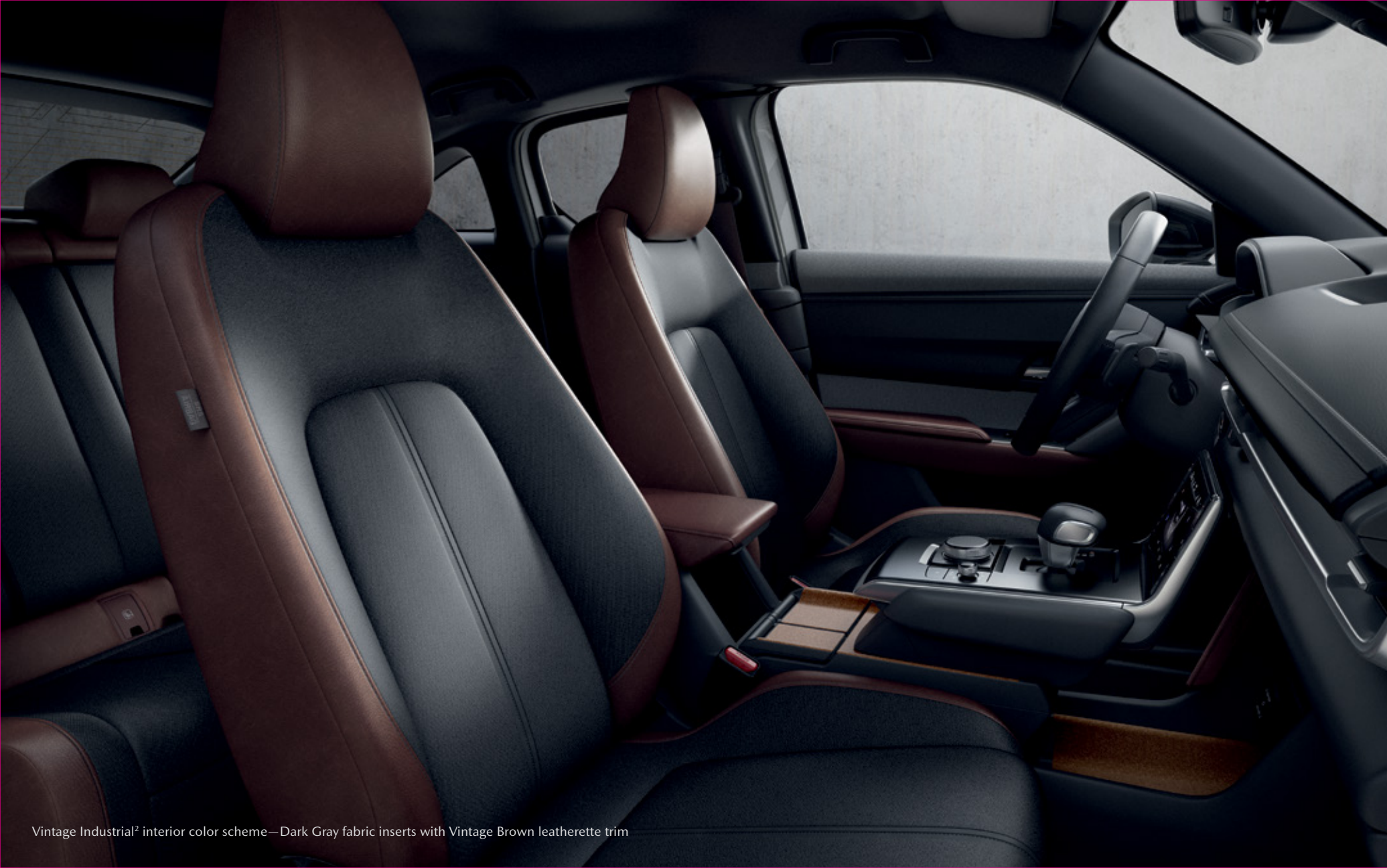
Vintage Industrial 2 interior color scheme—Dark Gray fabric inserts with Vintage Brown leatherette trim