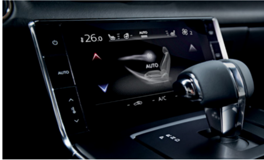
Standard touchscreen automatic climate control