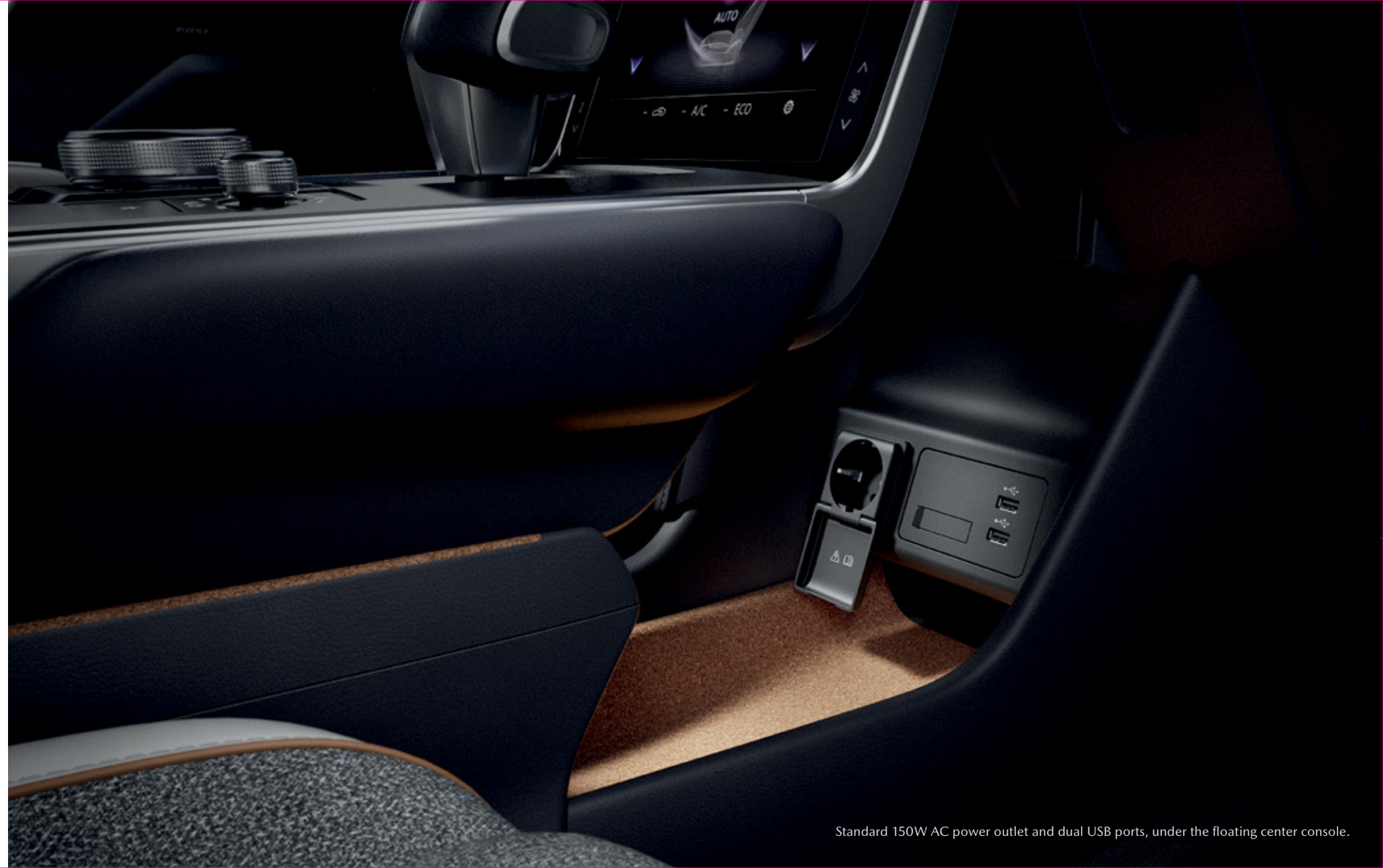
Standard 150W AC power outlet and dual USB ports, under the floating center console.