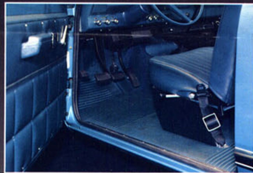
Full-size comfort. Extra-wide doors, smooth floor, lots of legroom and that "compact camp" feeling.