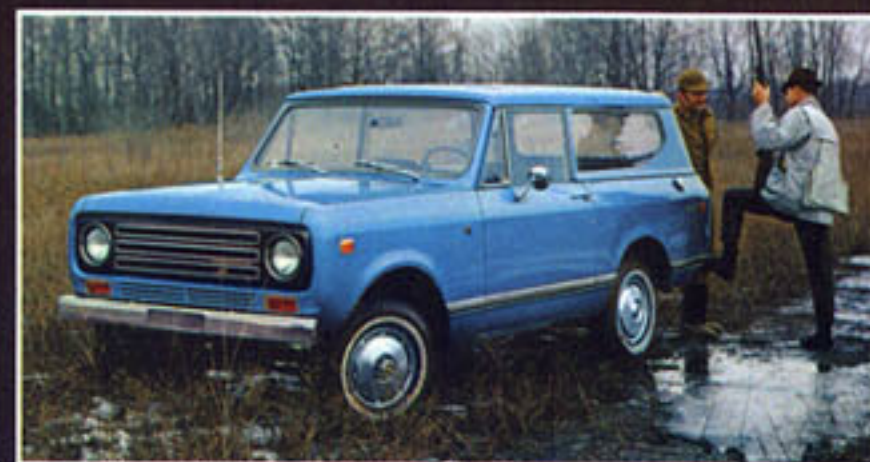
Sportsman's dream. Rugged off-road dependability with the driving refinements of a sports car.