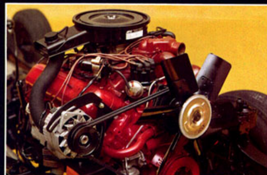
Power-packed V-8. A 345 cubic incher that delivers all the power you'll ever want. Meets all emission requirements. Available with automatic choke, and modulated fan to save gas.