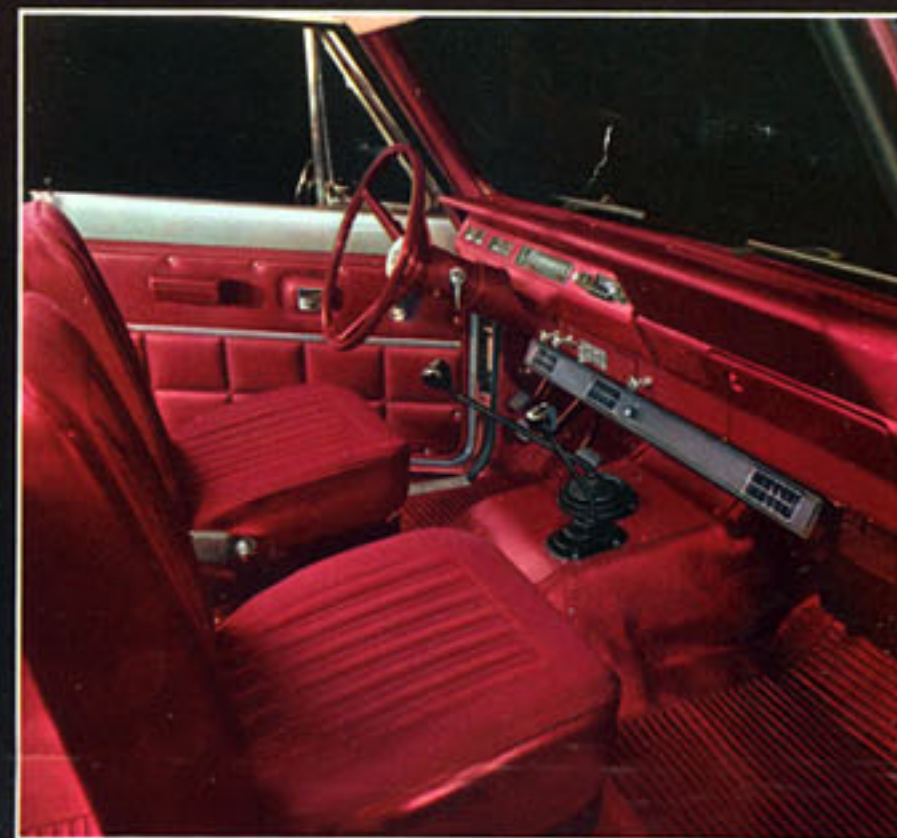
Luxurious interiors in choice of colors, with bucket seats or 1/2-3/4 split bench seat, and selection of comfort/convenience options.