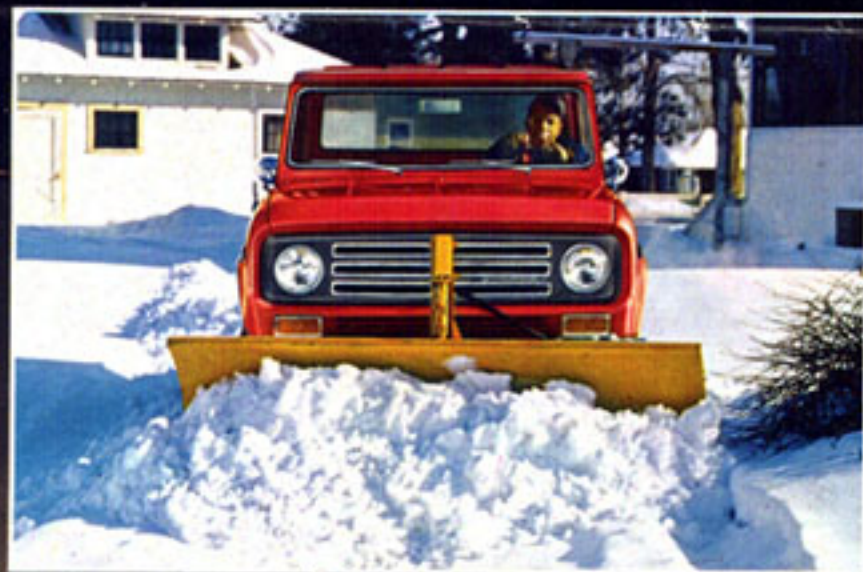
Muscles for moving. Scout II is a year 'round workhorse. It can be equipped with an electric or hydraulic snow plow, transfer case power take off, front tow hook and rear tow loop.