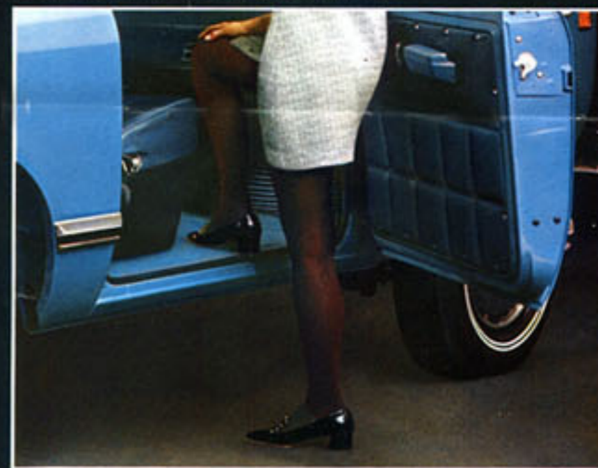
On the level. Floor and door frame are same height. No stepping down into a well or up to get into the back seat.