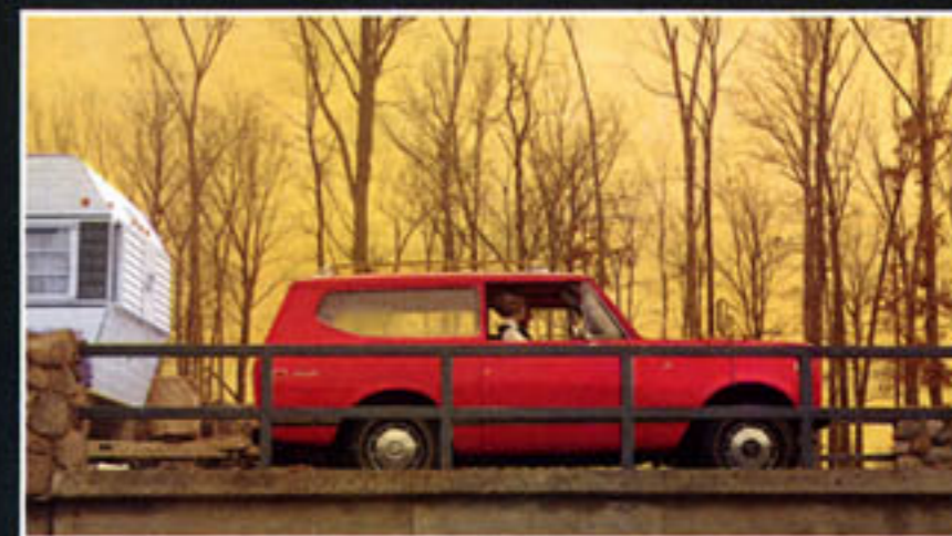
New Smoothie. Body and engine rest on rubber "cushions" to remarkably reduce vibration and noise.