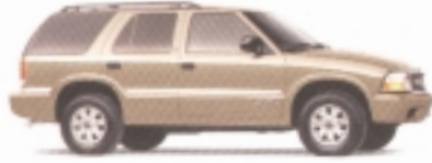
Topaz Gold Metallic