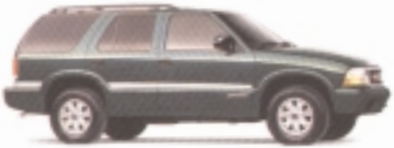
Meadow Green Metallic