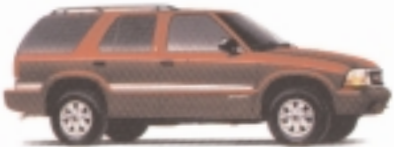
Magnetic Red Metallic