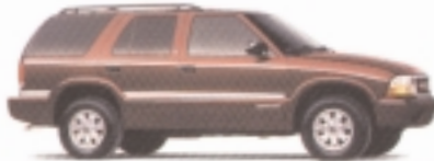
Monterey Maroon Metallic