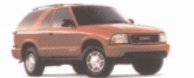
Cherry Red Metallic

Diamond Edition Aluminum With matching center cap, standard on all 4WD Diamond Edition models.