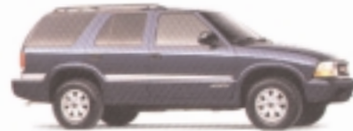
Indigo Blue Metallic