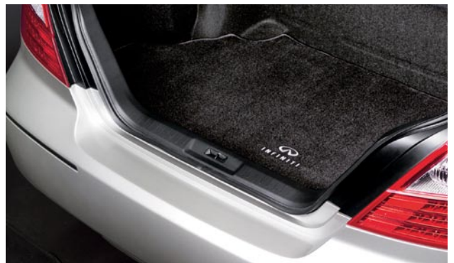
4 sunroof wind deflector 5 carpeted trunk mat