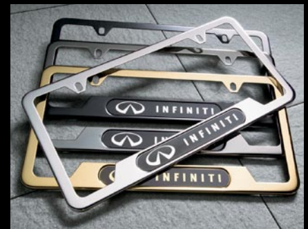
3 license plate frames

3 license plate frames. Customize, enhance and add personal style to the front and rear of your vehicle’s exterior. Constructed of stainless steel for durability and weather-resistance, these license plate frames are available with or without Infiniti logo in several finishes (polished, satin, matte black, black pearl and gold).