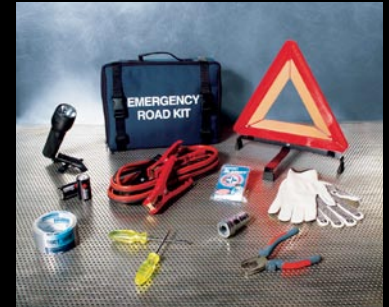
1 first-aid kit 2 emergency road kit

1 first-aid kit. It makes a great addition “just in case.” Basic supplies are contained in a convenient, durable, zippered pouch. A velcro patch is on the back, so the kit adheres to any carpeted surface.