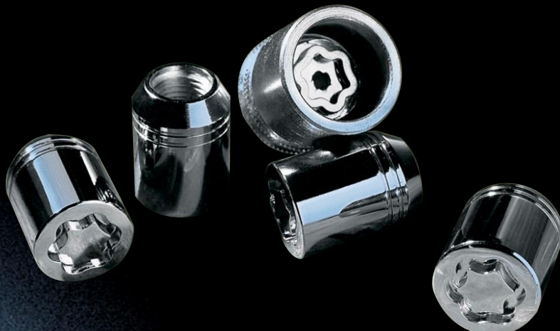
4 wheel locks

4 wheel locks. Help protect wheels against theft. Each wheel lock set contains four lug nuts and a special coded lug nut socket with narrow-groove key pattern. Constructed of materials for superior durability and corrosion-resistance.