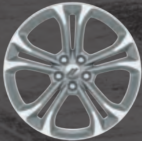
20x8-inch Satin Carbon Standard on R/T Included with Plus Package on GT RWD