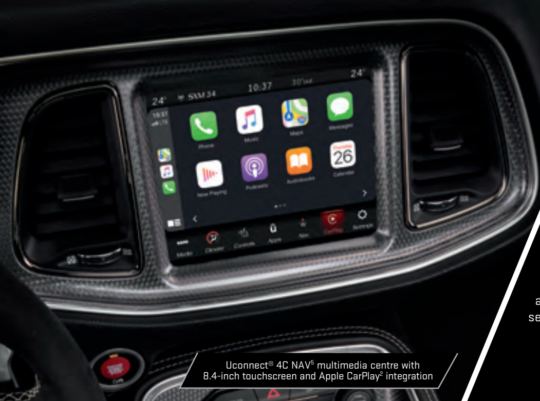
Uconnect® 4C NAV 2 multimedia centre with 8.4-inch touchscreen and Apple CarPlay 2 integration