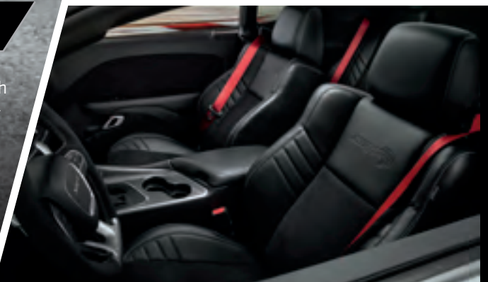
SRT® interior shown with Laguna leather seats and perforated inserts in Black

Charger SRT Hellcat Widebody includes the SRT® tuned Bilstein Three-Mode Adaptive Damping Suspension system that provides driver-selectable settings to include: Street (Auto) Mode = sporty but compliant ride; Sport Mode = firm, maximum handling; Track Mode = firm, maximum handling plus performance shifting and a gear-holding feature to suit any driver's needs. The SRT Drive Modes, which are accessed via the 8.4-inch Uconnect® touchscreen, offer selectable settings for Street (Auto), Sport and Track. There is also a custom setting that allows drivers the ability to tailor their experience by individually adjusting horsepower, transmission shift speeds, steering effort, paddle shifters, traction and suspension preferences. The standard SRT Performance Pages bring critical vehicle performance data to the driver's fingertips, while race options give the driver the ability to access Launch Control, Shift Light and Line Lock.