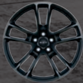
20x11-inch Carbon Black Standard on SRT Hellcat® Widebody Optional on Scat Pack 392 Widebody