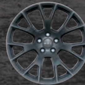
20x11-inch Warp-Speed Granite Optional on SRT Hellcat Widebody