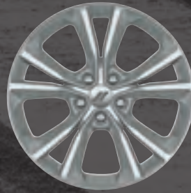
19x7.5-inch Satin Carbon Standard on SXT AWD and GT AWD