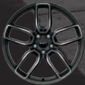
20x11-inch Devil's Rim Forged Standard on Scat Pack 392 Widebody