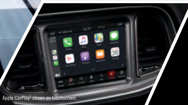
Apple CarPlay 2 shown on touchscreen.