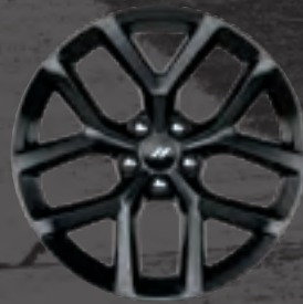
20x8-inch Black Noise Included with Blacktop Package on SXT RWD, GT RWD and R/T