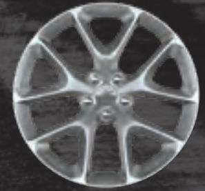
20x8-inch Satin Carbon Standard on GT RWD Included with Plus Package on SXT RWD