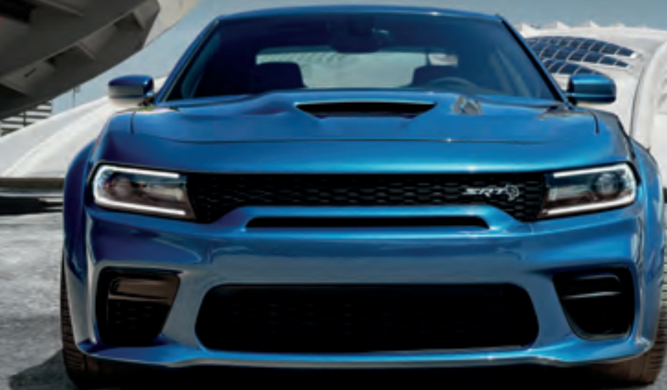
SRT Hellcat® Widebody shown in Frostbite

QUICKEST SEDAN EVER 3 1/4 MILE: 10.96 SECONDS