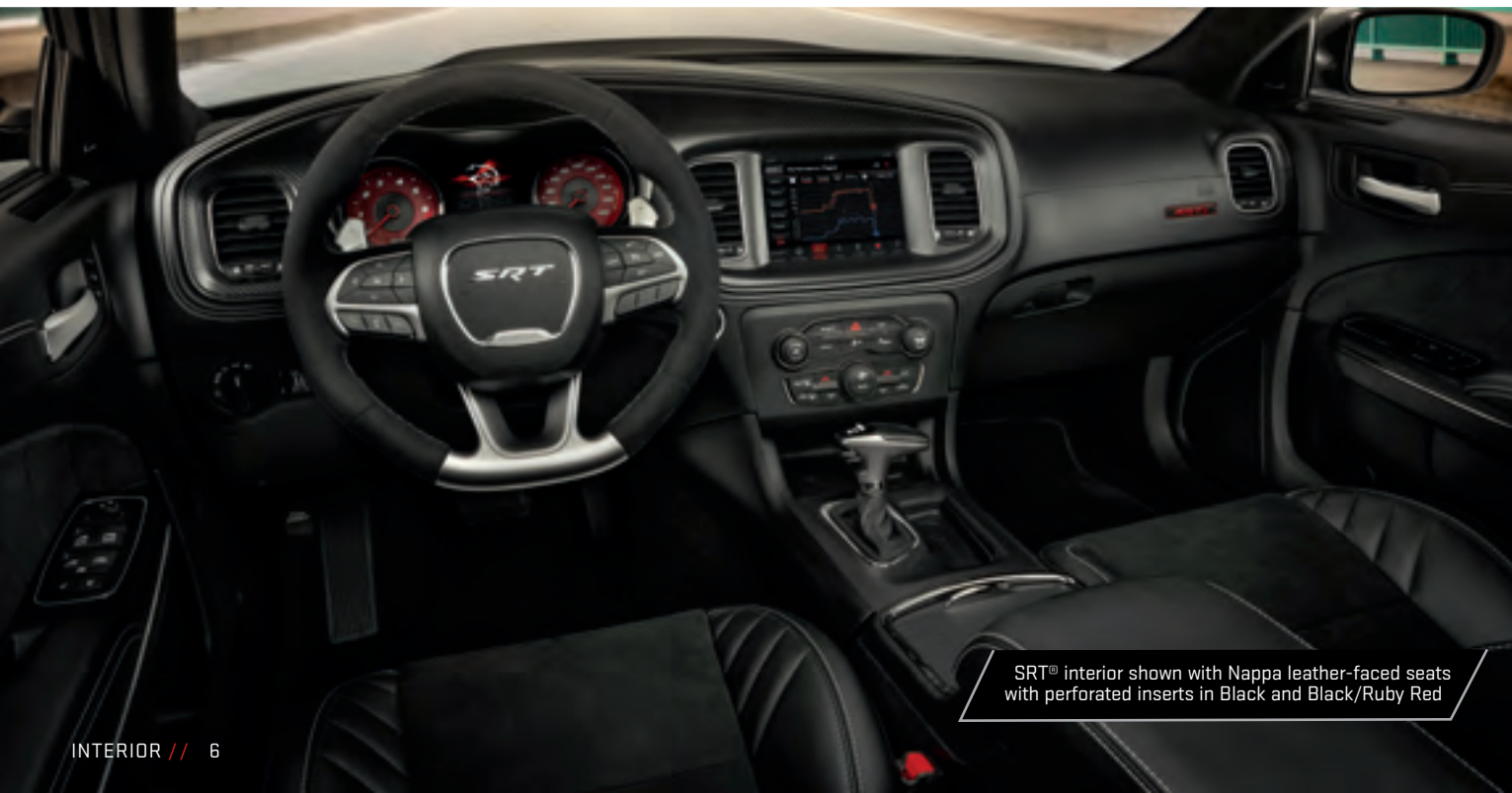
SRT® interior shown with Nappa leather-faced seats with perforated inserts in Black and Black/Ruby Red

Spacious and comfortable, Charger offers more than enough space for five adults. Seat options range from premium cloth to Nappa leather-faced with Alcantara® suede inserts to premium Laguna full-leather. Standard cabin details include integrated storage, soft-touch surfaces and available Dual-Zone Automatic Temperature Control (ATC). Heated/ventilated front seats, heated rear seats and a full-circumference heated steering wheel for year-round comfort are also available.