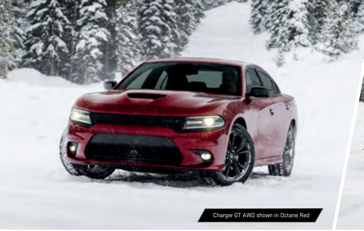
Charger GT AWD shown in Octane Red