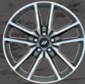
20x8-inch Tinted Clear Polish with Granite Pockets Included with Plus Package on R/T