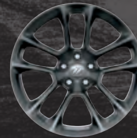
20x9-inch Low-Gloss Granite Crystal Standard on Scat Pack 392 Included with Daytona Package on R/T