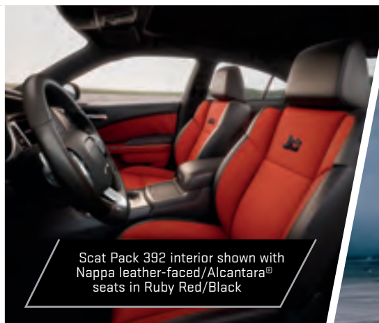
Scat Pack 392 interior shown with Nappa leather-faced/Alcantara® seats in Ruby Red/Black

The interior boasts standard race-inspired seats complete with embroidered Bee logo (standard high-performance premium cloth or available Nappa leather-faced with Alcantara® suede inserts). Every Scat Pack 392 model includes Dodge SRT® Performance Pages that feature everything from Launch Control to a g-force meter to drag-race timers. This real-time data can also be accessed on either the standard 7-inch, full-colour, customizable, in-cluster display centre housed between the gauges or the standard 8.4-inch Uconnect® touchscreen. SRT Drive Modes offer the ability to customize steering feel, transmission shift points, throttle response, ESC 4 tuning and suspension firmness (if equipped with Adaptive Damping Suspension).