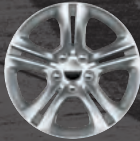
17-inch Fine Silver aluminum Standard on SXT RWD