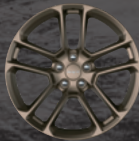
20x9.5-inch Brass Monkey Lightweight Forged Optional on Scat Pack 392