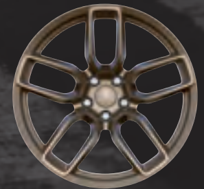
20x11-inch Brass Monkey Widebody Forged Optional on SRT Hellcat Widebody