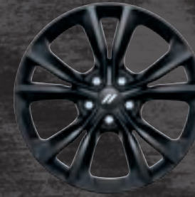
19x7.5-inch Black Noise Included with Blacktop Package on SXT AWD and GT AWD