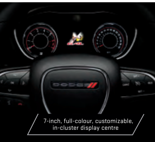
7-inch, full-colour, customizable, in-cluster display centre