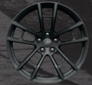
20x9.5-inch Low-Gloss Black Forged Included with Daytona Package on Scat Pack 392