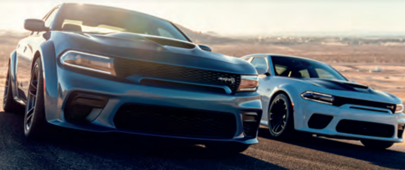
SRT Hellcat® Widebody (left) in Frostbite Scat Pack 392 (right) in White Knuckle