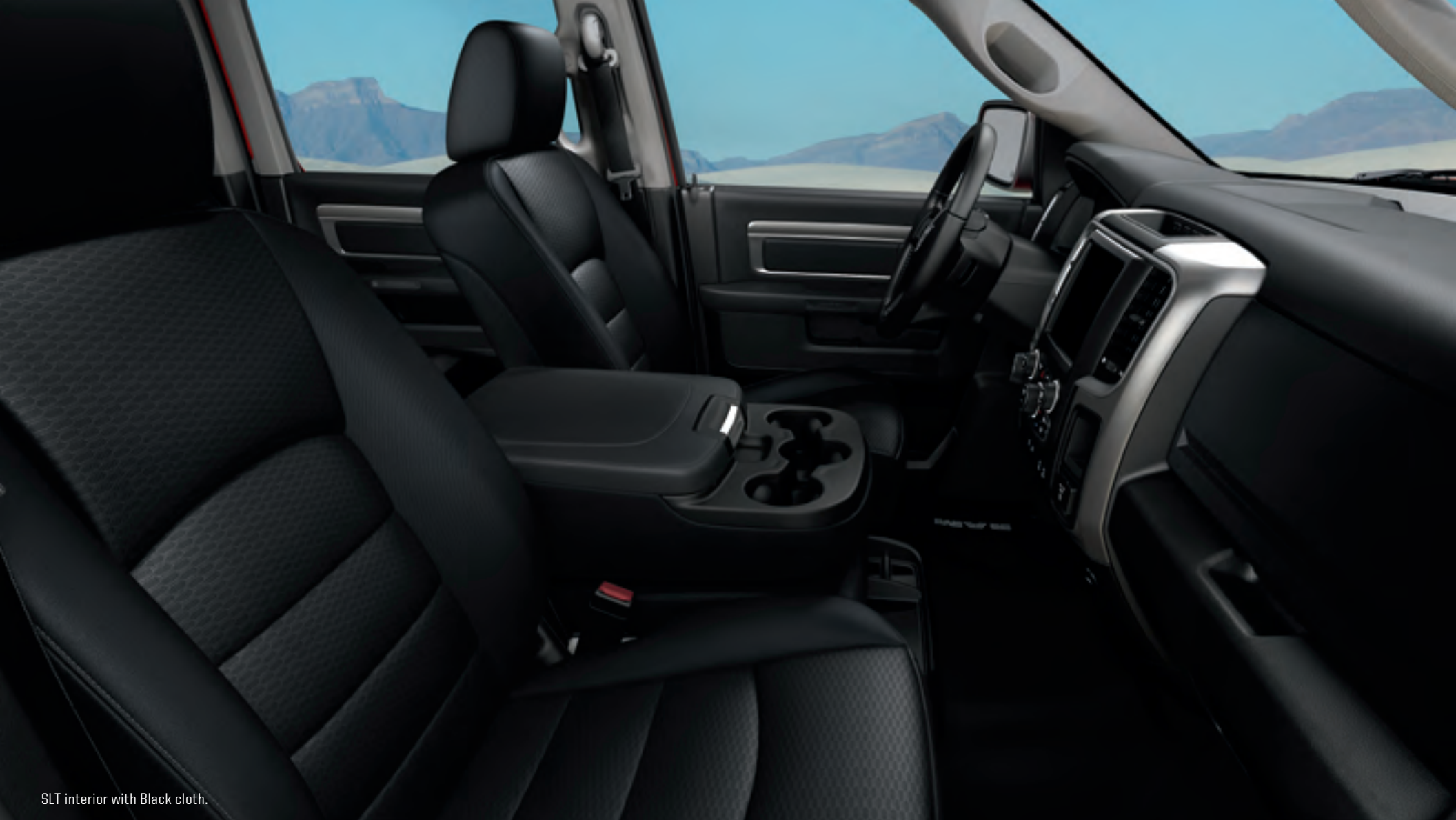
SLT interior with Black cloth.