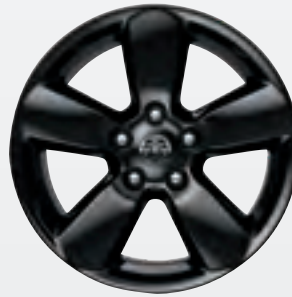
20-inch Semi-Gloss Black aluminum Standard on Express with Night Edition and Blackout Package Available on SLT with Black Appearance Package (WHN)