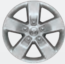
17-inch aluminum Standard on Express® and SLT Available on Tradesman (WFE)