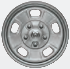
17-inch lightweight steel Standard on Tradesman® (WFP)