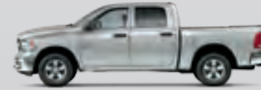
CREW CAB 5' 7" BOX