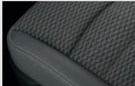
Cloth – Diesel Grey Express, SXT Plus and SLT – Standard; ST – Available