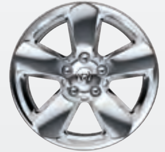
20-inch chrome-clad aluminum Available on SXT Plus (WHK)