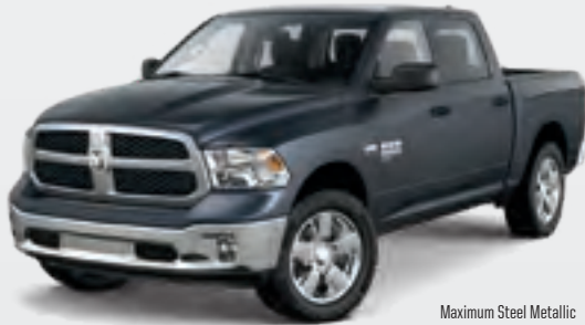
Maximum Steel Metallic