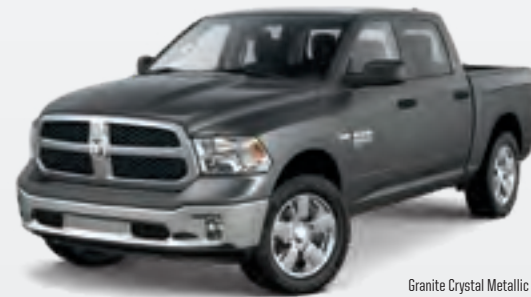
Granite Crystal Metallic