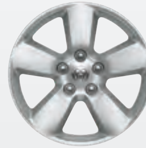
20-inch aluminum Standard on SXT Plus Available on Express and SLT (WHE)