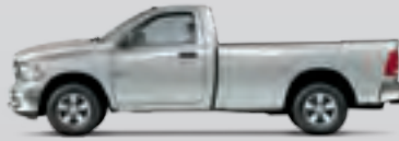
REGULAR CAB 8' BOX