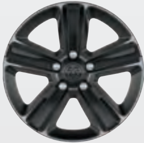
20-inch Semi Black-painted aluminum Standard on Warlock (WRL)