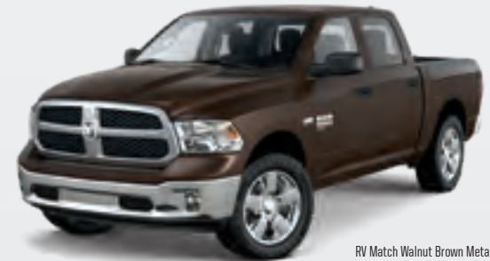
RV Match Walnut Brown Metallic Not available on Express®