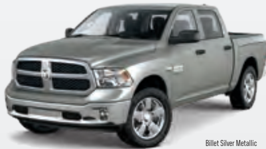
Billet Silver Metallic