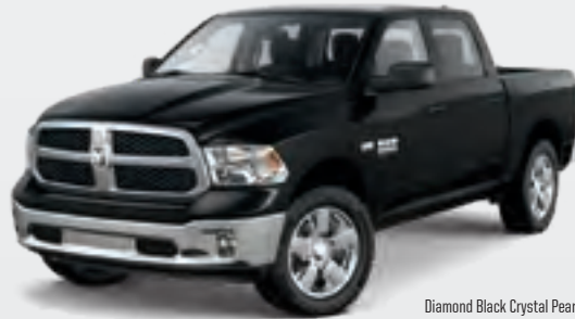
Diamond Black Crystal Pearl