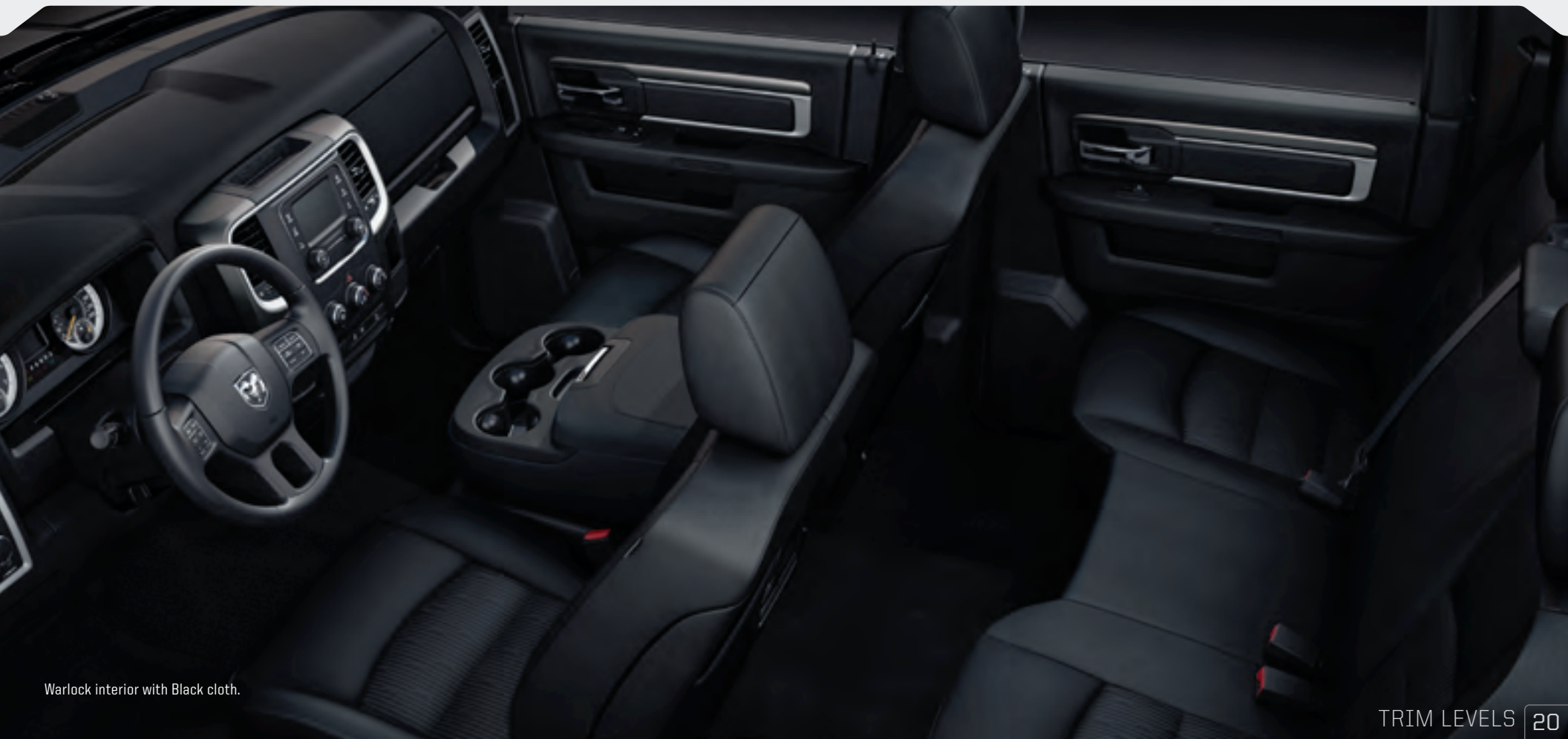
Warlock interior with Black cloth.