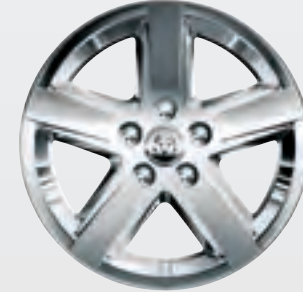
20-inch chrome-clad aluminum Available on Express (WR2)