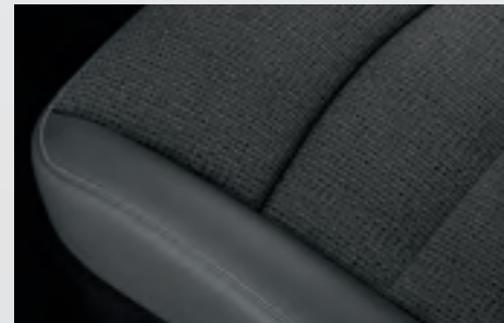
Premium Cloth – Diesel Grey SLT – Available