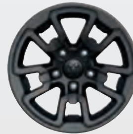
17-inch Matte Black-painted aluminum Available on Warlock with All-Terrain Package (WFF)