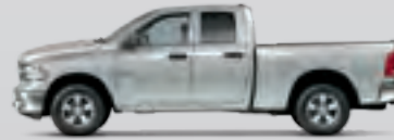
QUAD CAB® 6' 4" BOX