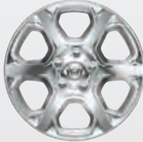
20-inch chrome-clad aluminum Available on SLT Plus Décor Group (WRG)