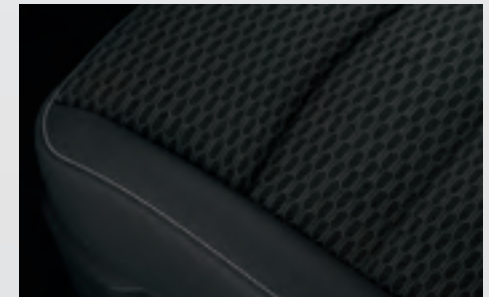
Cloth – Black Night Edition and Warlock – Standard