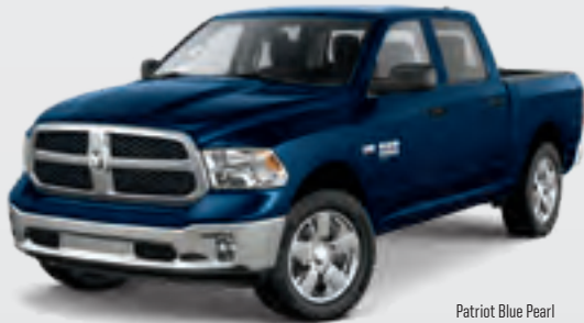
Patriot Blue Pearl