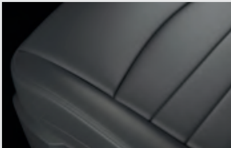
Heavy-Duty Vinyl – Diesel Grey ST – Standard