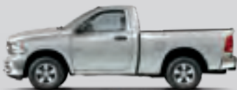
REGULAR CAB 6' 4" BOX