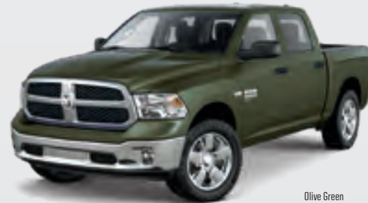
Olive Green Not available on Express