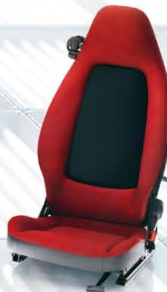
The new passion