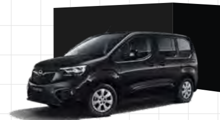
Onyx Black 1