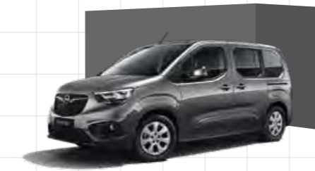
Moonstone Grey 3