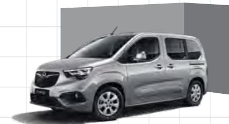
Quartz Grey 3