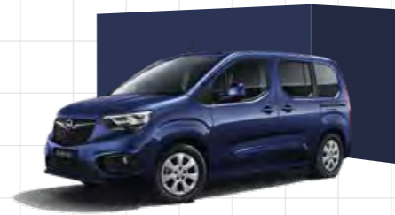
Night Blue 3