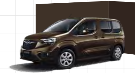
Cosmic Brown 4