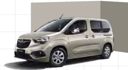
Cool Grey 3