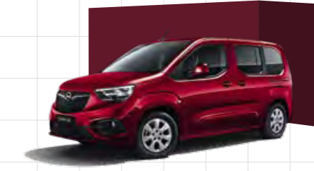
Ruby Red 2