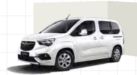
White Jade 1