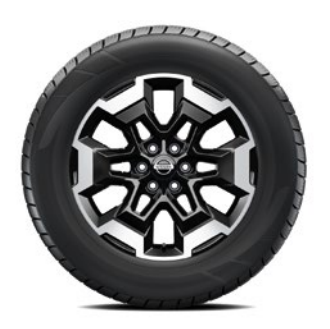
N-CONNECTA and TEKNA 18" ALLOY WHEELS