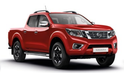
FLAME RED (S)