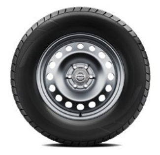
VISIA 17" STEEL WHEELS