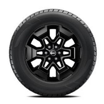
N-GUARD 18" BLACK ALLOY WHEELS