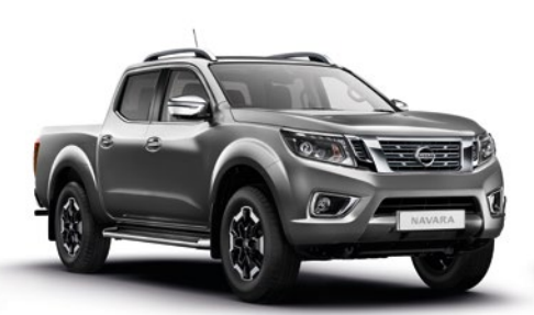
TWILIGHT GREY (M)