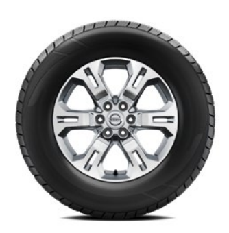
ACENTA 17" ALLOY WHEELS