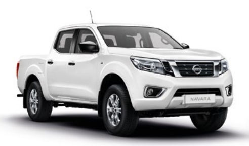
ALABASTER WHITE (S)