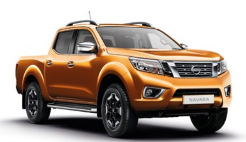
SAVANNAH YELLOW (M)