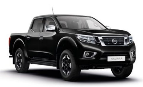
METALLIC BLACK (M)