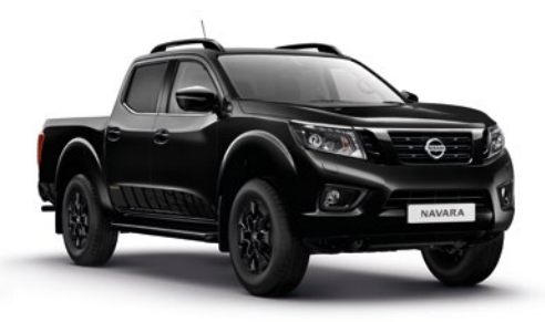
METALLIC BLACK (M)