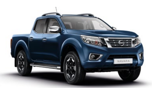
CAYMAN BLUE (M)