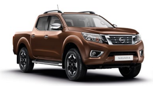
EARTH BRONZE (M)