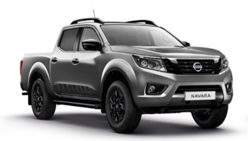
TWILIGHT GREY (M)