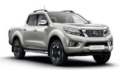
STARBURST SILVER (M)