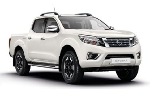
STORM WHITE (P)*